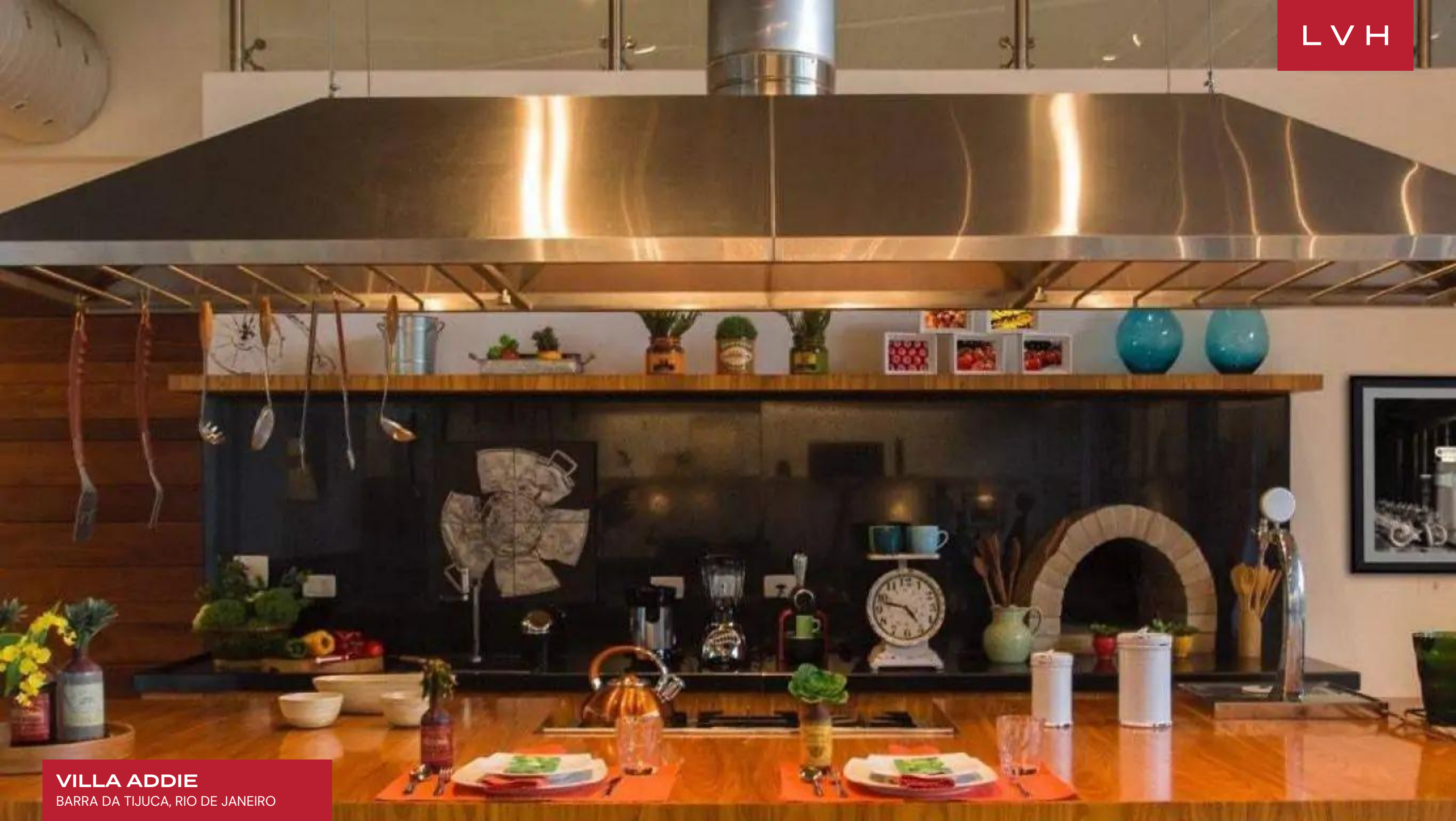
VILLA ADDIE BARRA DA TIJUCA, RIO DE JANEIRO