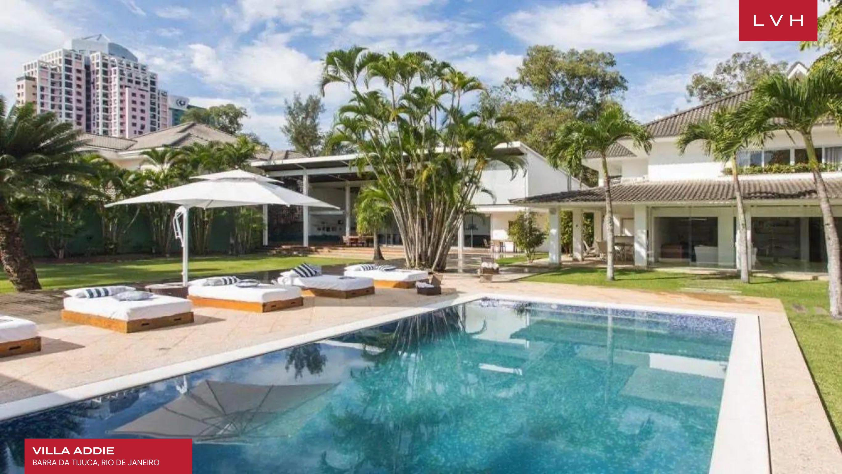
VILLA ADDIE BARRA DA TIJUCA, RIO DE JANEIRO