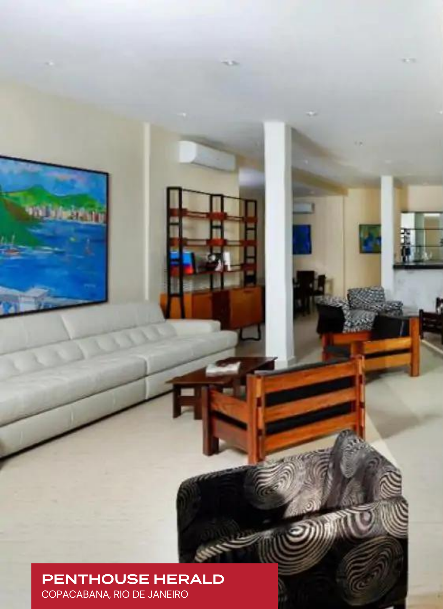
PENTHOUSE HERALD COPACABANA, RIO DE JANEIRO