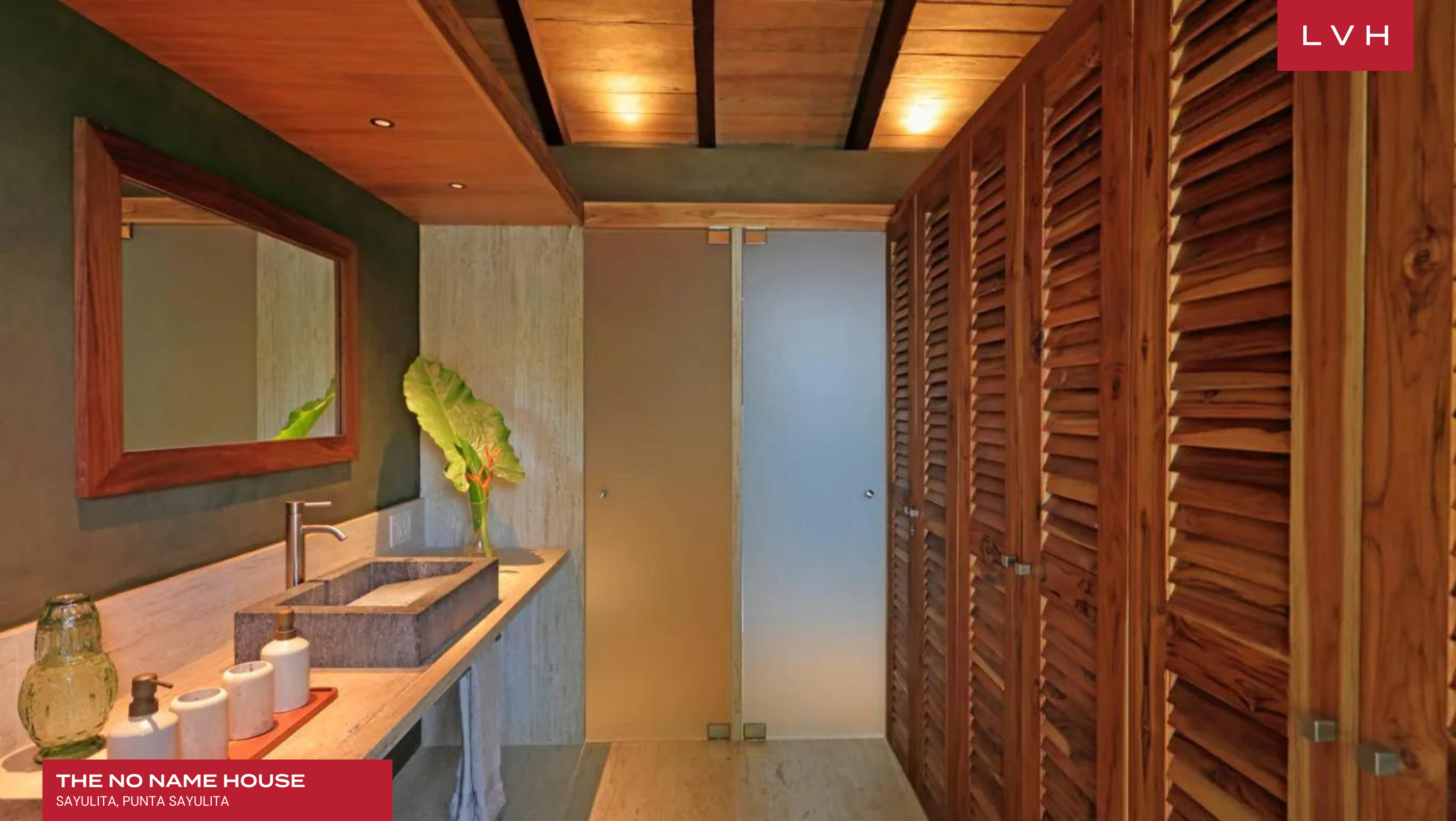
THE NO NAME HOUSE SAYULITA, PUNTA SAYULITA