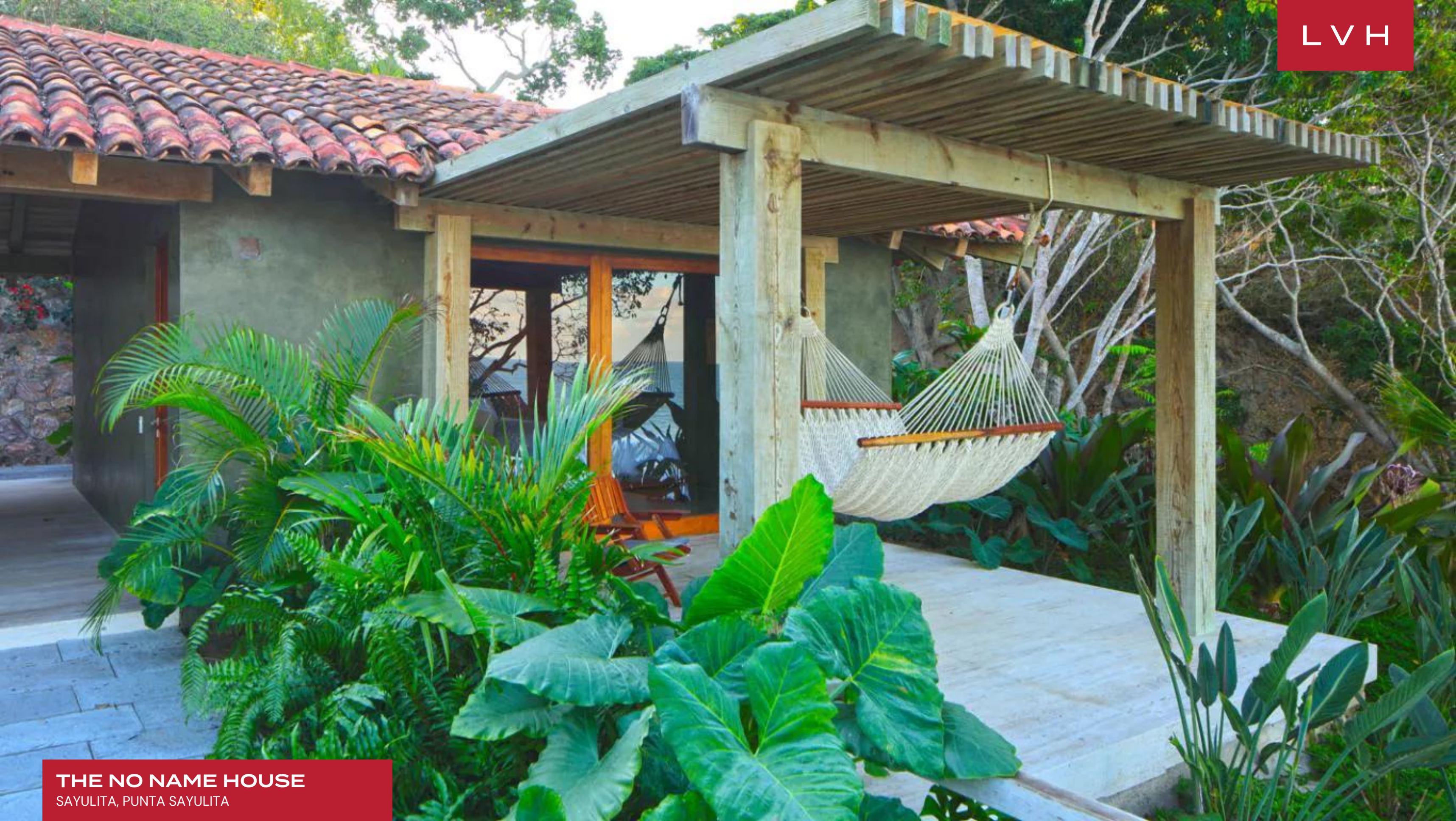
THE NO NAME HOUSE SAYULITA, PUNTA SAYULITA