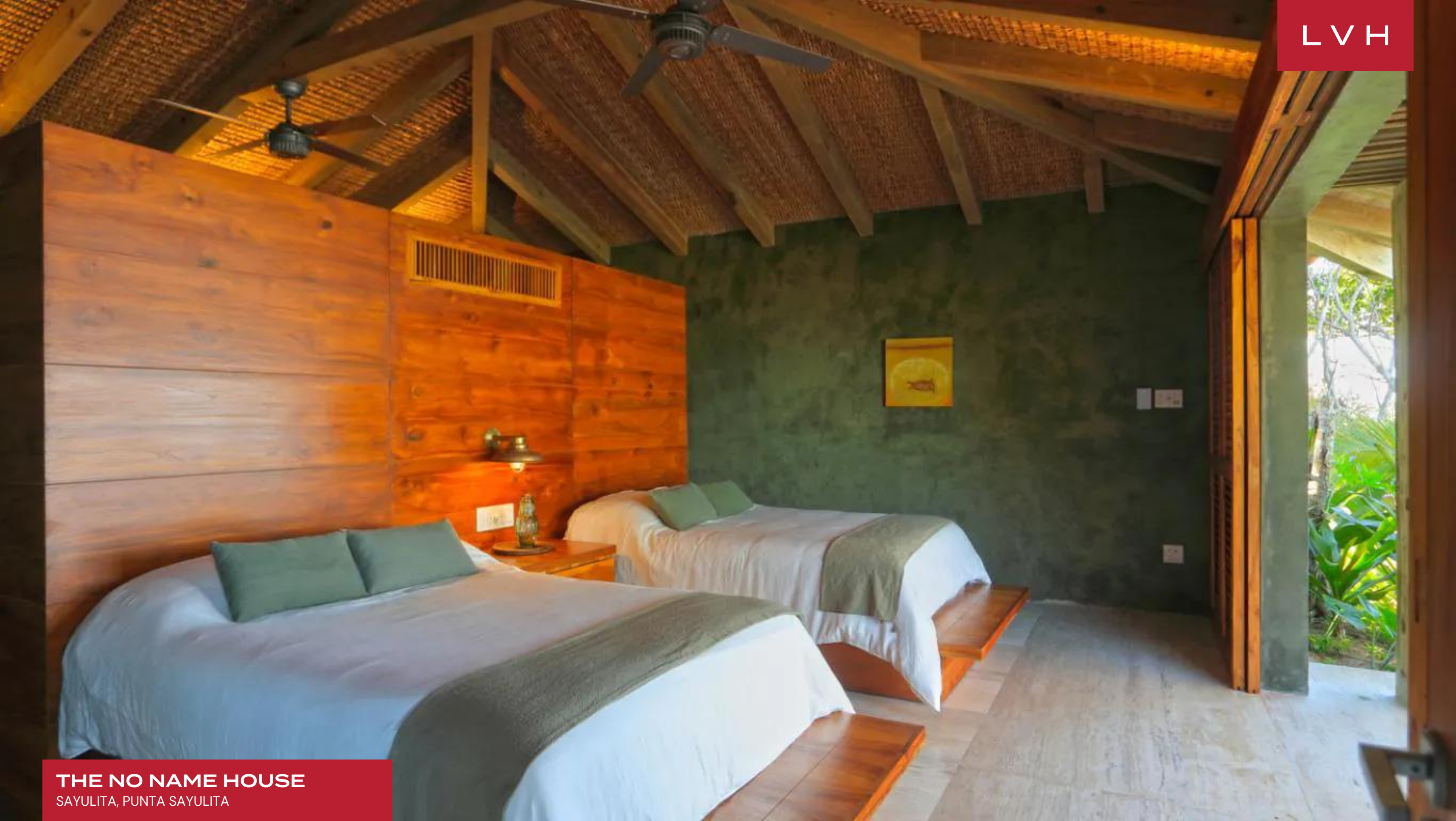
THE NO NAME HOUSE SAYULITA, PUNTA SAYULITA