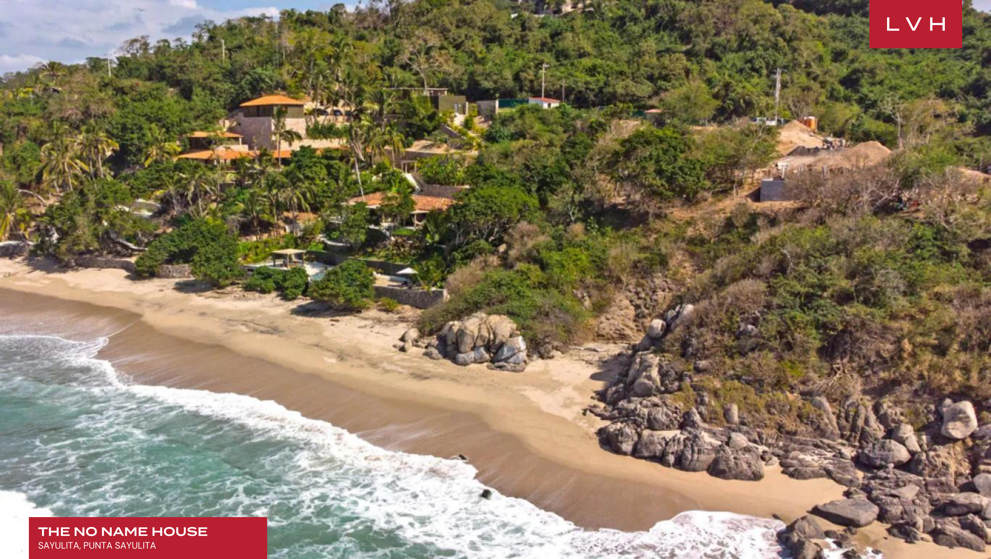
THE NO NAME HOUSE SAYULITA, PUNTA SAYULITA