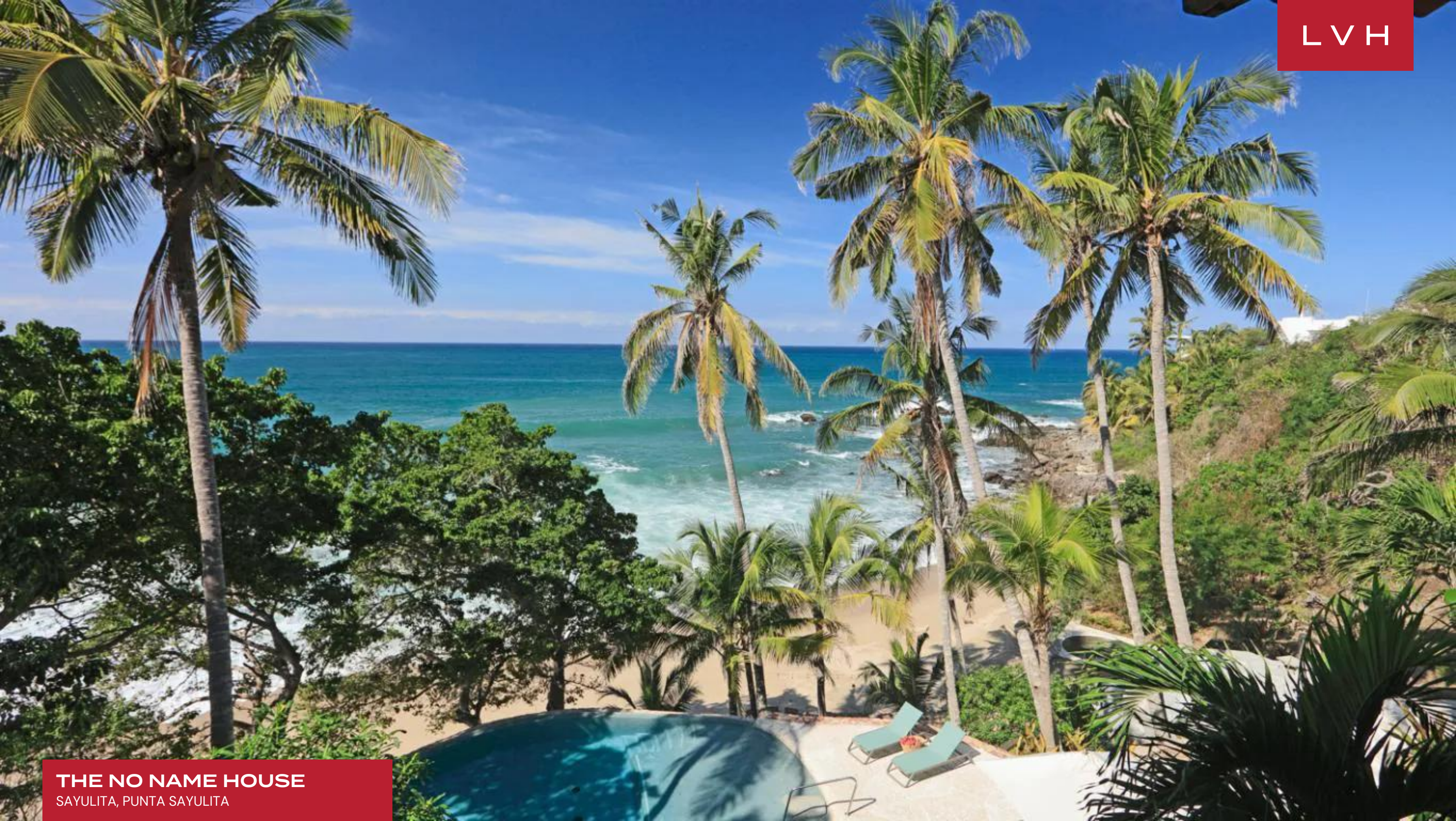
THE NO NAME HOUSE SAYULITA, PUNTA SAYULITA