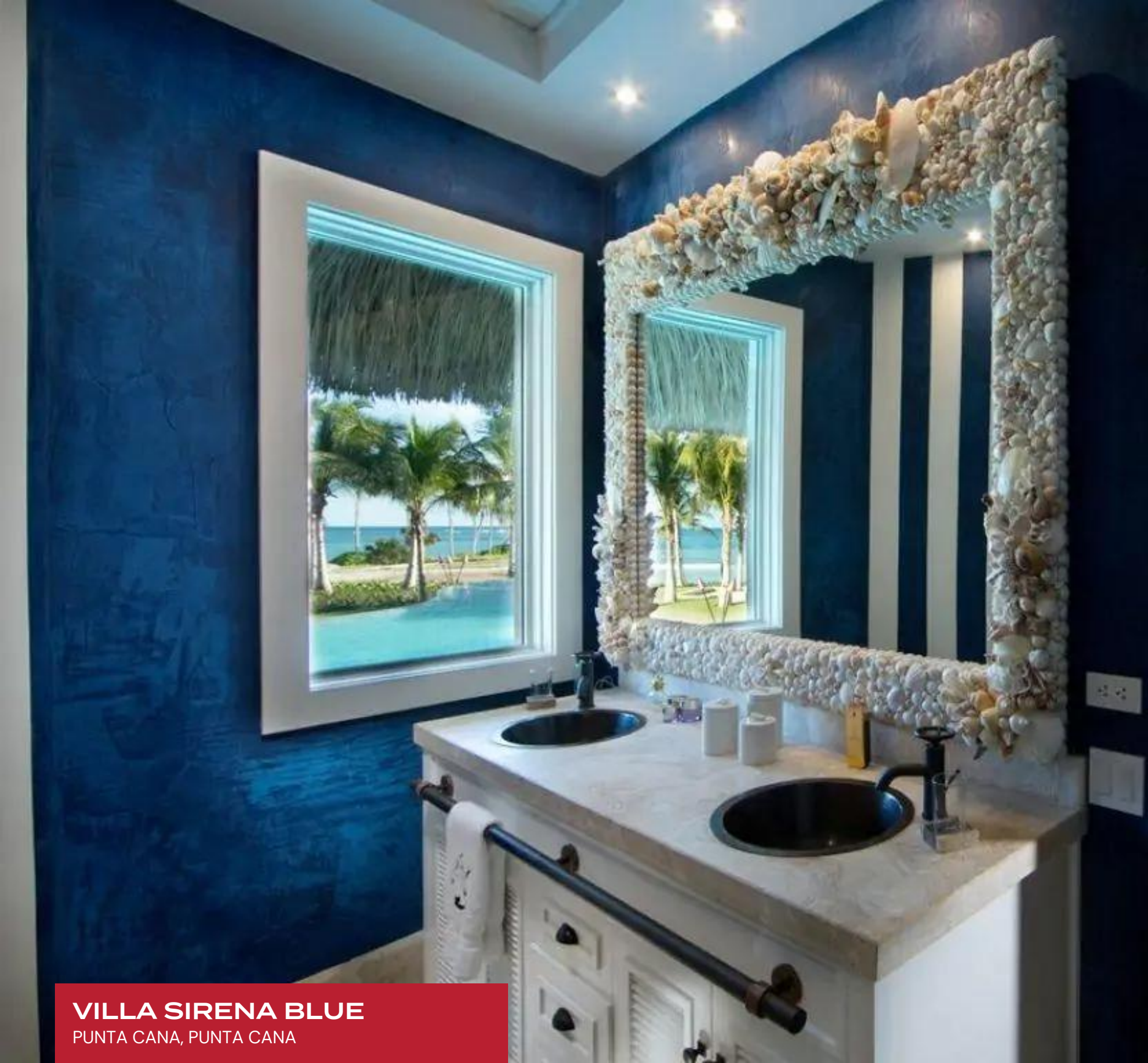
VILLA SIRENA BLUE PUNTA CANA, PUNTA CANA