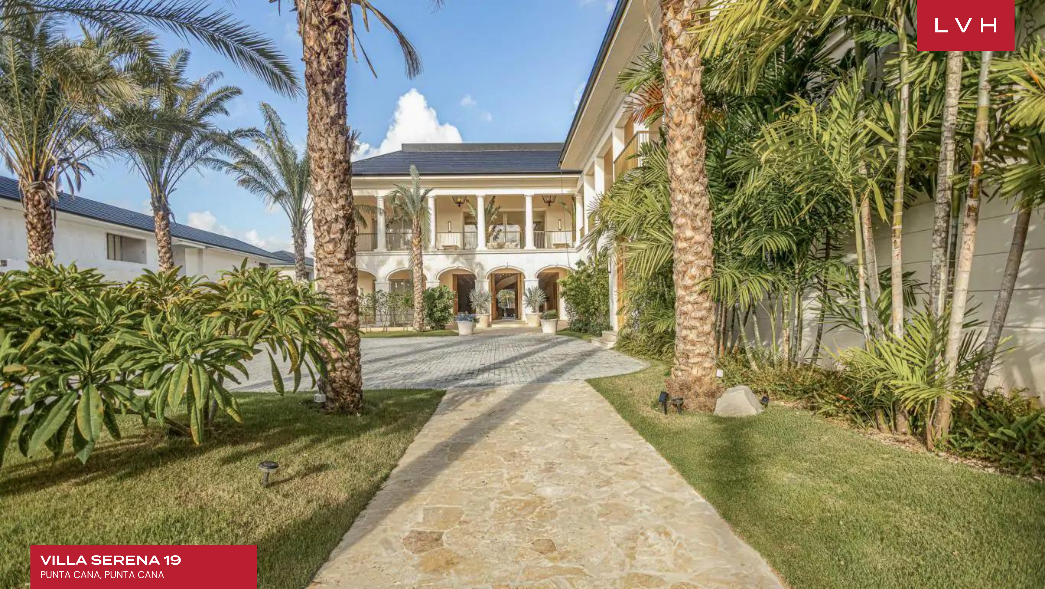
VILLA SERENA 19 PUNTA CANA, PUNTA CANA