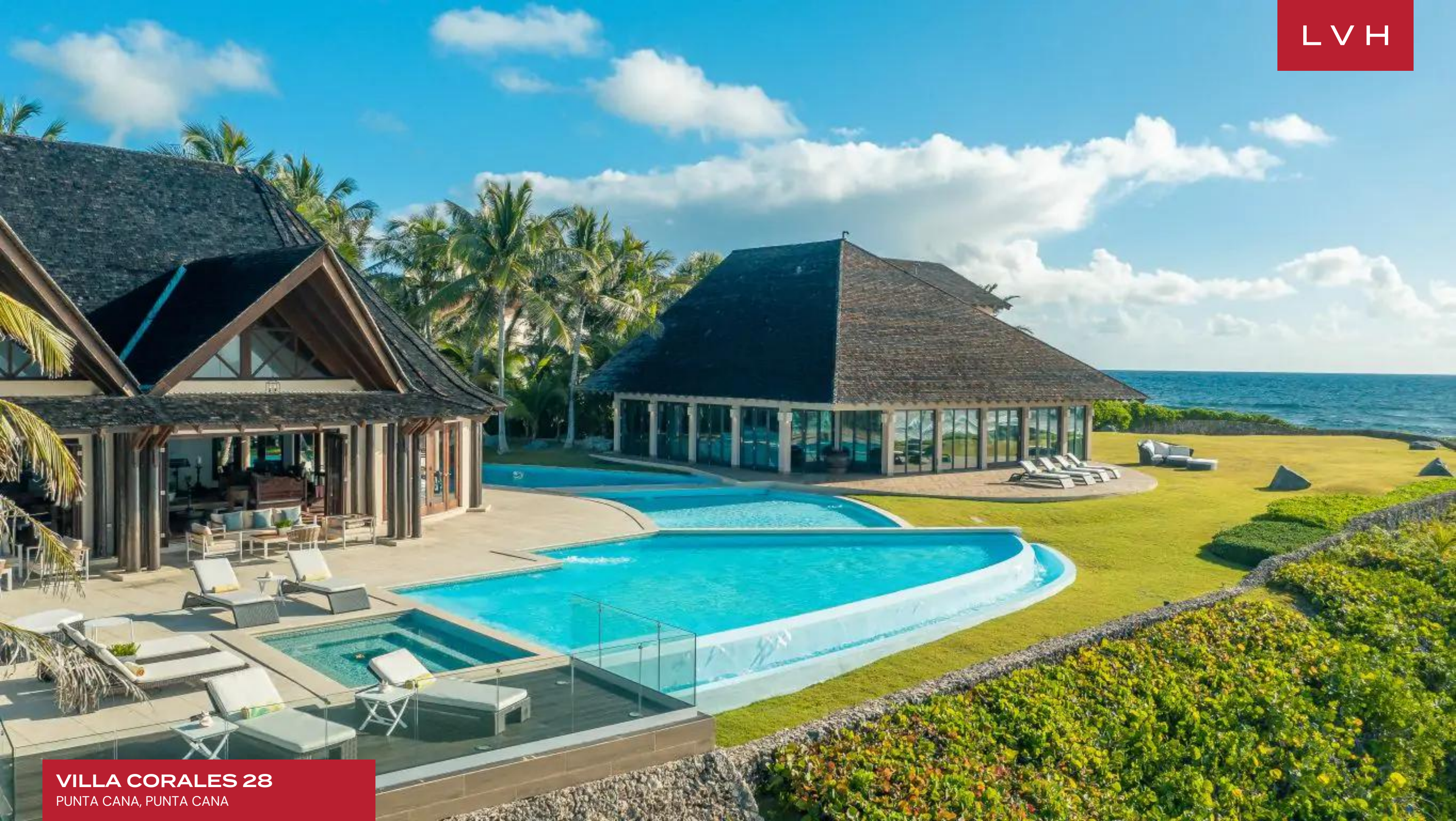
VILLA CORALES 28 PUNTA CANA, PUNTA CANA