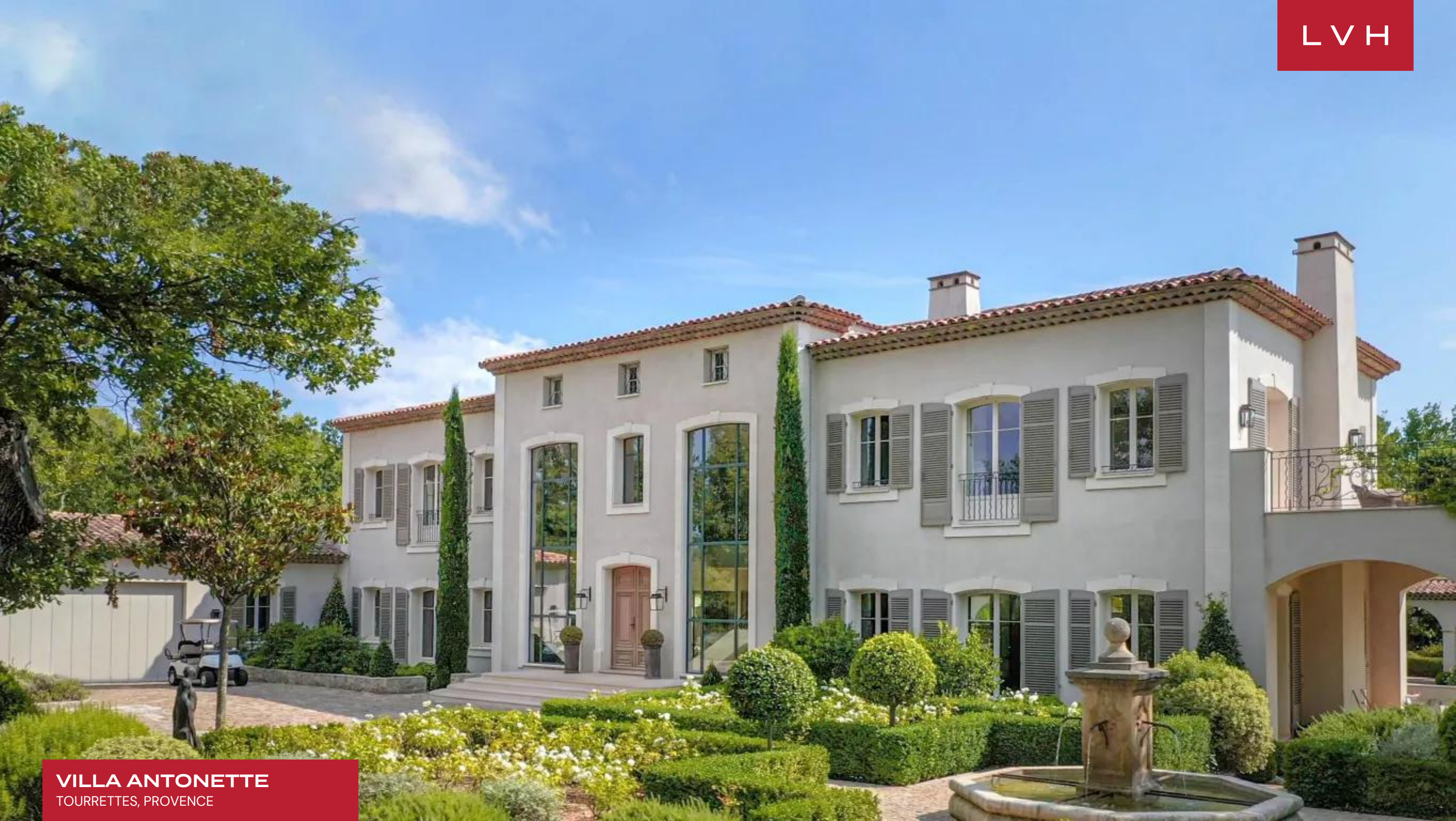
VILLA ANTONETTE TOURRETTES, PROVENCE