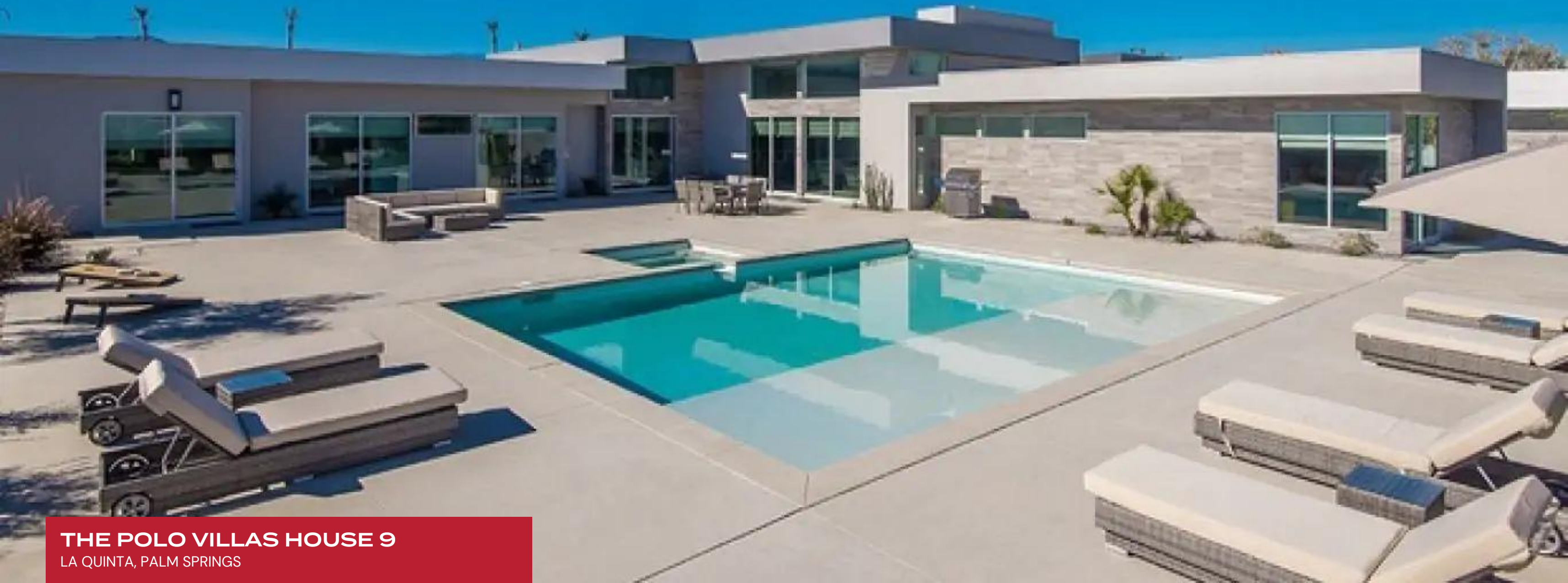
THE POLO VILLAS HOUSE 9 LA QUINTA, PALM SPRINGS