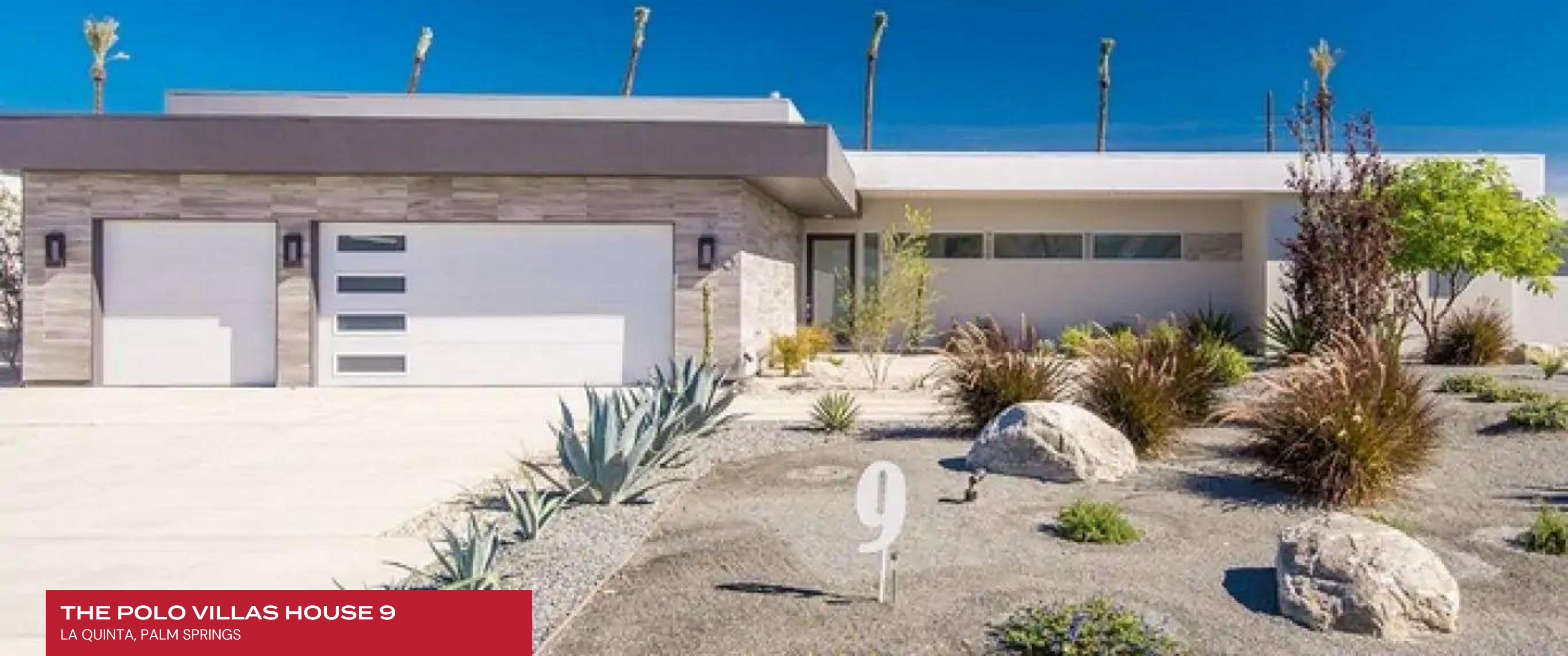
THE POLO VILLAS HOUSE 9 LA QUINTA, PALM SPRINGS