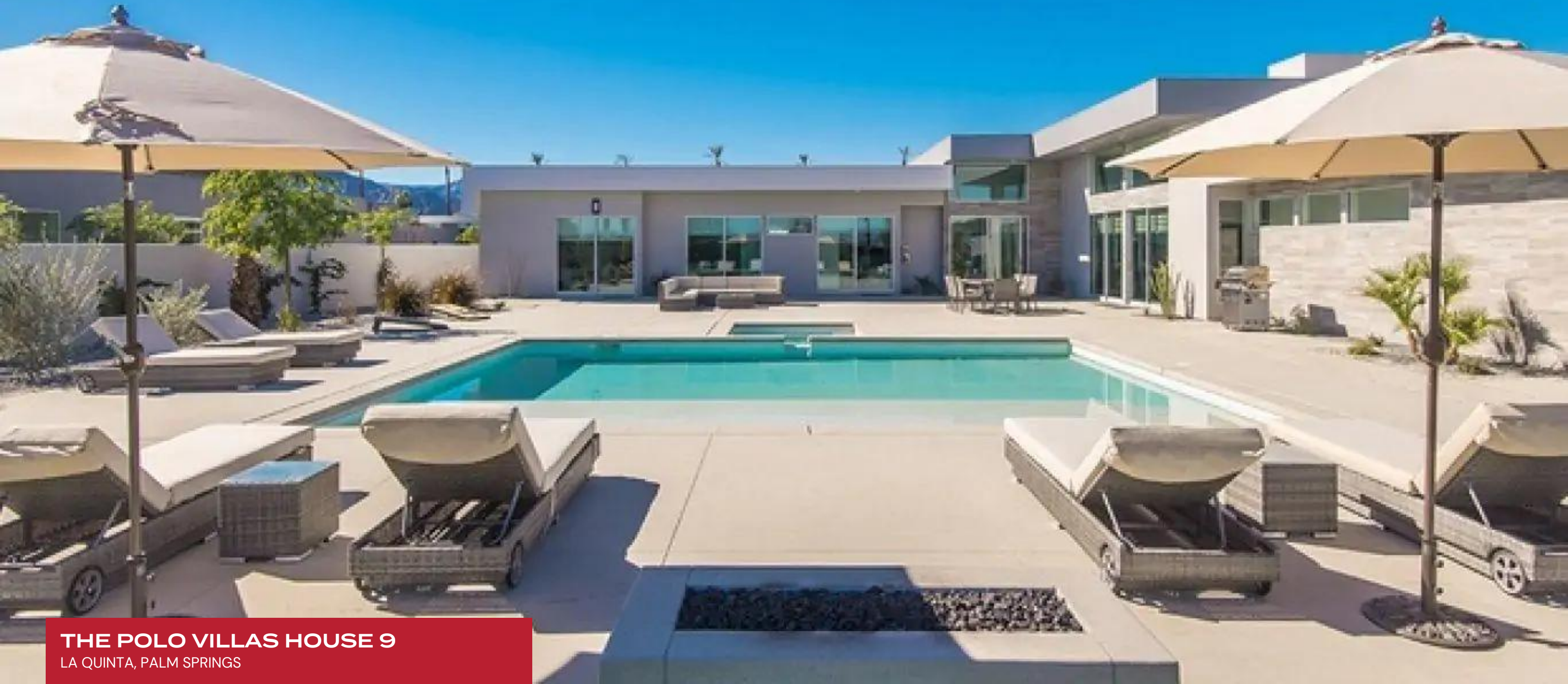
THE POLO VILLAS HOUSE 9 LA QUINTA, PALM SPRINGS