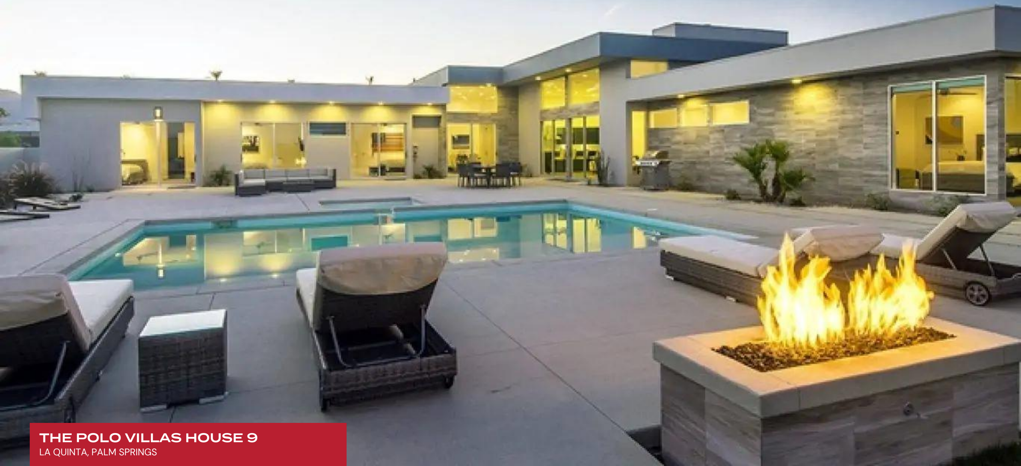
THE POLO VILLAS HOUSE 9 LA QUINTA, PALM SPRINGS