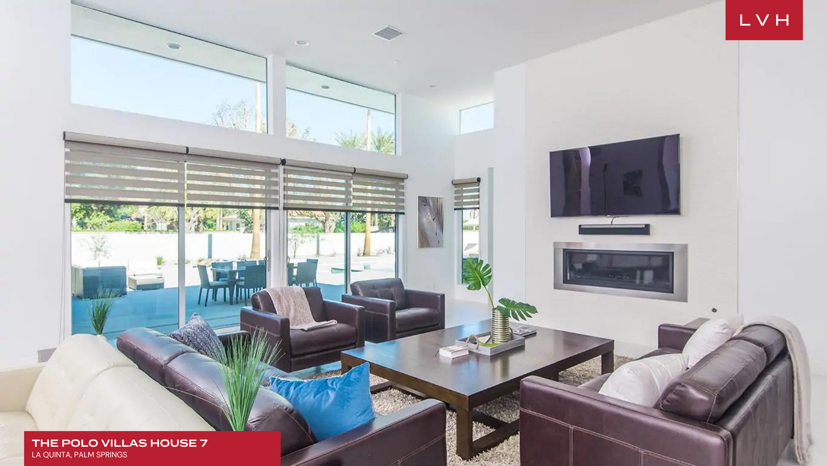
THE POLO VILLAS HOUSE 7 LA QUINTA, PALM SPRINGS