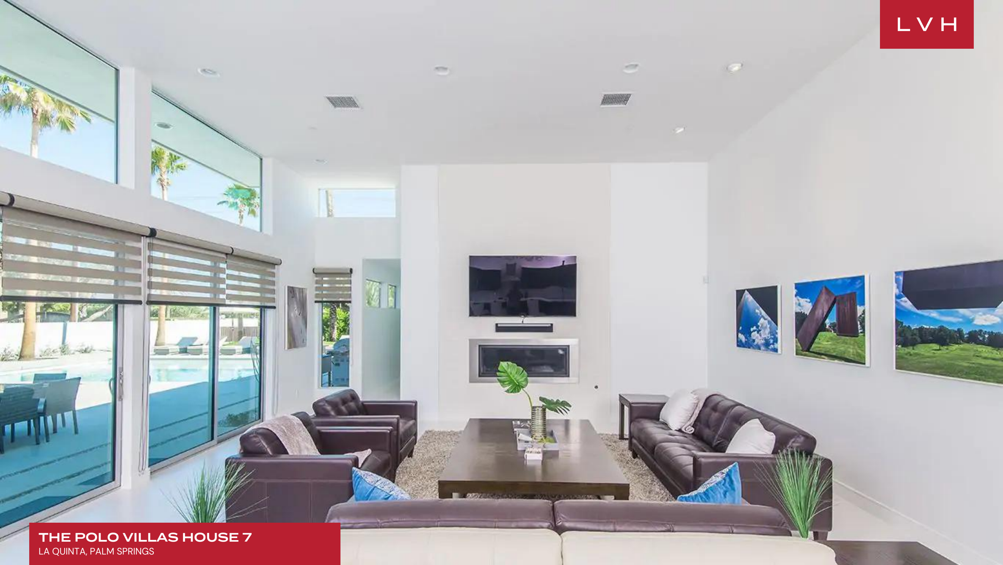
THE POLO VILLAS HOUSE 7 LA QUINTA, PALM SPRINGS