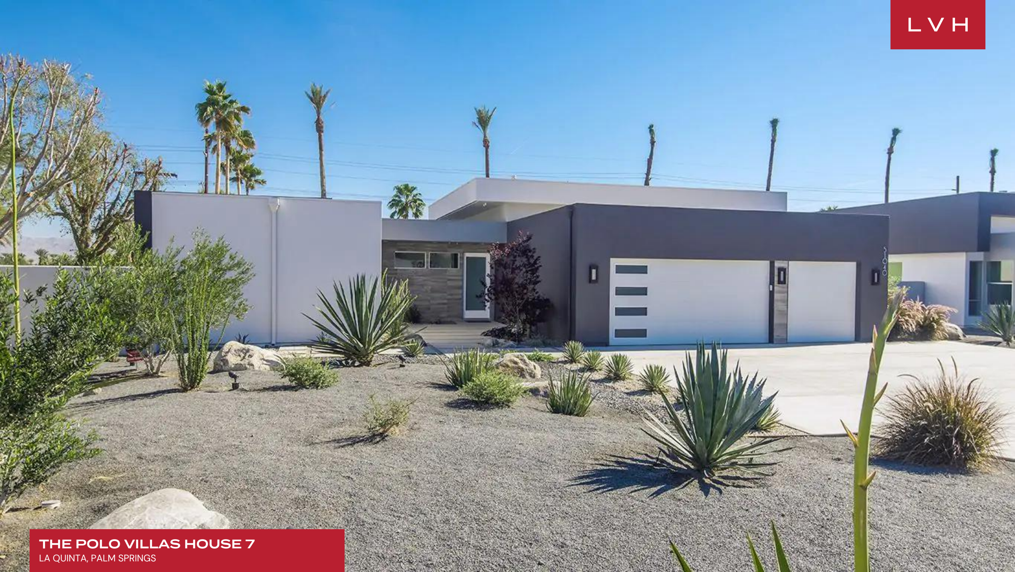
THE POLO VILLAS HOUSE 7 LA QUINTA, PALM SPRINGS