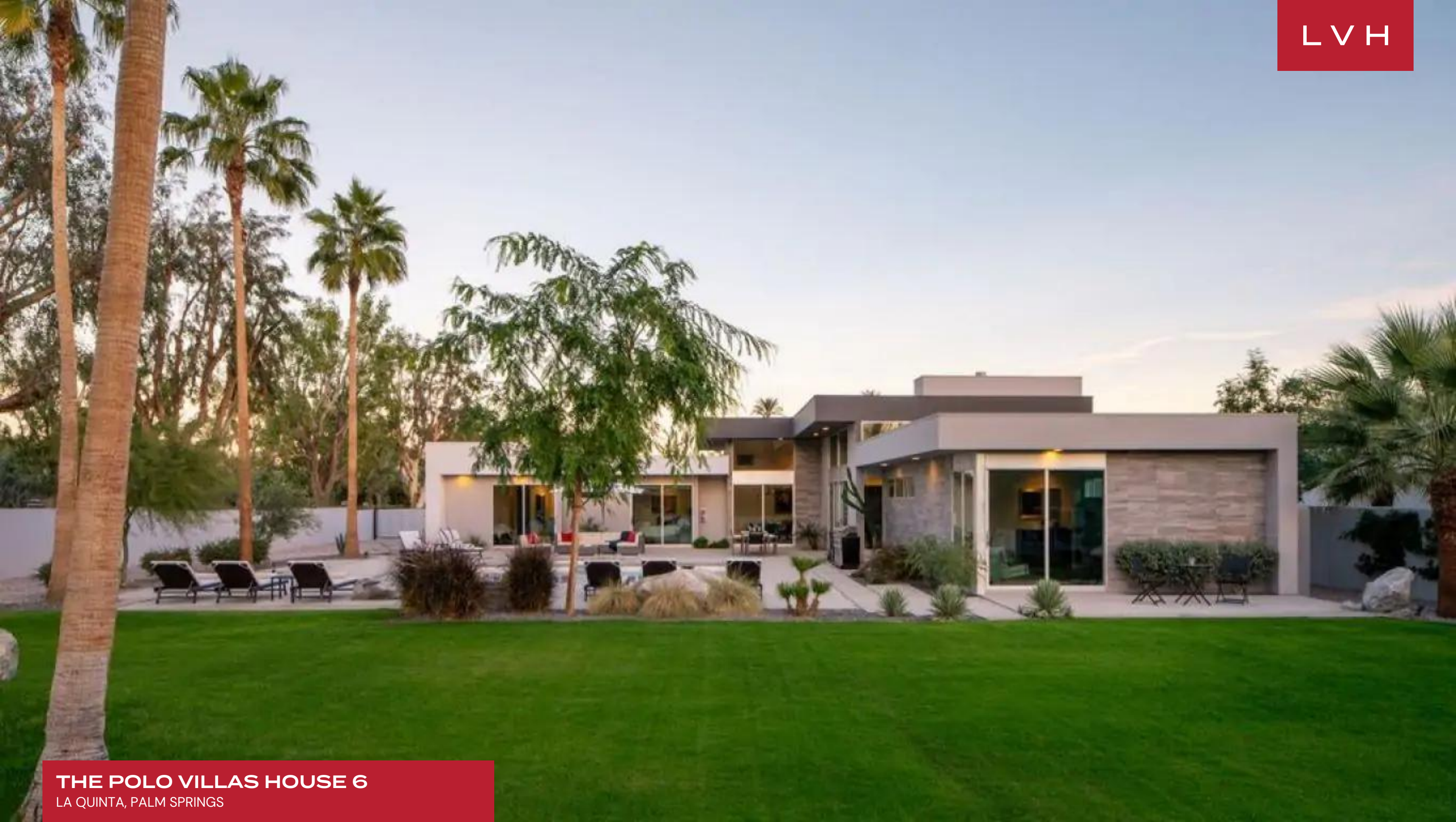
THE POLO VILLAS HOUSE 6 LA QUINTA, PALM SPRINGS