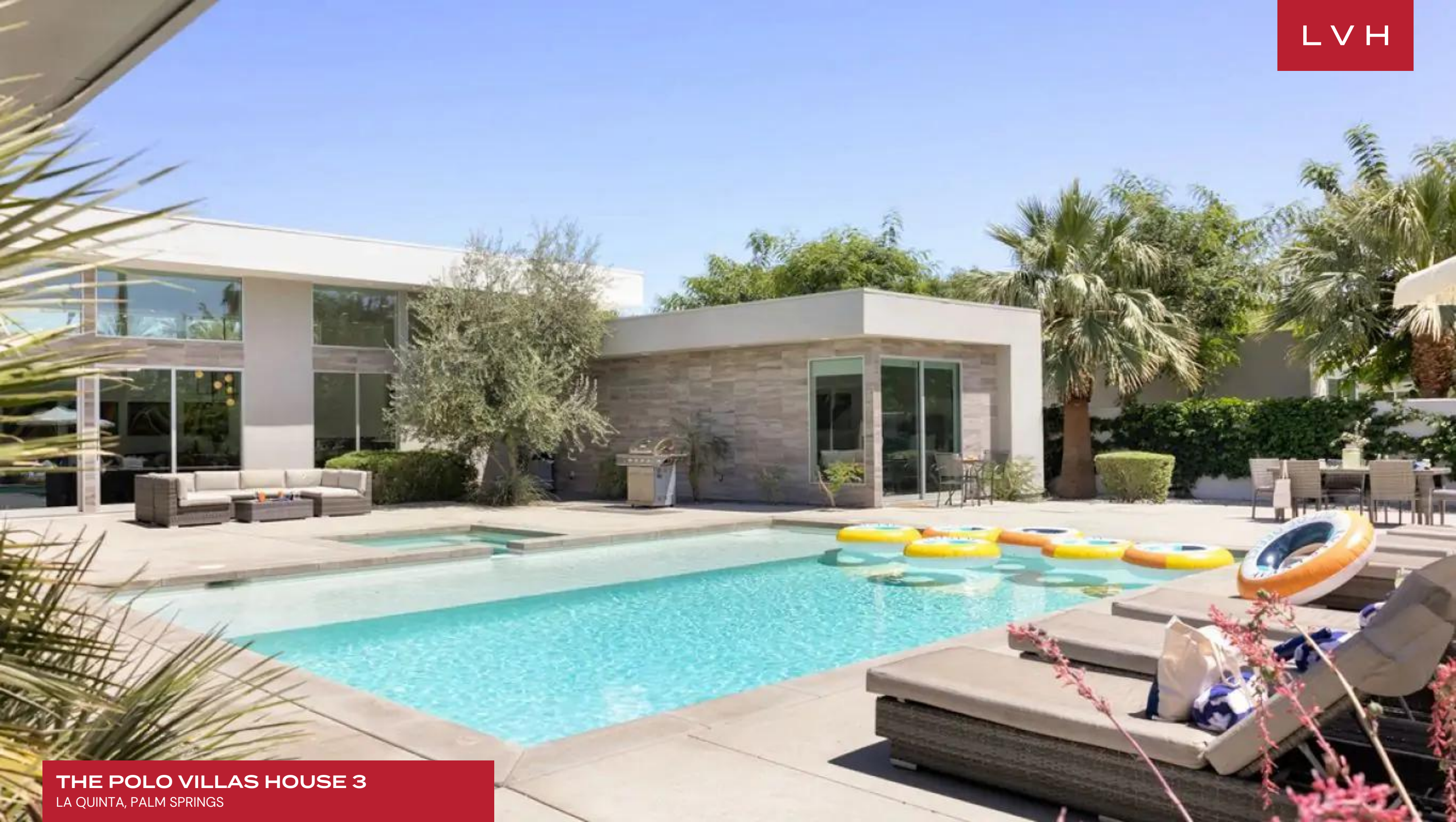
THE POLO VILLAS HOUSE 3 LA QUINTA, PALM SPRINGS