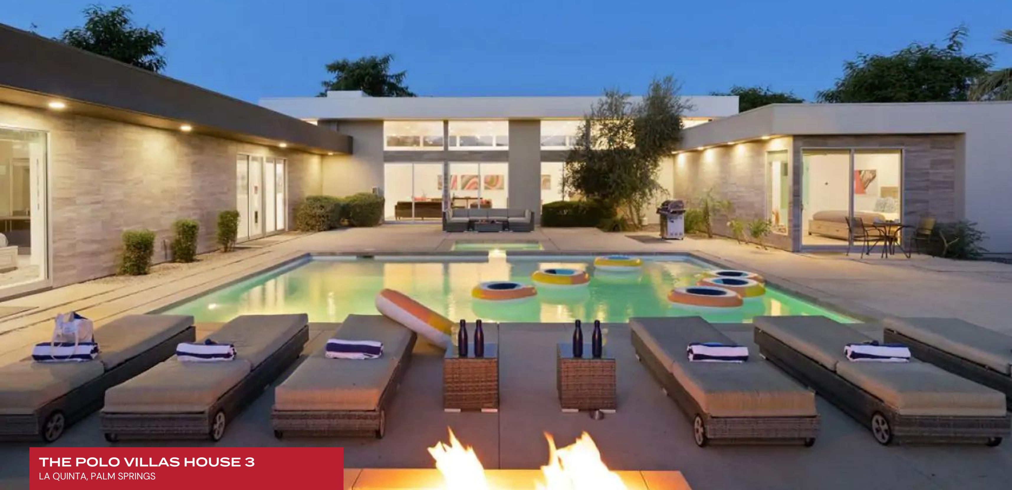
THE POLO VILLAS HOUSE 3 LA QUINTA, PALM SPRINGS