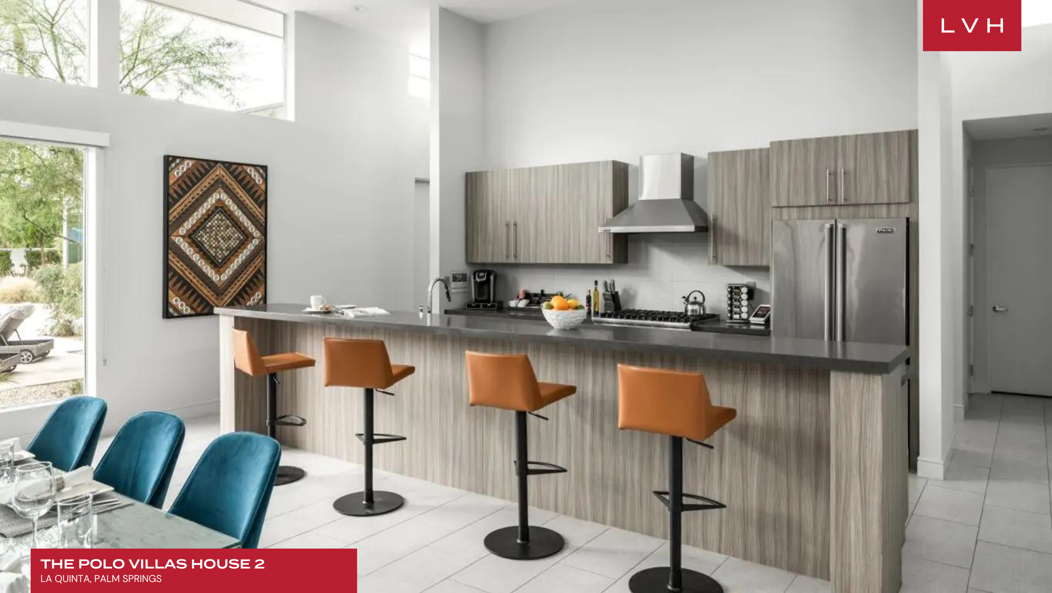
THE POLO VILLAS HOUSE 2 LA QUINTA, PALM SPRINGS