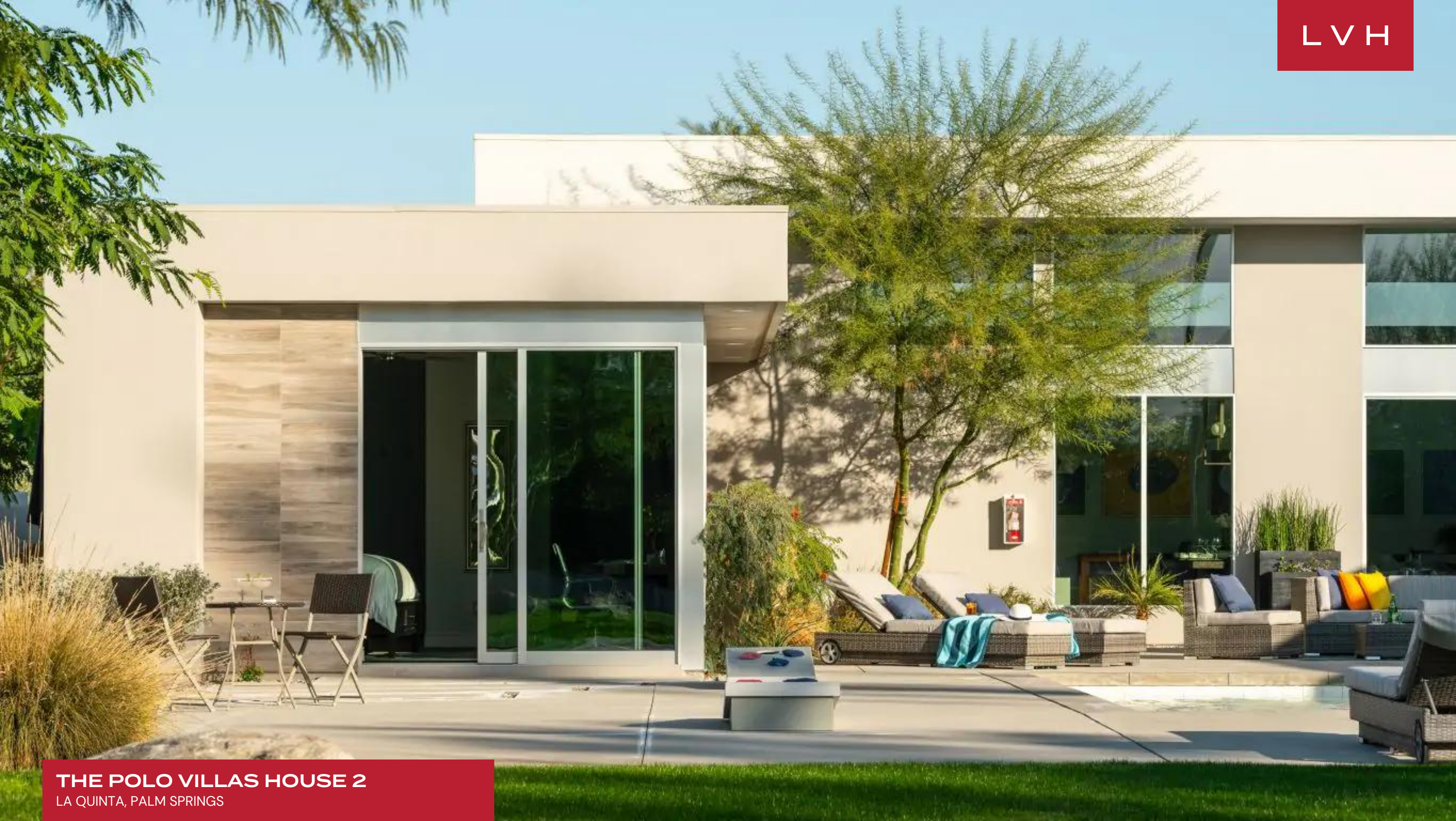
THE POLO VILLAS HOUSE 2 LA QUINTA, PALM SPRINGS