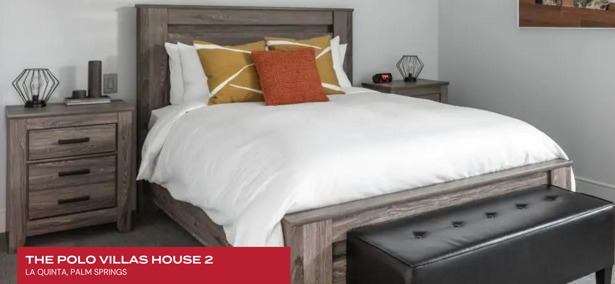
THE POLO VILLAS HOUSE 2 LA QUINTA, PALM SPRINGS