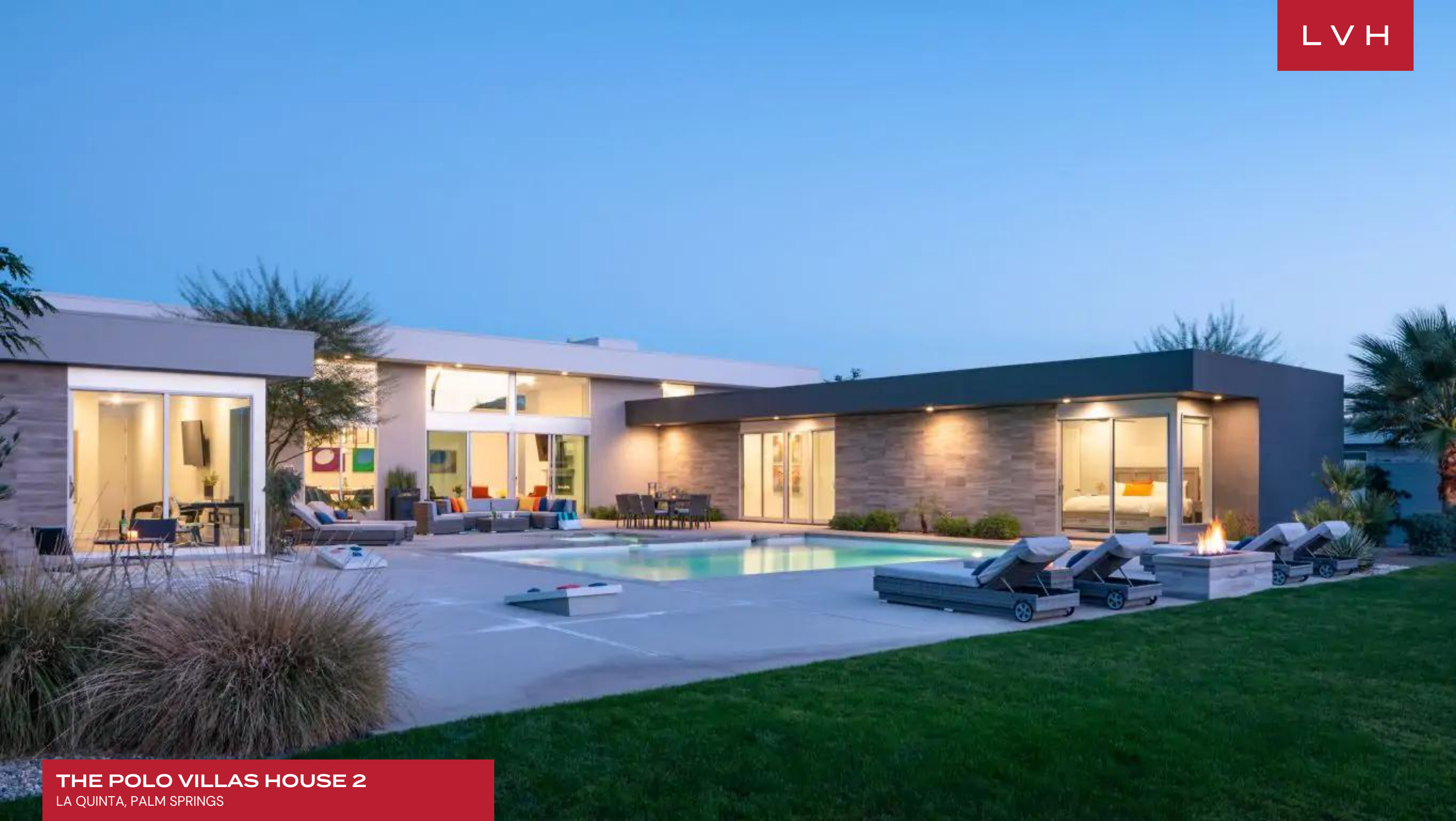
THE POLO VILLAS HOUSE 2 LA QUINTA, PALM SPRINGS