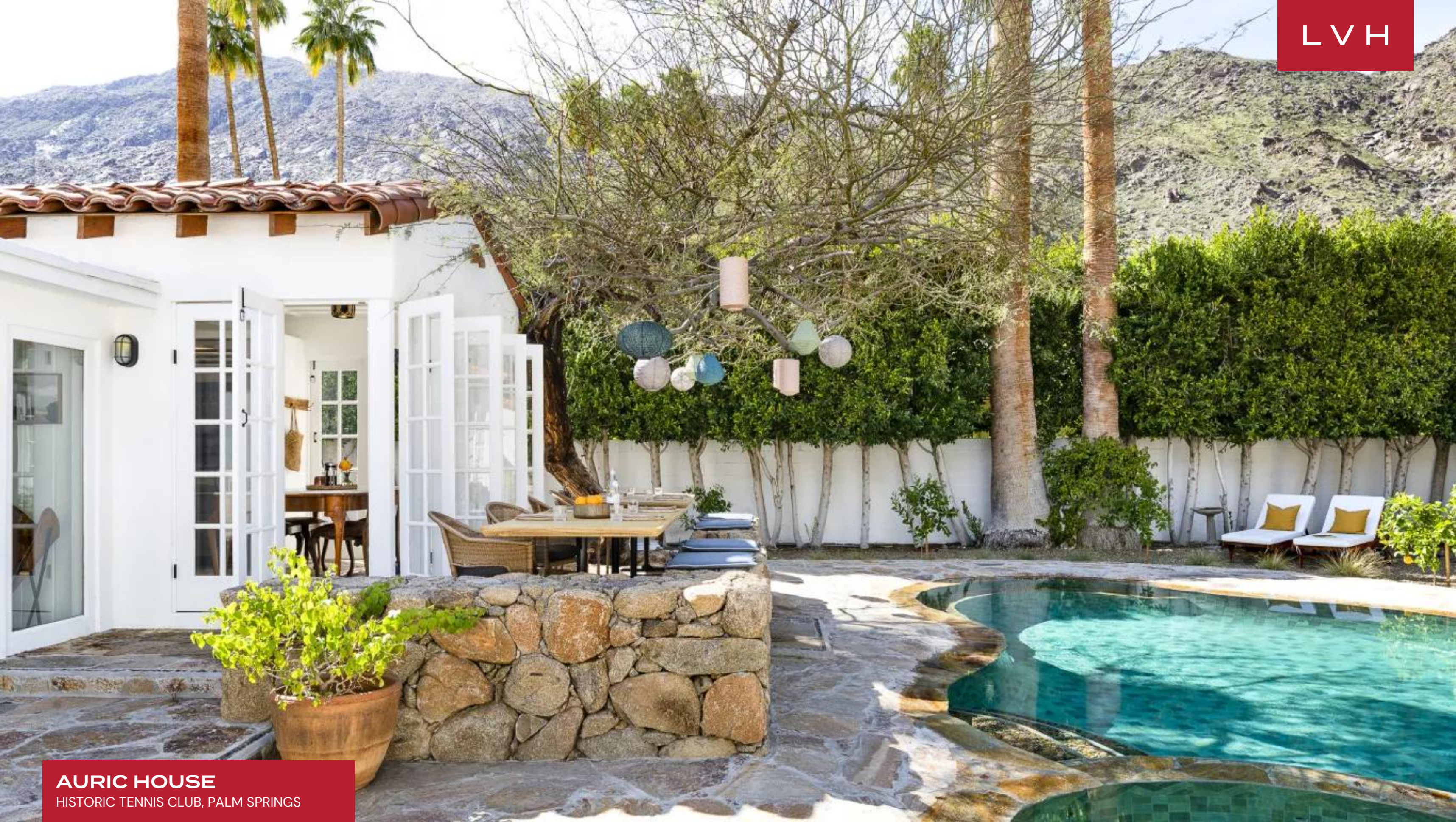
AURIC HOUSE HISTORIC TENNIS CLUB, PALM SPRINGS