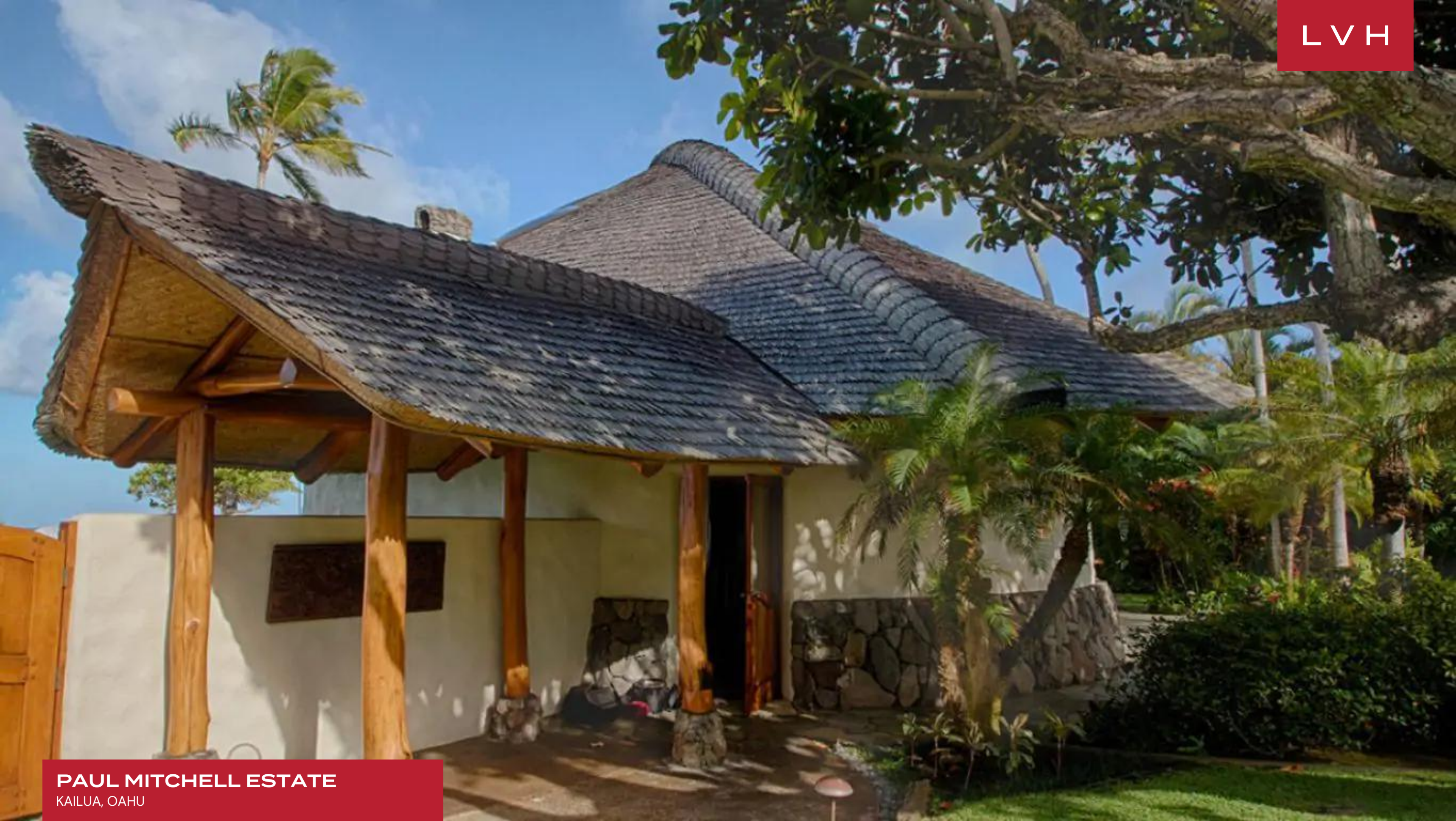
PAUL MITCHELL ESTATE KAILUA, OAHU