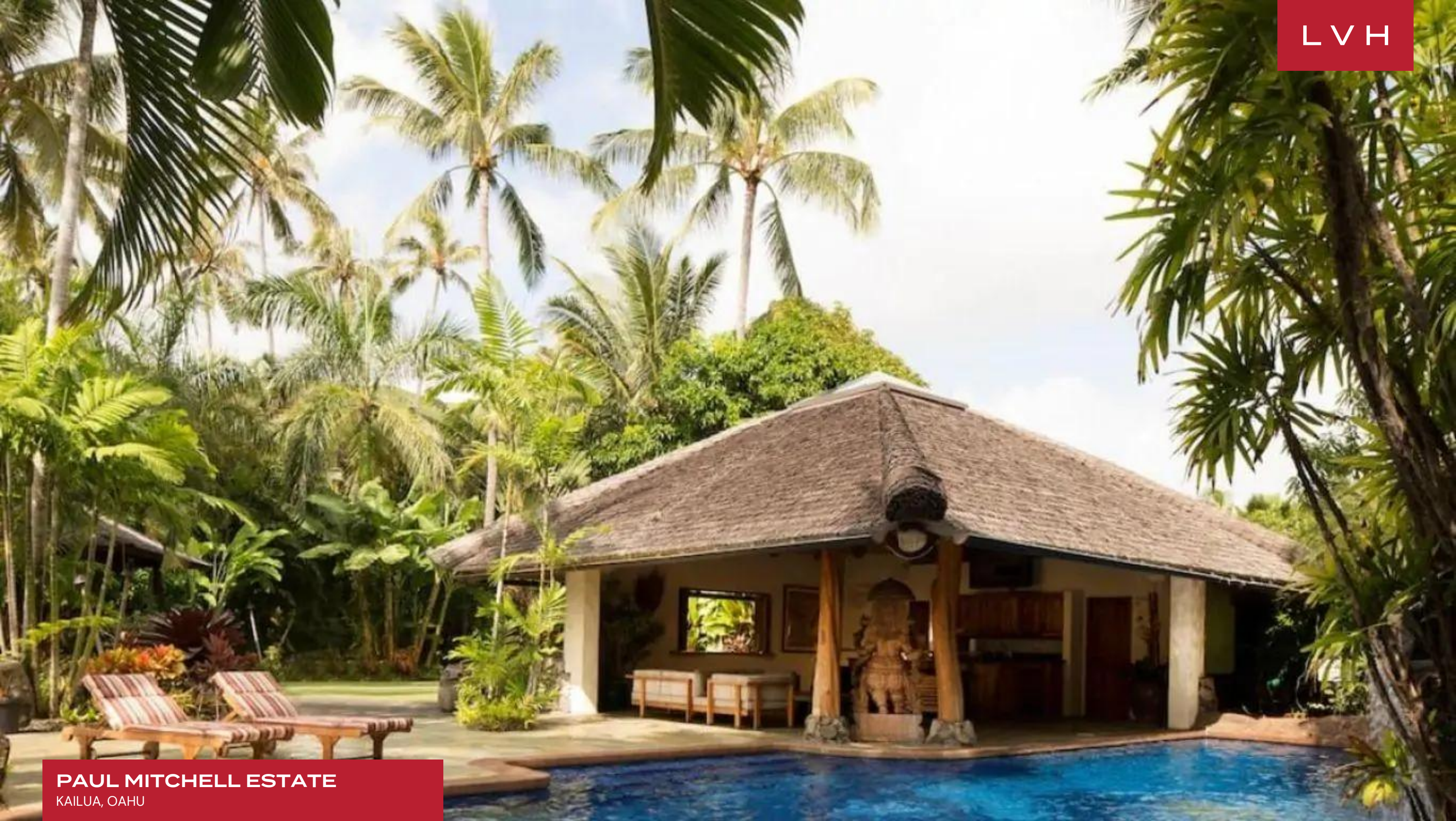
PAUL MITCHELL ESTATE KAILUA, OAHU