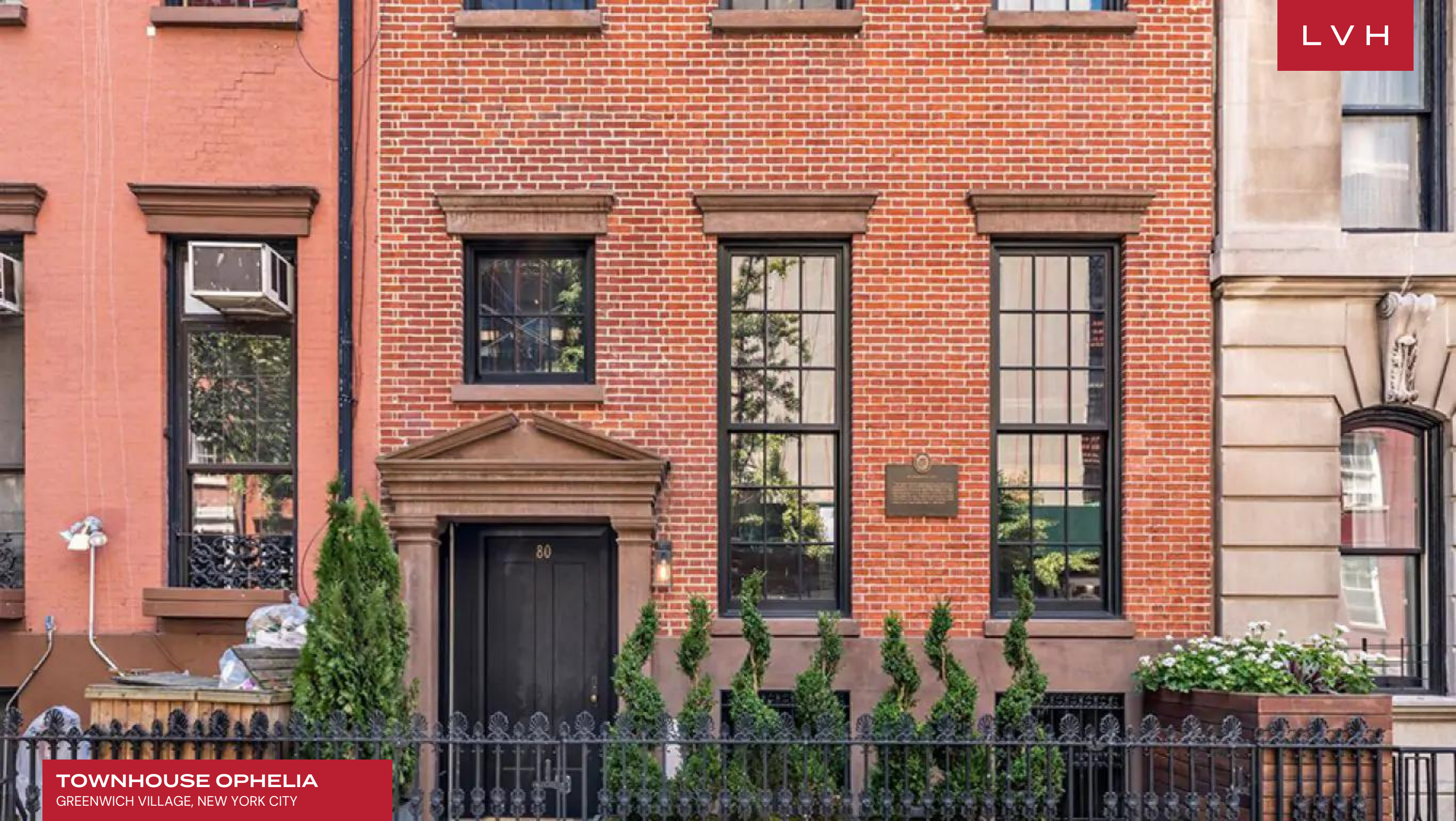
TOWNHOUSE OPHELIA GREENWICH VILLAGE, NEW YORK CITY