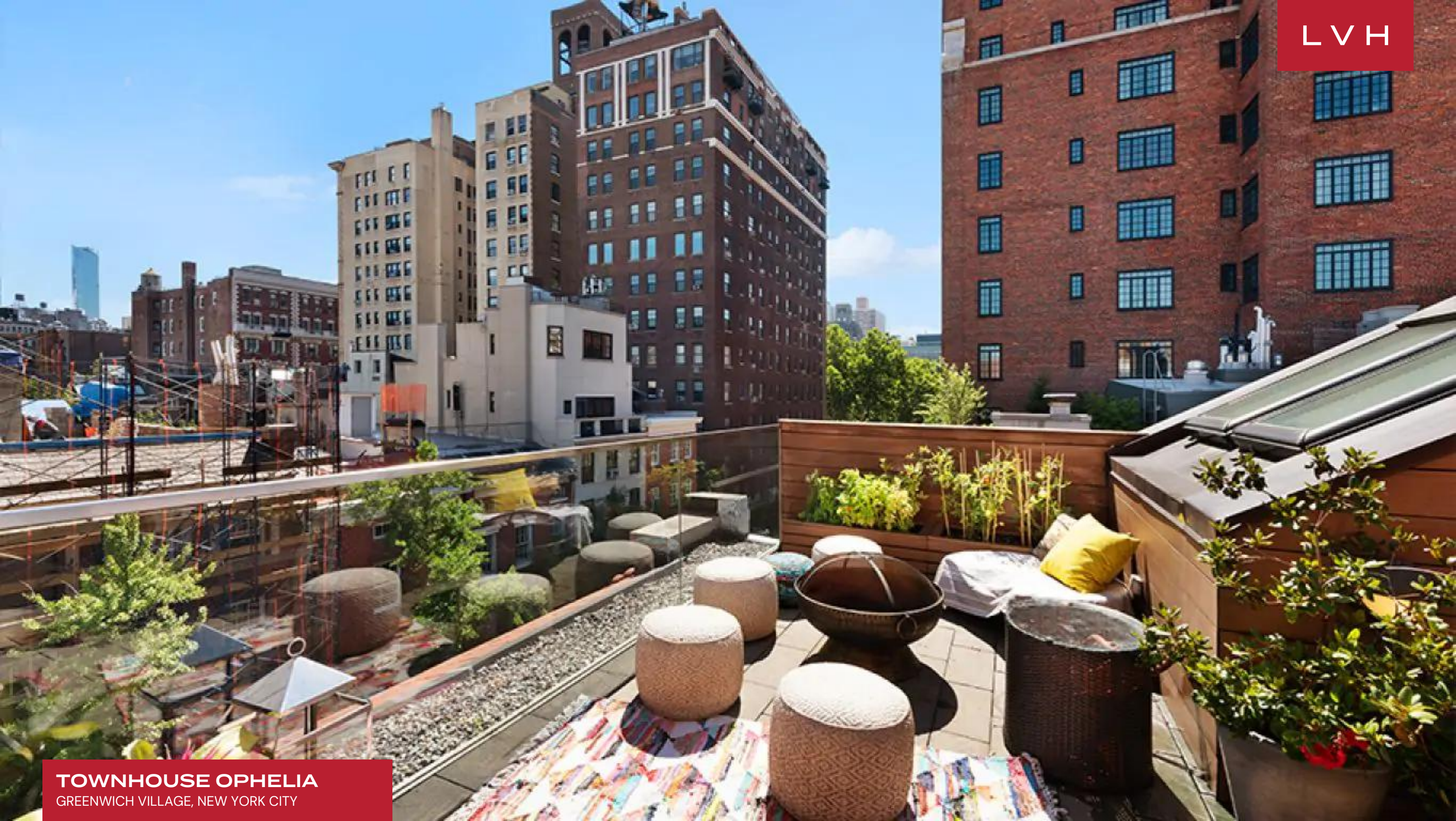
TOWNHOUSE OPHELIA GREENWICH VILLAGE, NEW YORK CITY