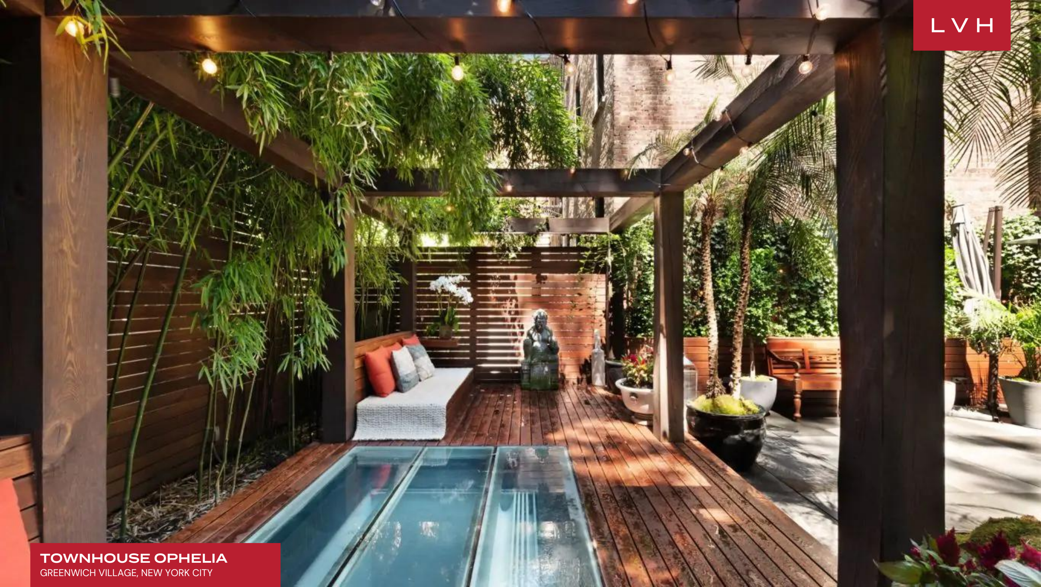
TOWNHOUSE OPHELIA GREENWICH VILLAGE, NEW YORK CITY