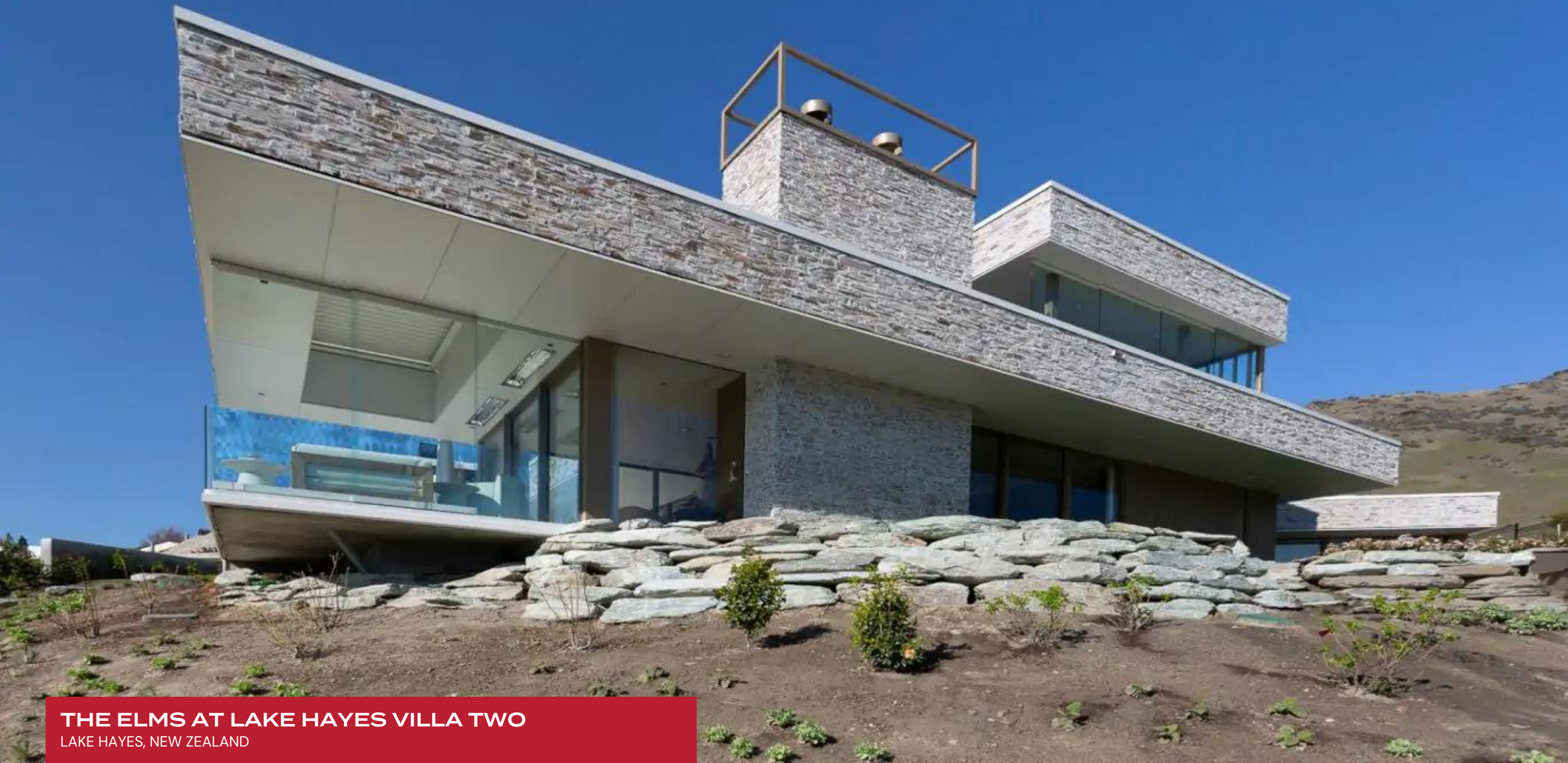
THE ELMS AT LAKE HAYES VILLA TWO LAKE HAYES, NEW ZEALAND