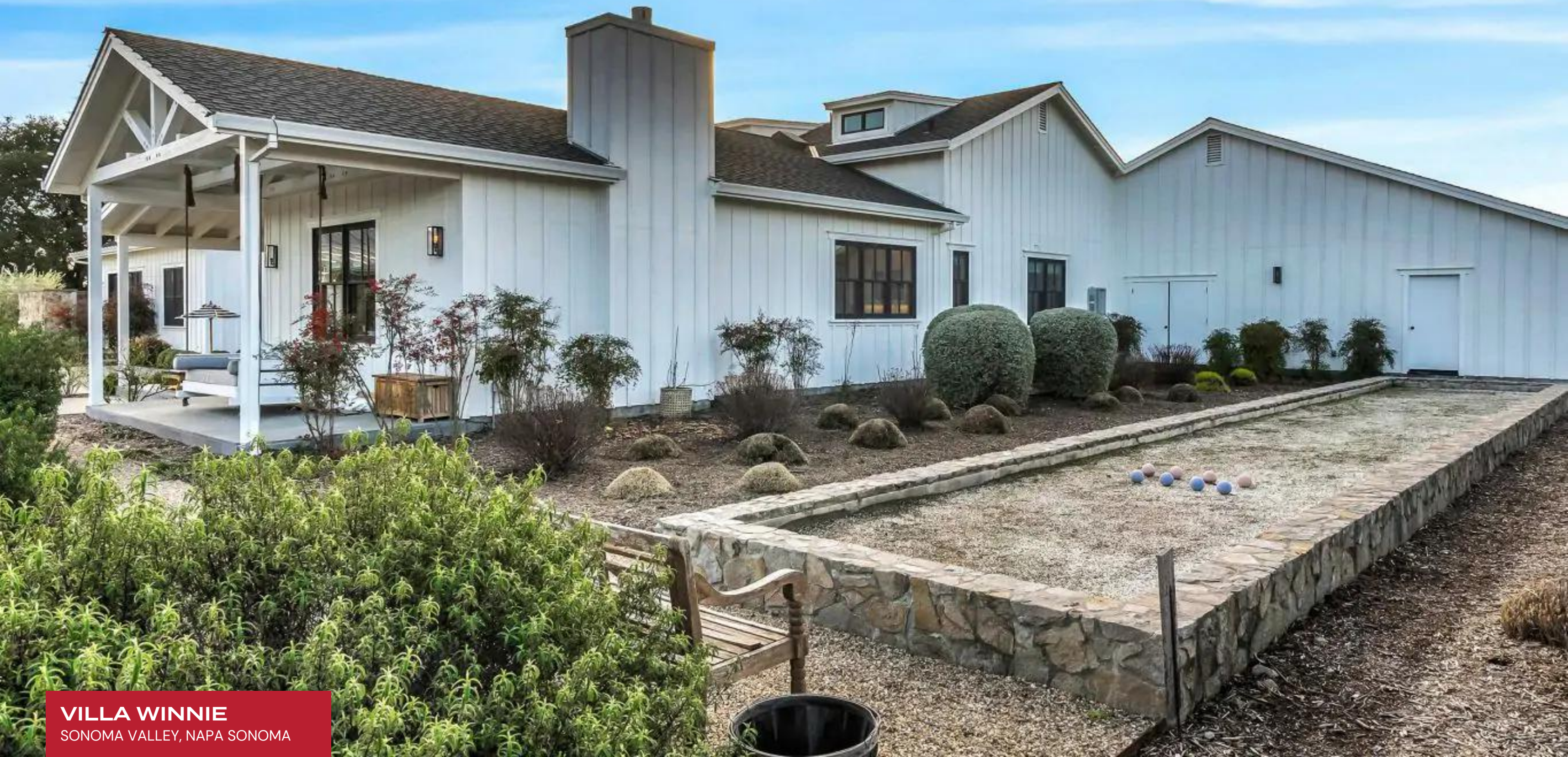
VILLA WINNIE SONOMA VALLEY, NAPA SONOMA