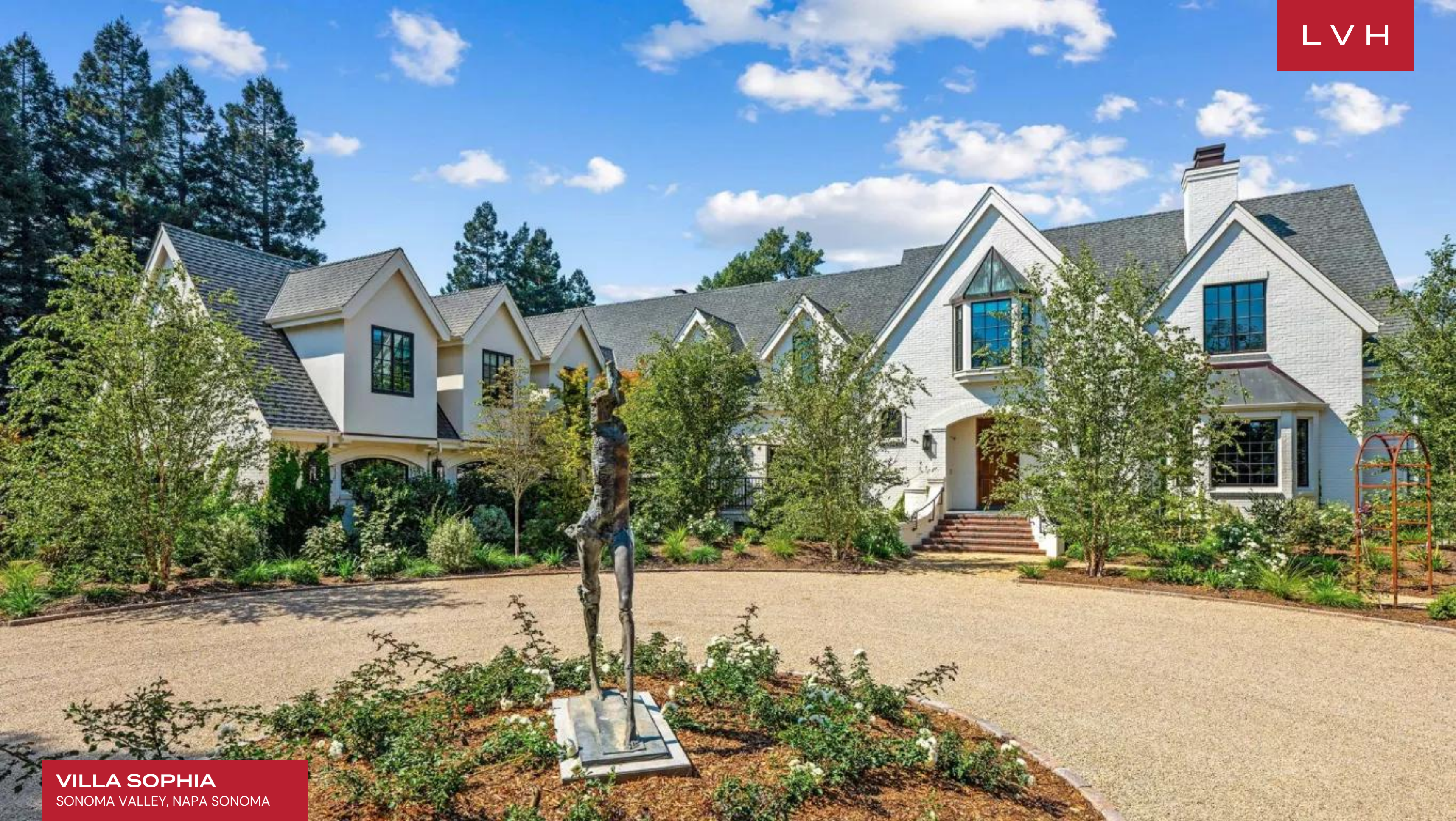
VILLA SOPHIA SONOMA VALLEY, NAPA SONOMA