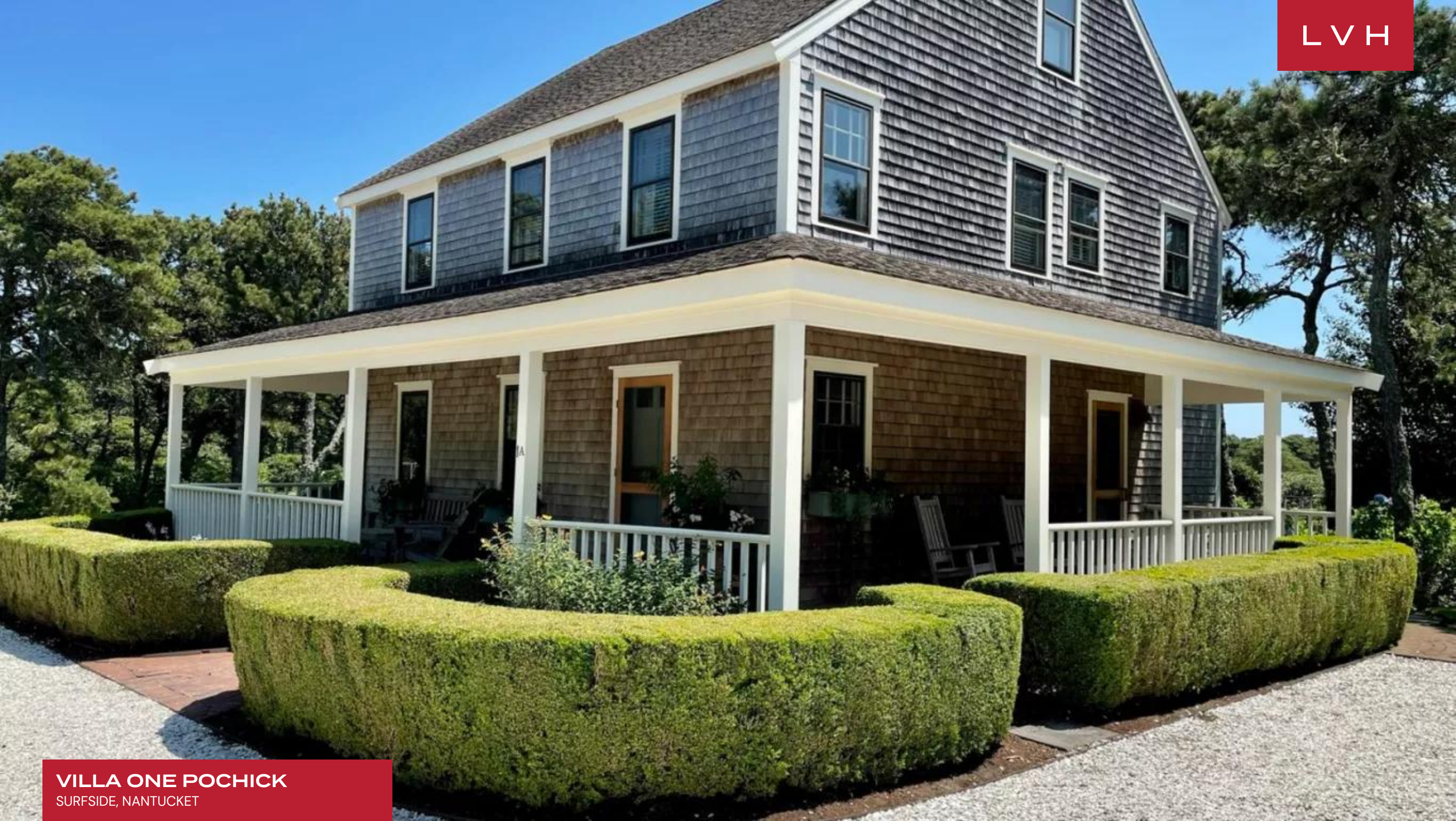
VILLA ONE POCHICK SURFSIDE, NANTUCKET