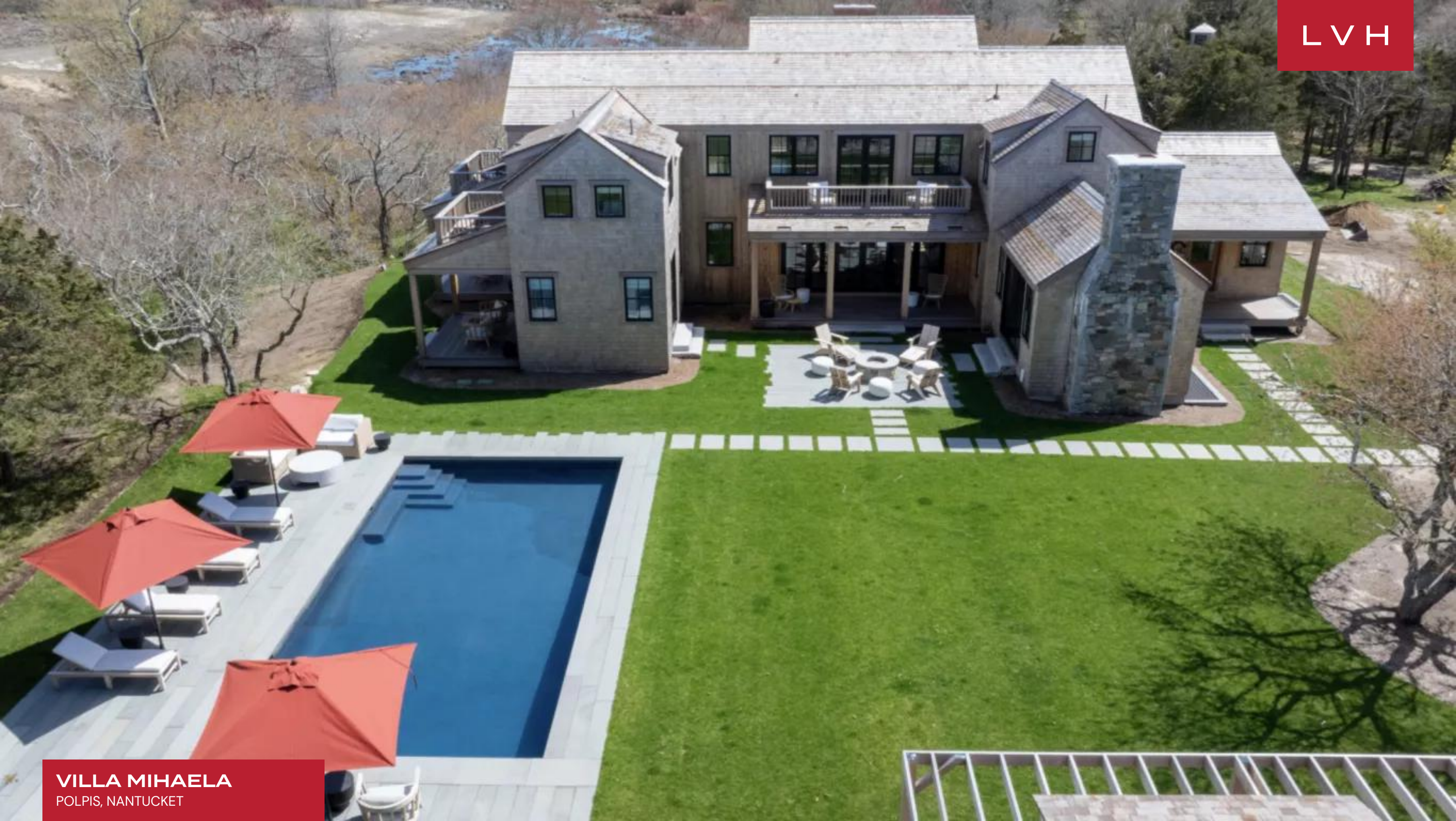
VILLA MIHAELA POLPIS, NANTUCKET