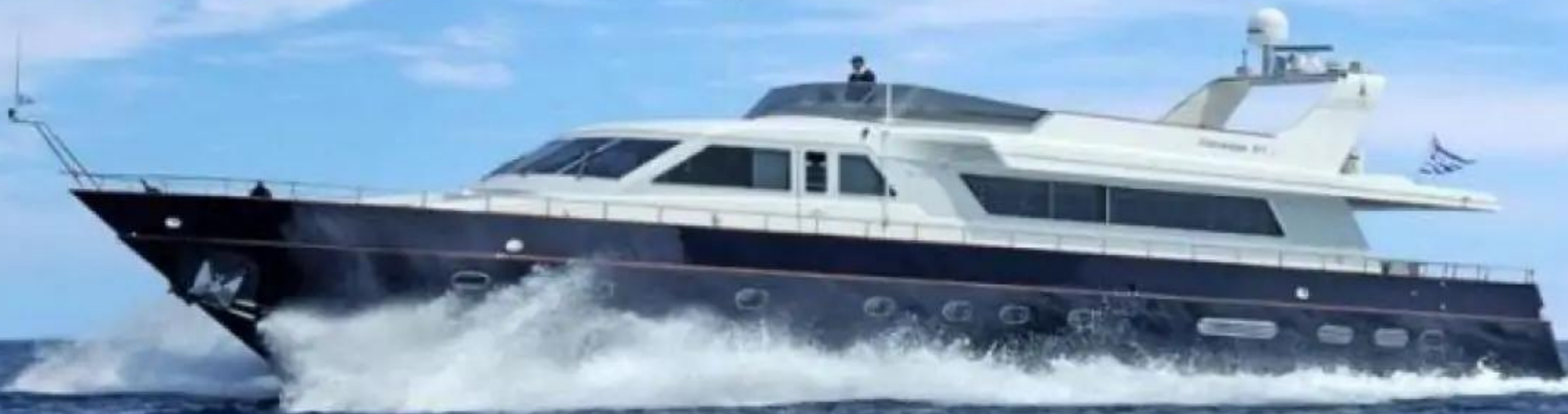
YACHT CANADOS 88 MYKONOS TOWN, MYKONOS