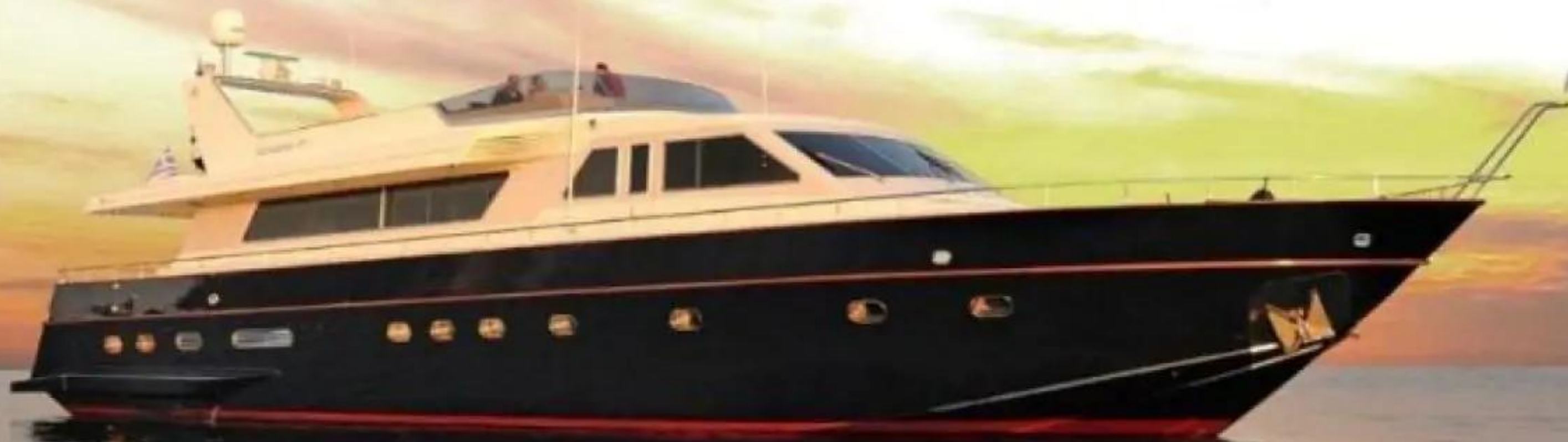
YACHT CANADOS 88 MYKONOS TOWN, MYKONOS