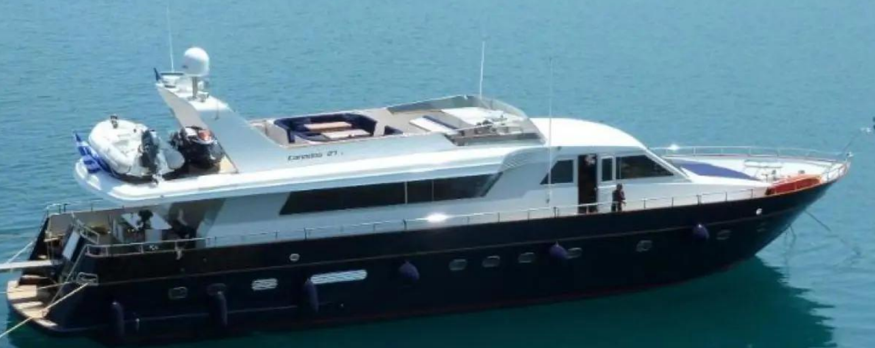
YACHT CANADOS 88 MYKONOS TOWN, MYKONOS