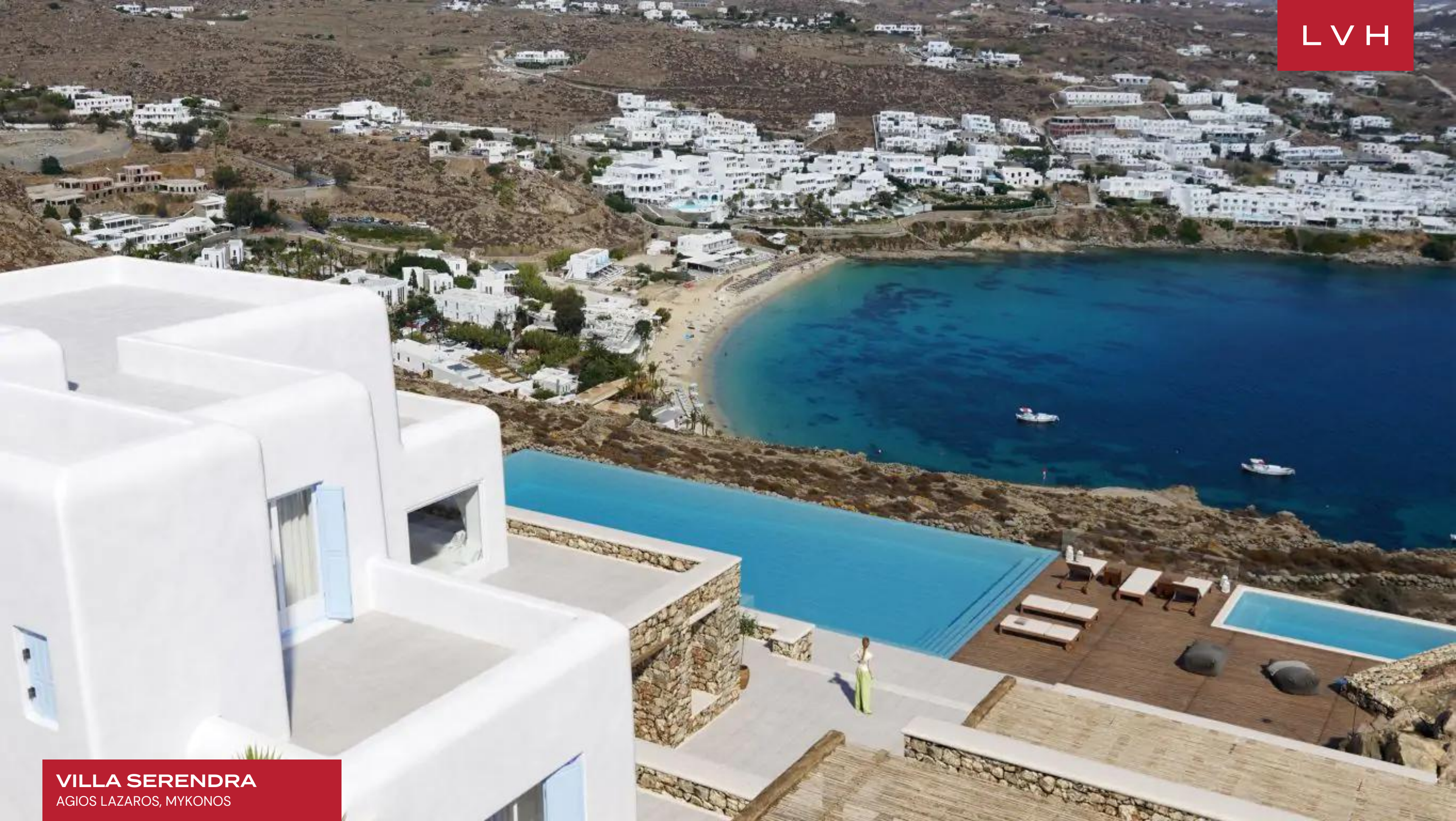
VILLA SERENDRA AGIOS LAZAROS, MYKONOS