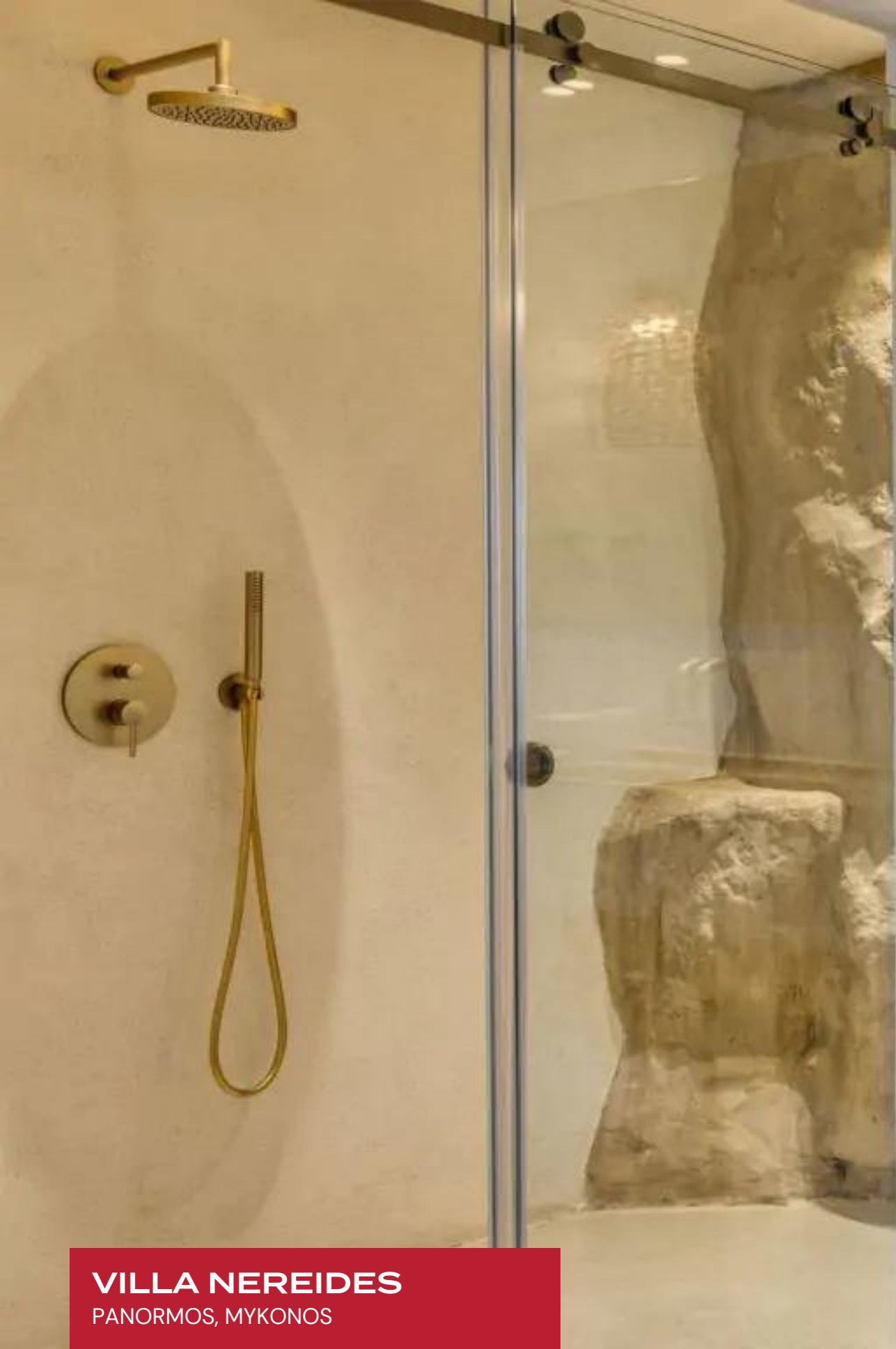
VILLA NEREIDES PANORMOS, MYKONOS