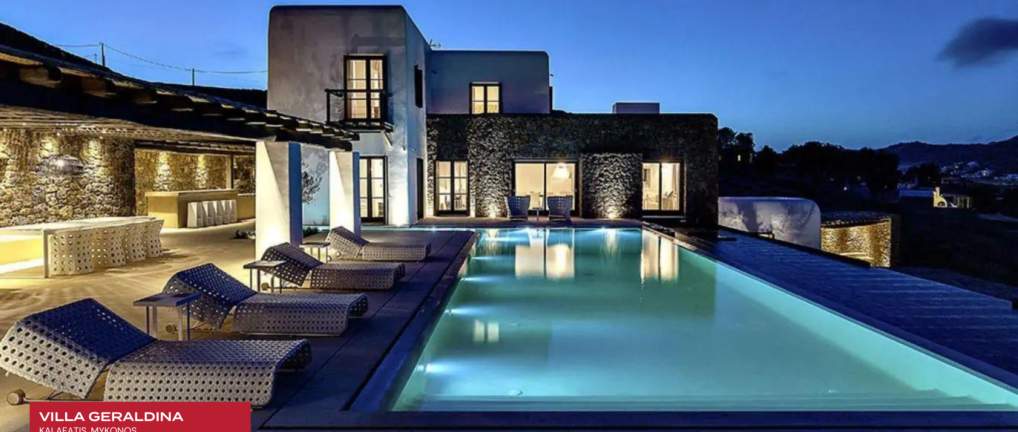
VILLA GERALDINA KALAFATIS, MYKONOS