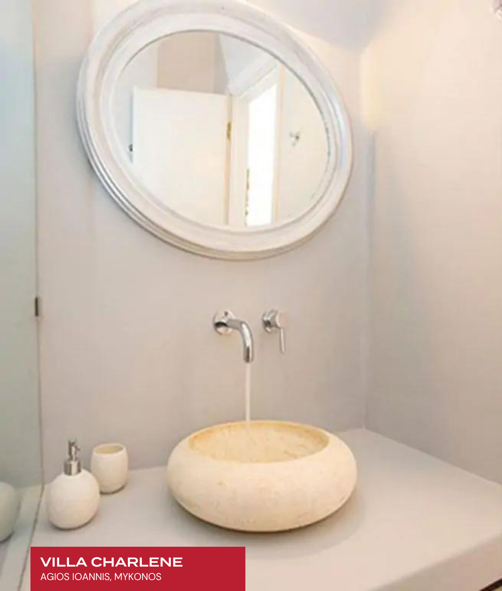
VILLA CHARLENE AGIOS IOANNIS, MYKONOS