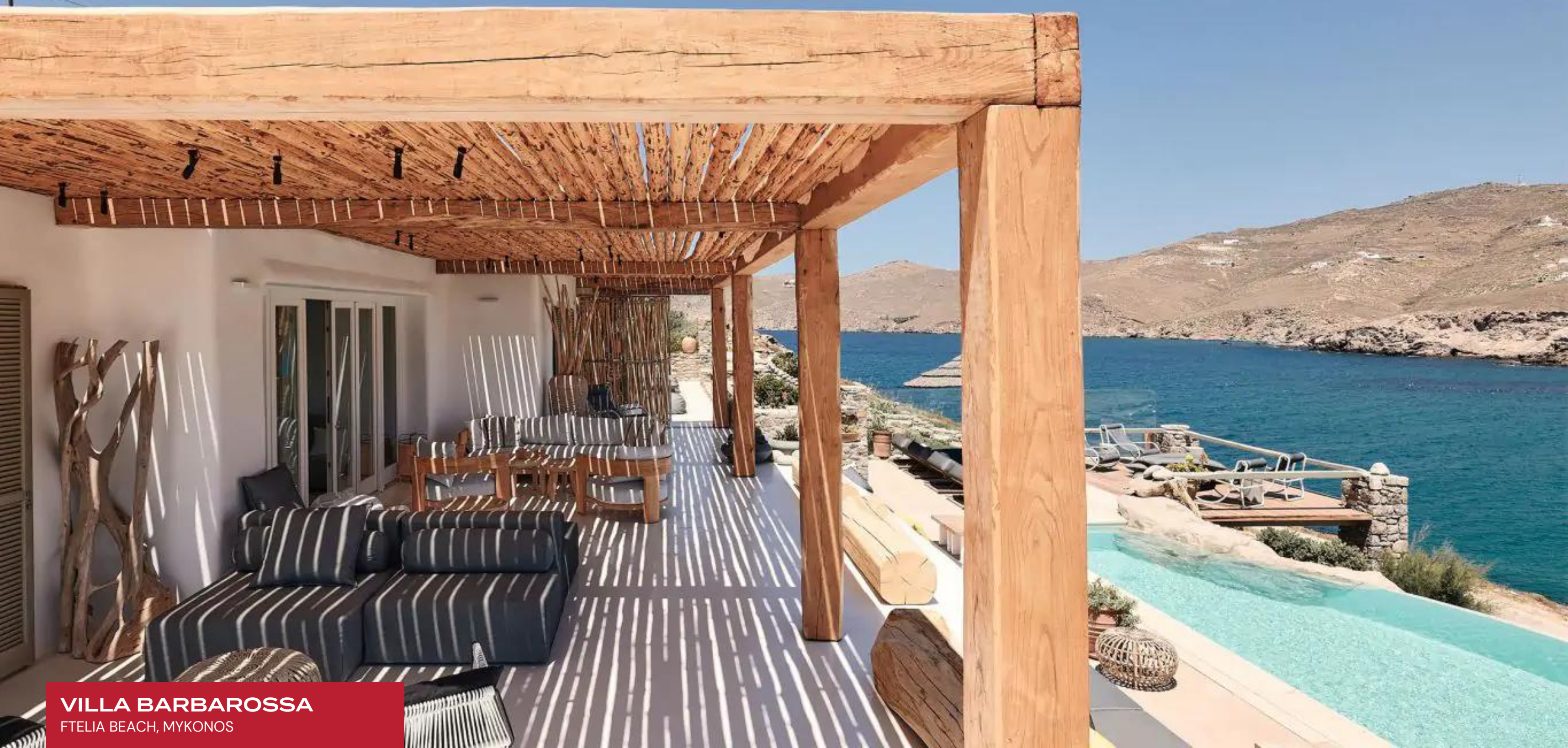
VILLA BARBAROSSA FTELIA BEACH, MYKONOS