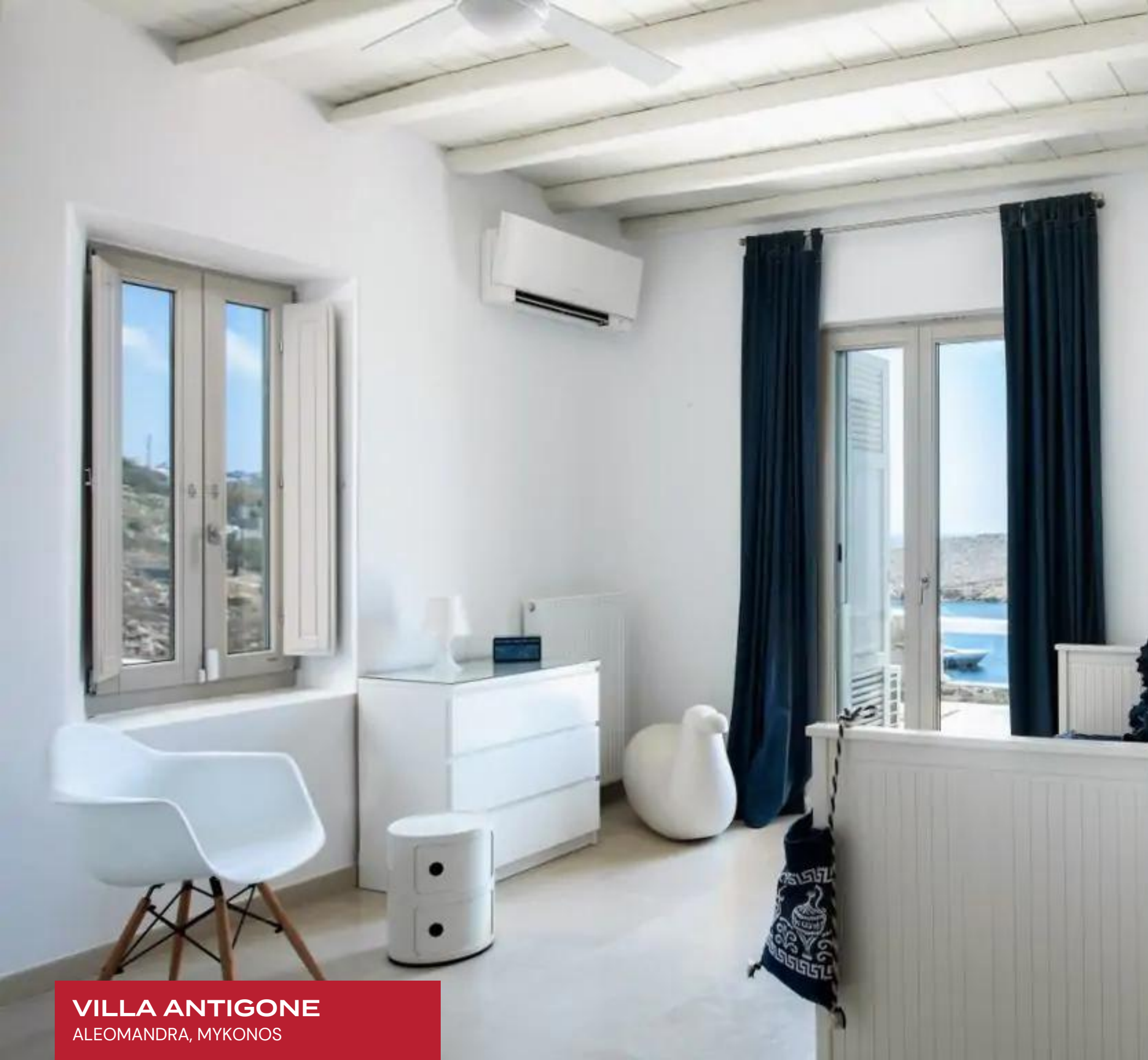
VILLA ANTIGONE ALEOMANDRA, MYKONOS