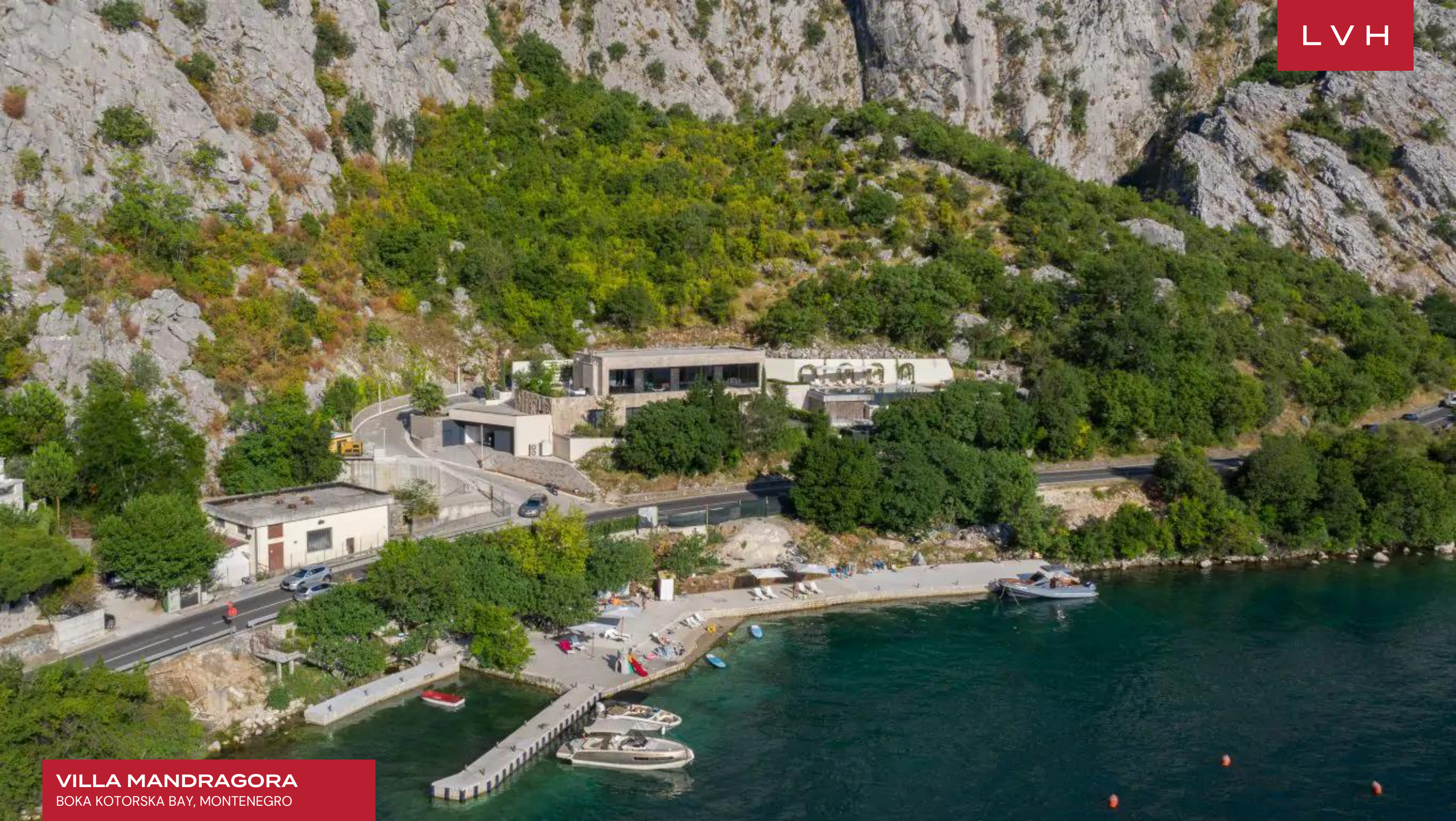
VILLA MANDRAGORA BOKA KOTORSKA BAY, MONTENEGRO