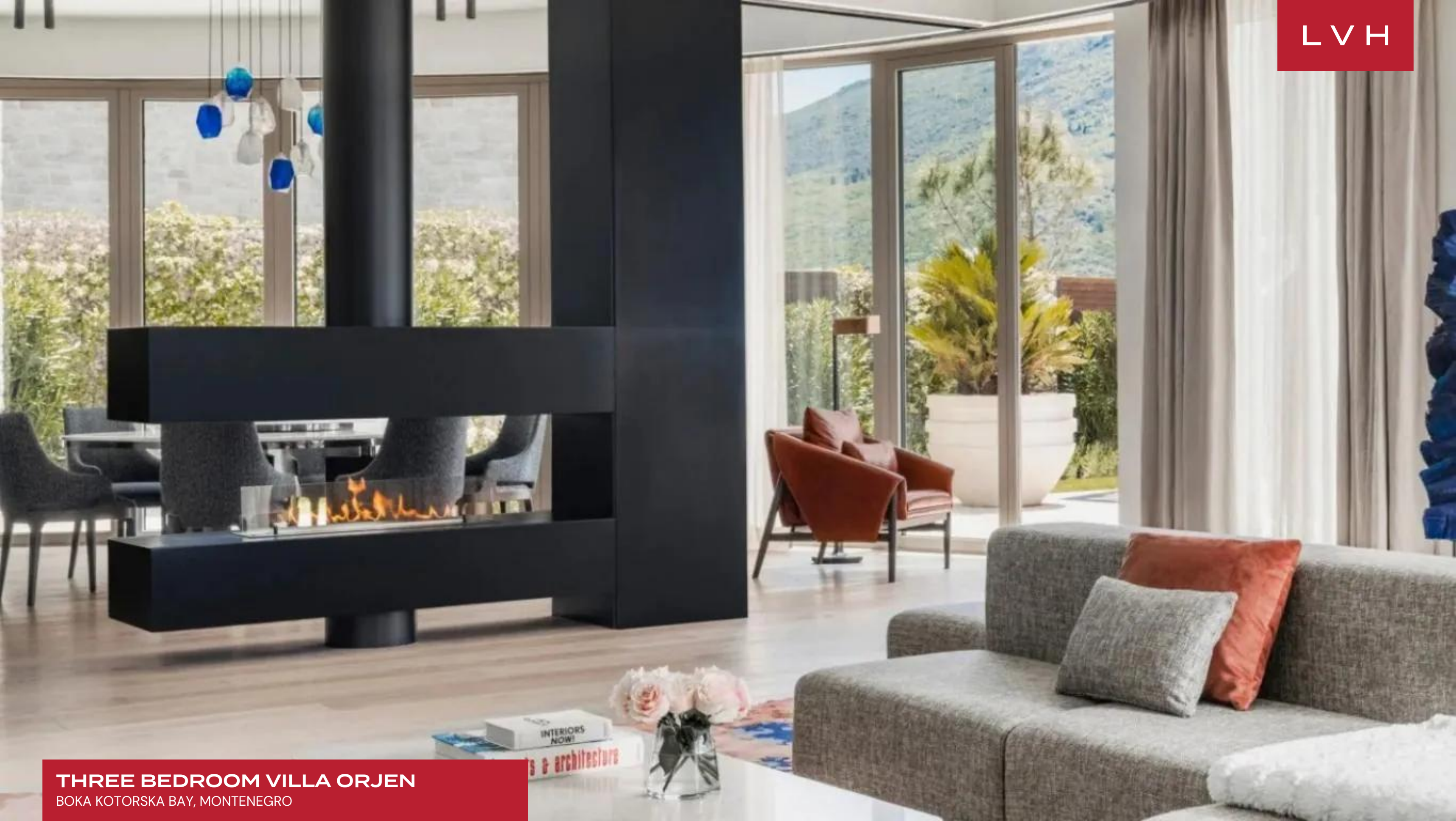
THREE BEDROOM VILLA ORJEN BOKA KOTORSKA BAY, MONTENEGRO