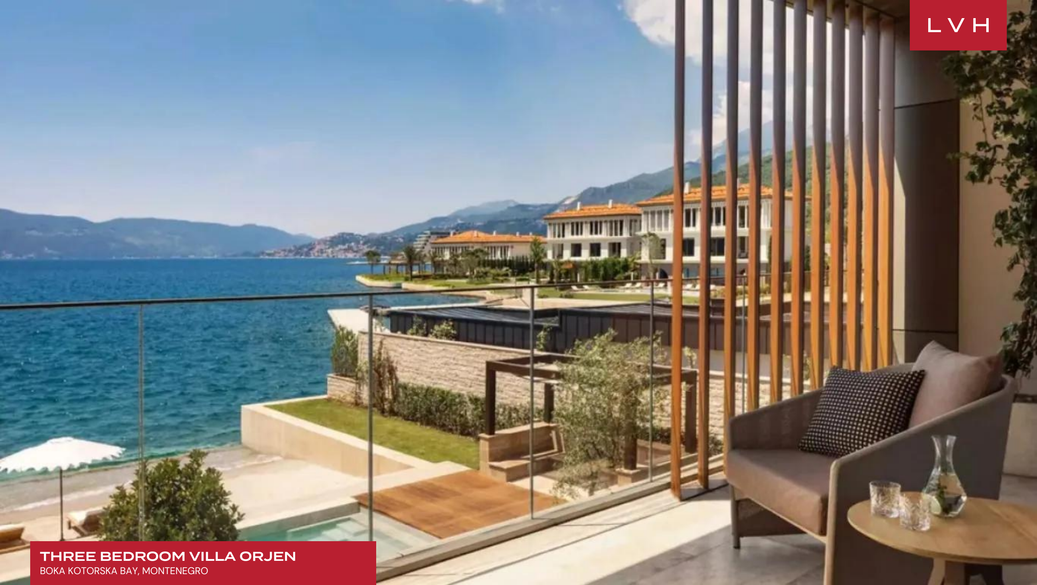
THREE BEDROOM VILLA ORJEN BOKA KOTORSKA BAY, MONTENEGRO