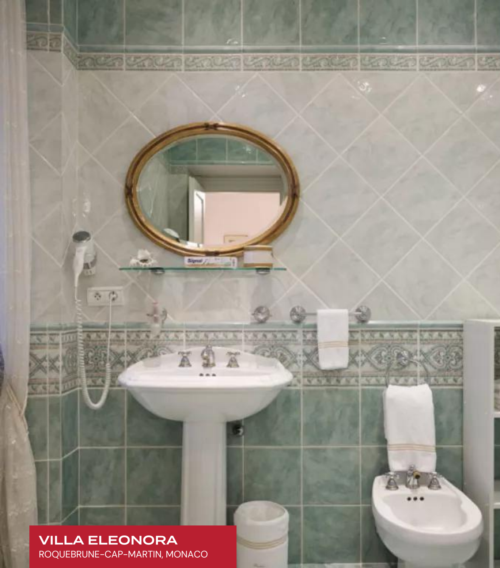
VILLA ELEONORA ROQUEBRUNE-CAP-MARTIN, MONACO