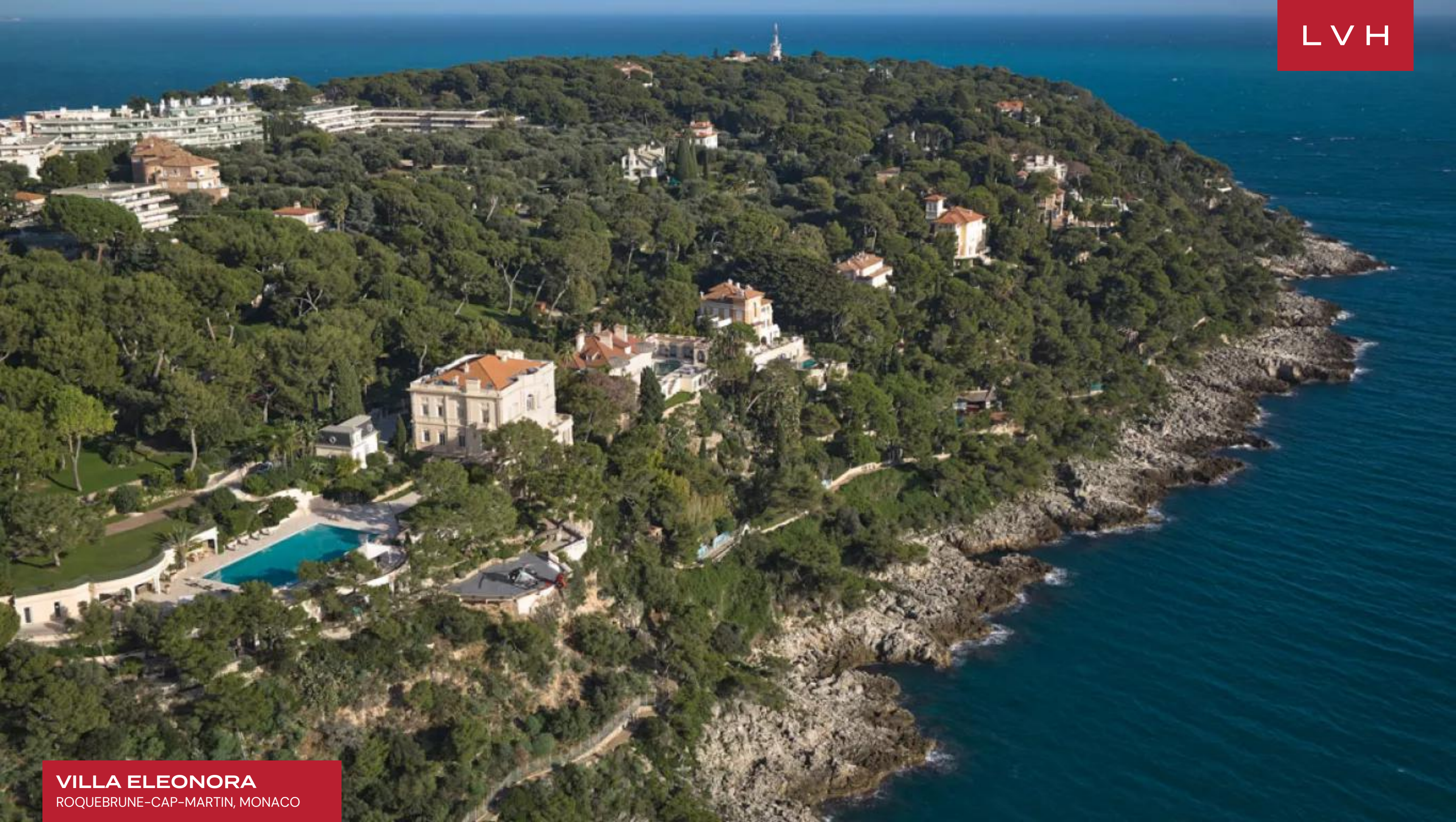
VILLA ELEONORA ROQUEBRUNE-CAP-MARTIN, MONACO