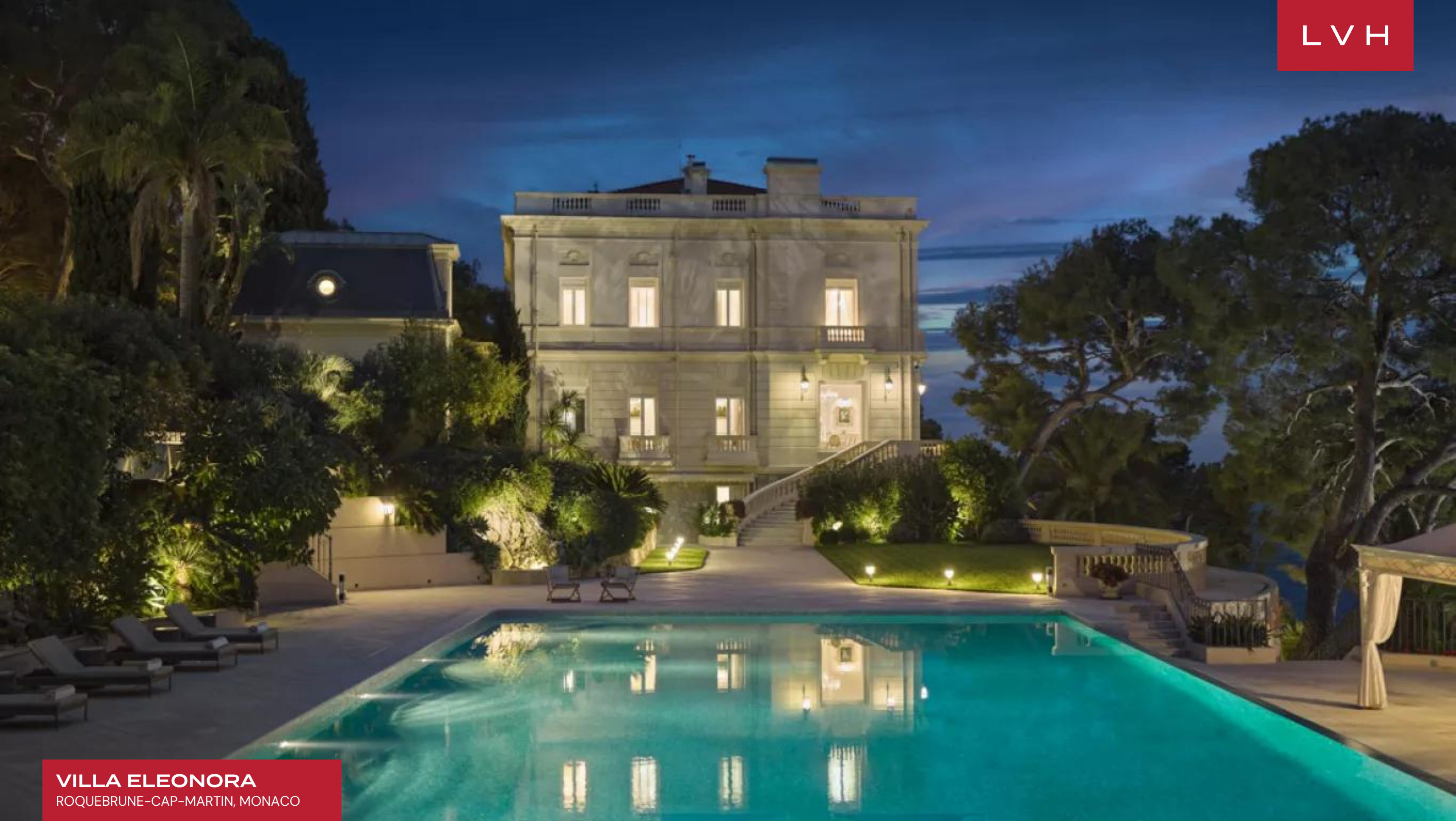
VILLA ELEONORA ROQUEBRUNE-CAP-MARTIN, MONACO