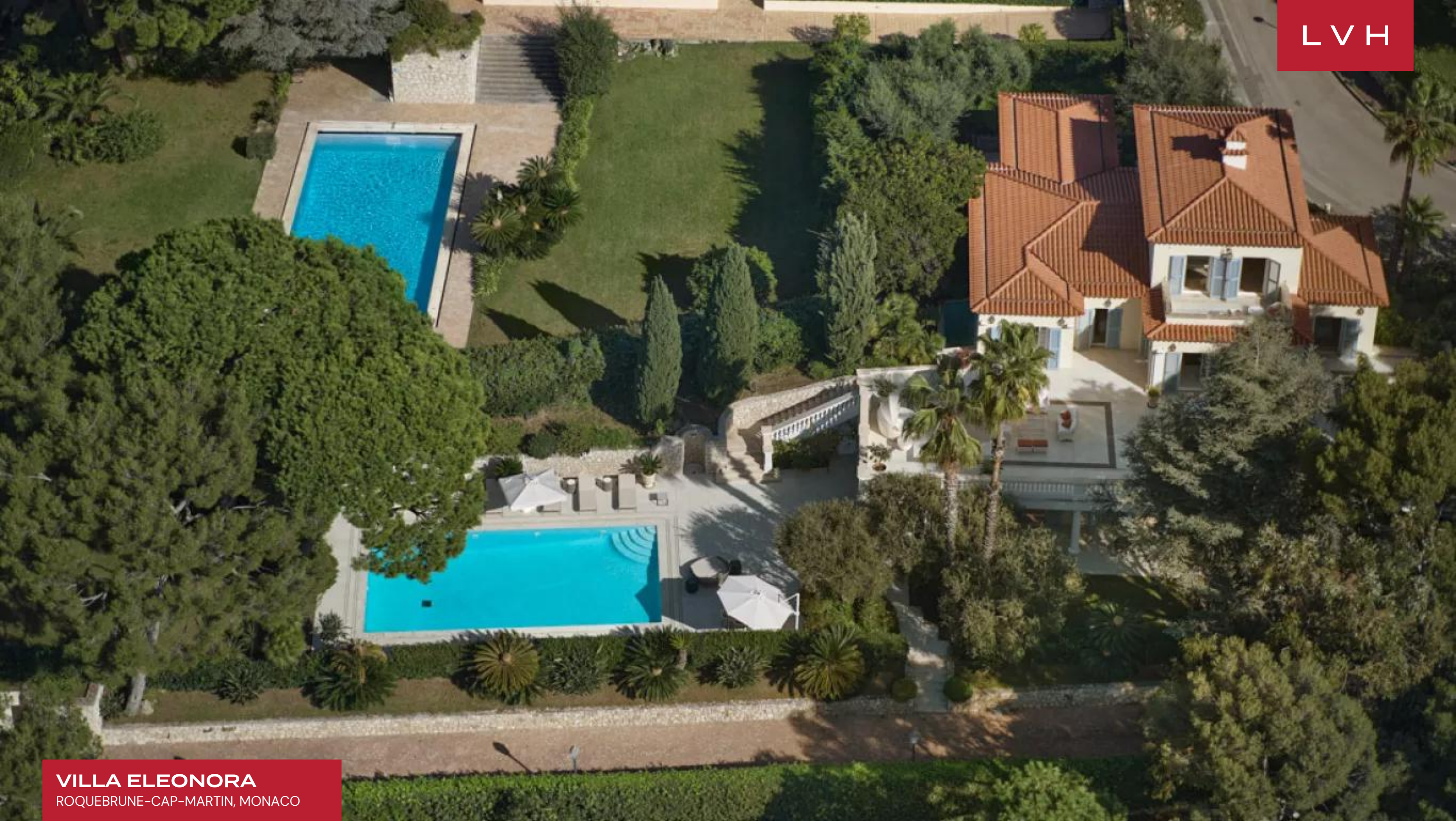
VILLA ELEONORA ROQUEBRUNE-CAP-MARTIN, MONACO