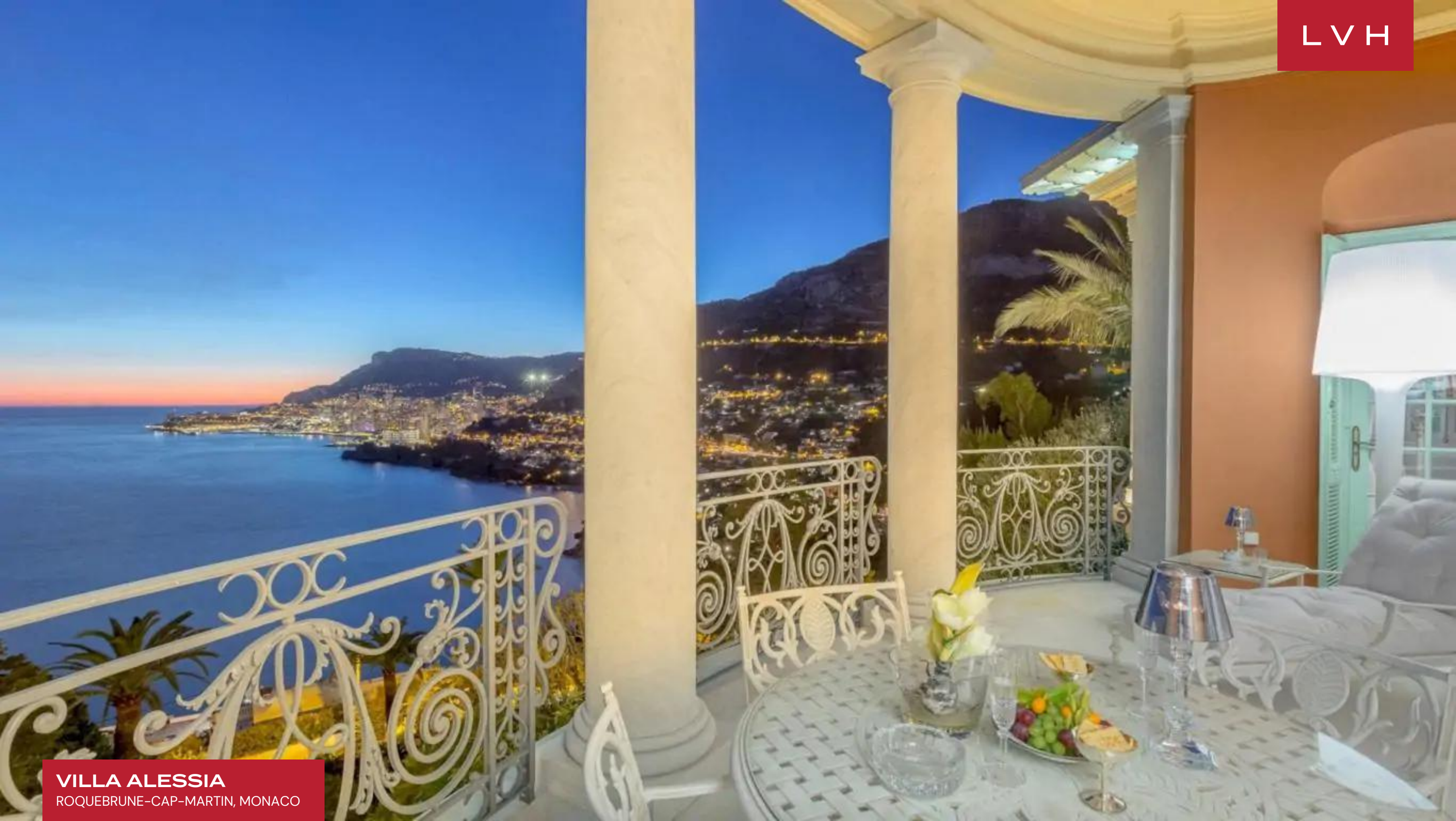
VILLA ALESSIA ROQUEBRUNE-CAP-MARTIN, MONACO