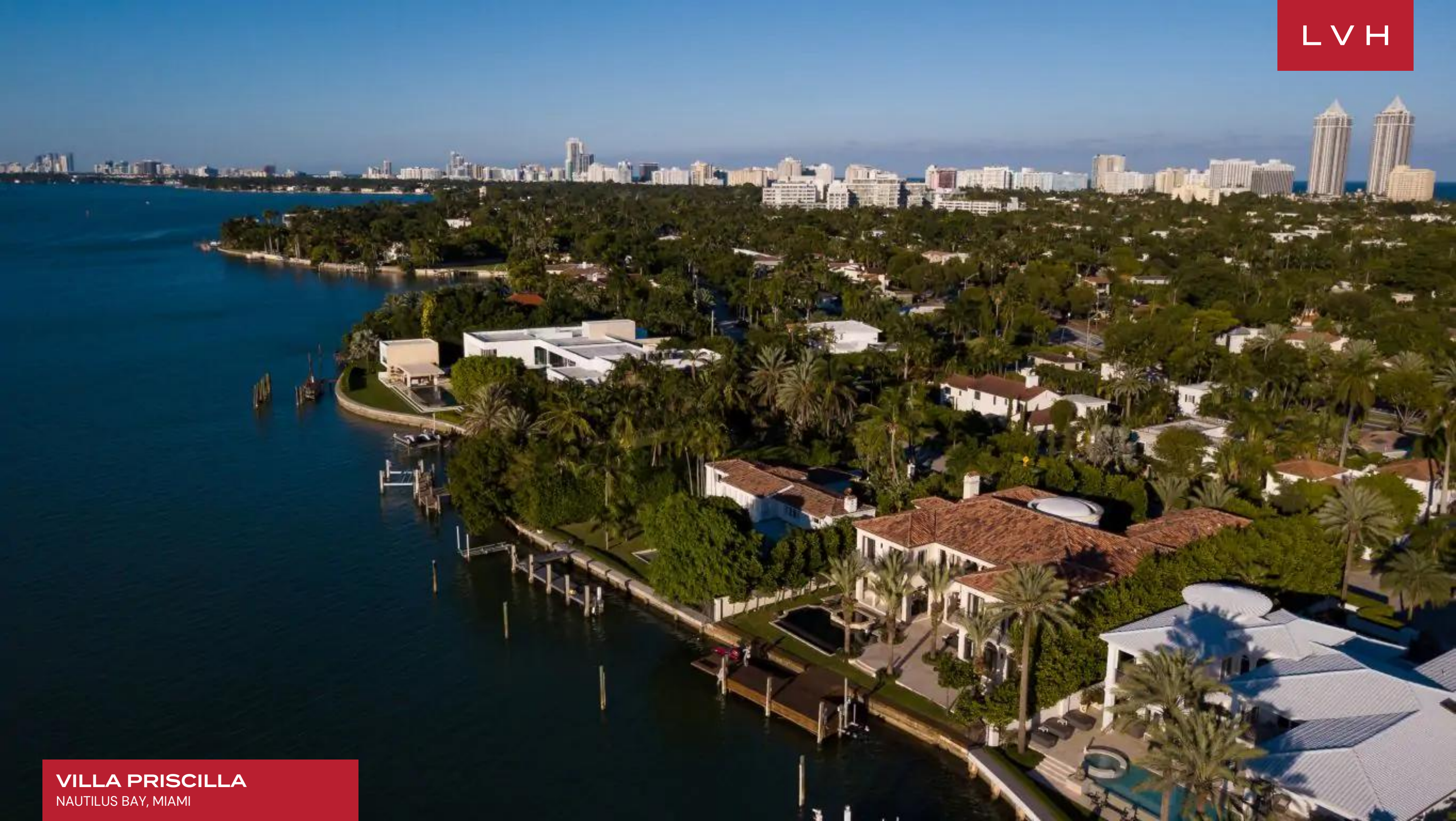
VILLA PRISCILLA NAUTILUS BAY, MIAMI