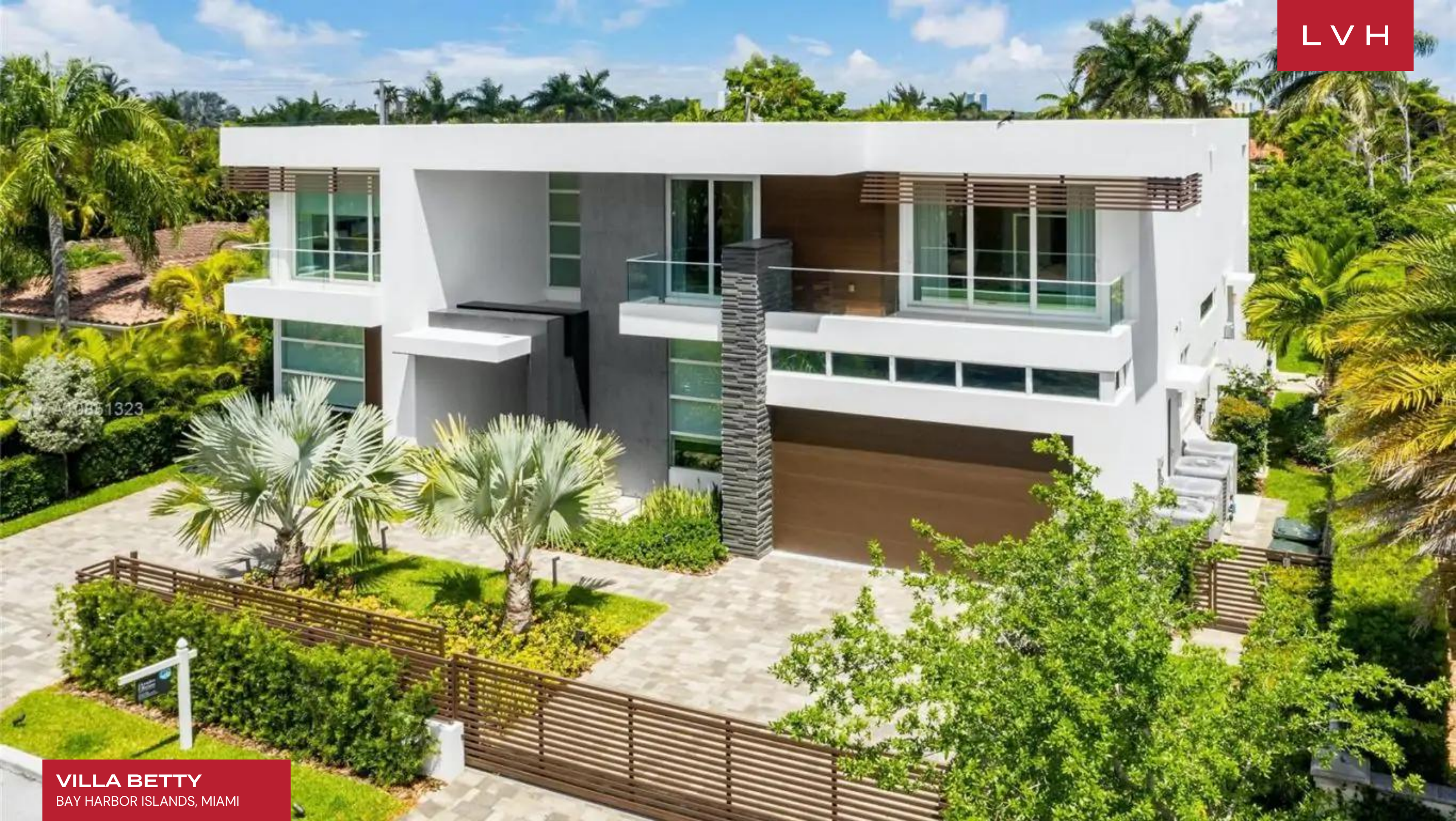
VILLA BETTY BAY HARBOR ISLANDS, MIAMI