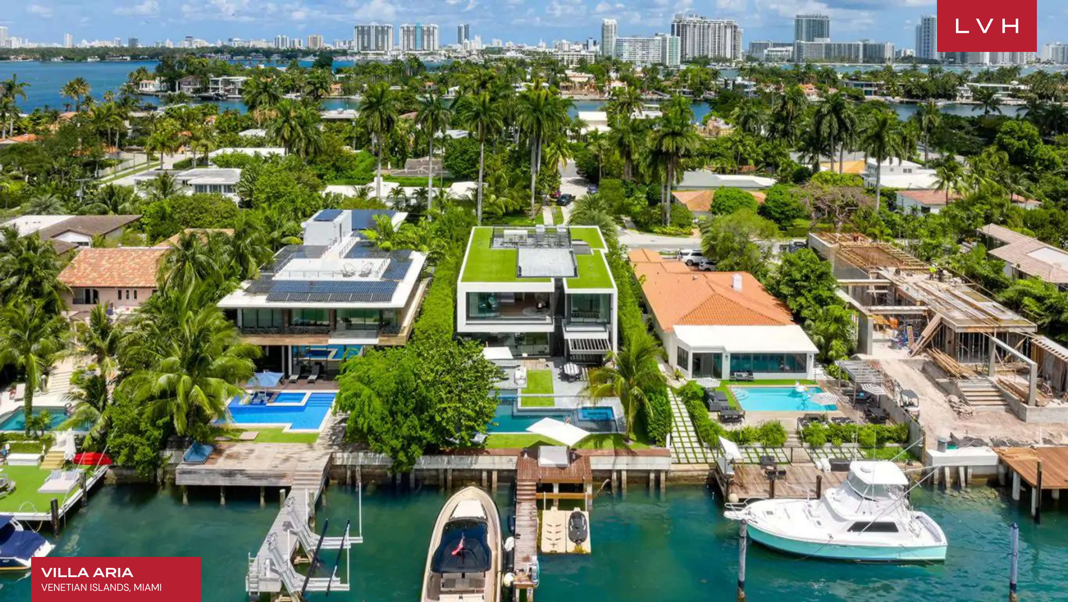
VILLA ARIA VENETIAN ISLANDS, MIAMI