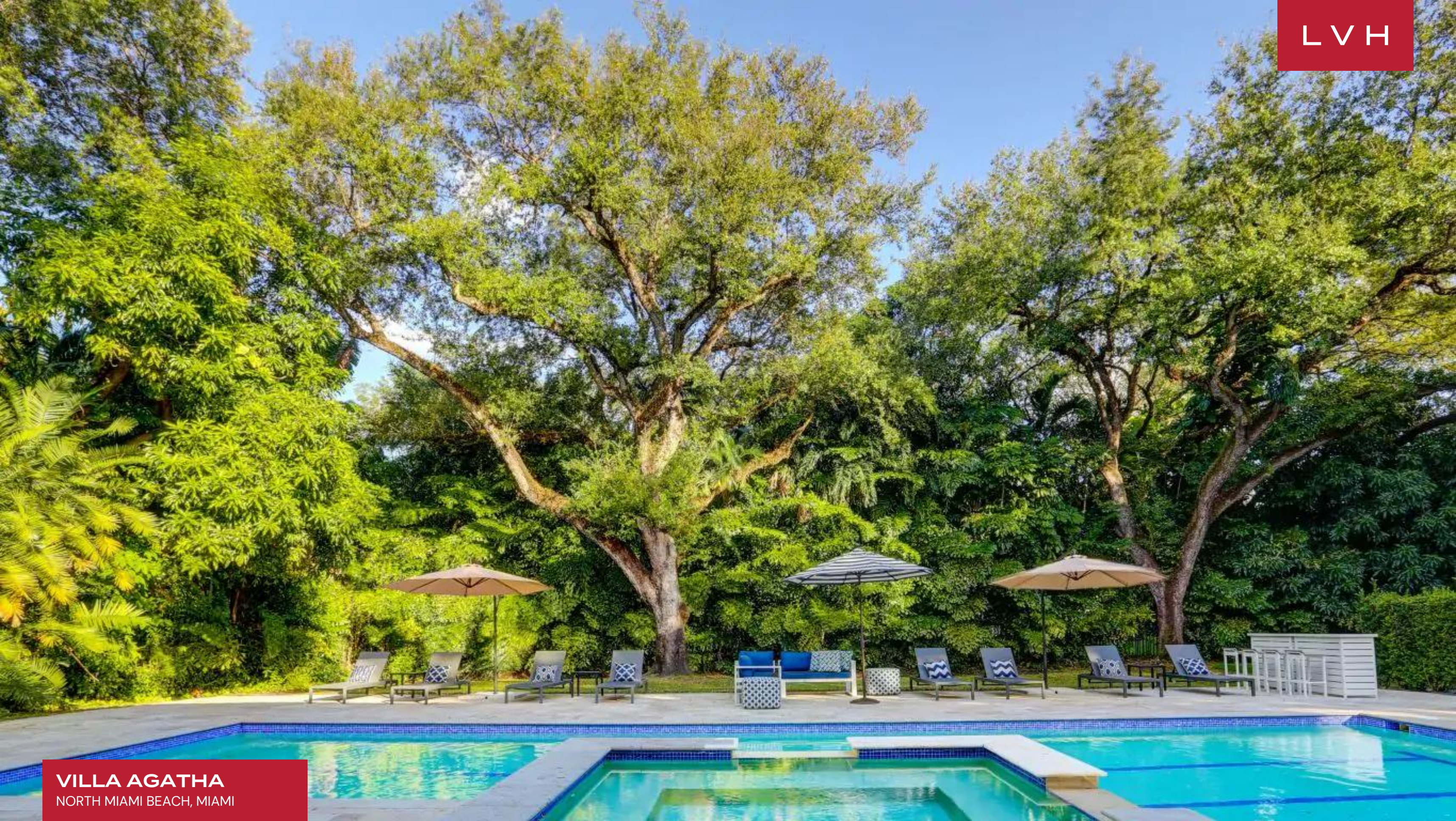
VILLA AGATHA NORTH MIAMI BEACH, MIAMI