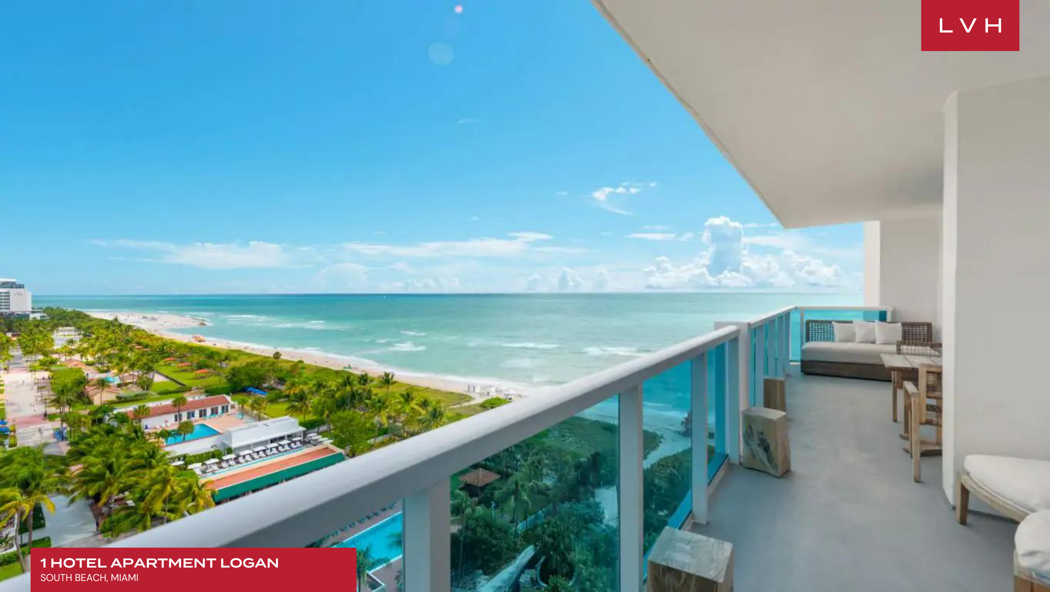
1 HOTEL APARTMENT LOGAN SOUTH BEACH, MIAMI