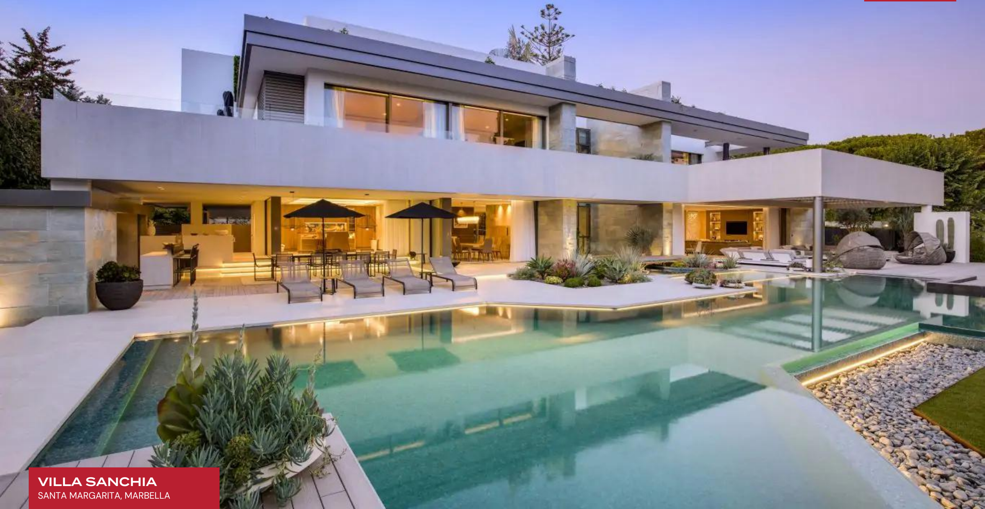
VILLA SANCHIA SANTA MARGARITA, MARBELLA