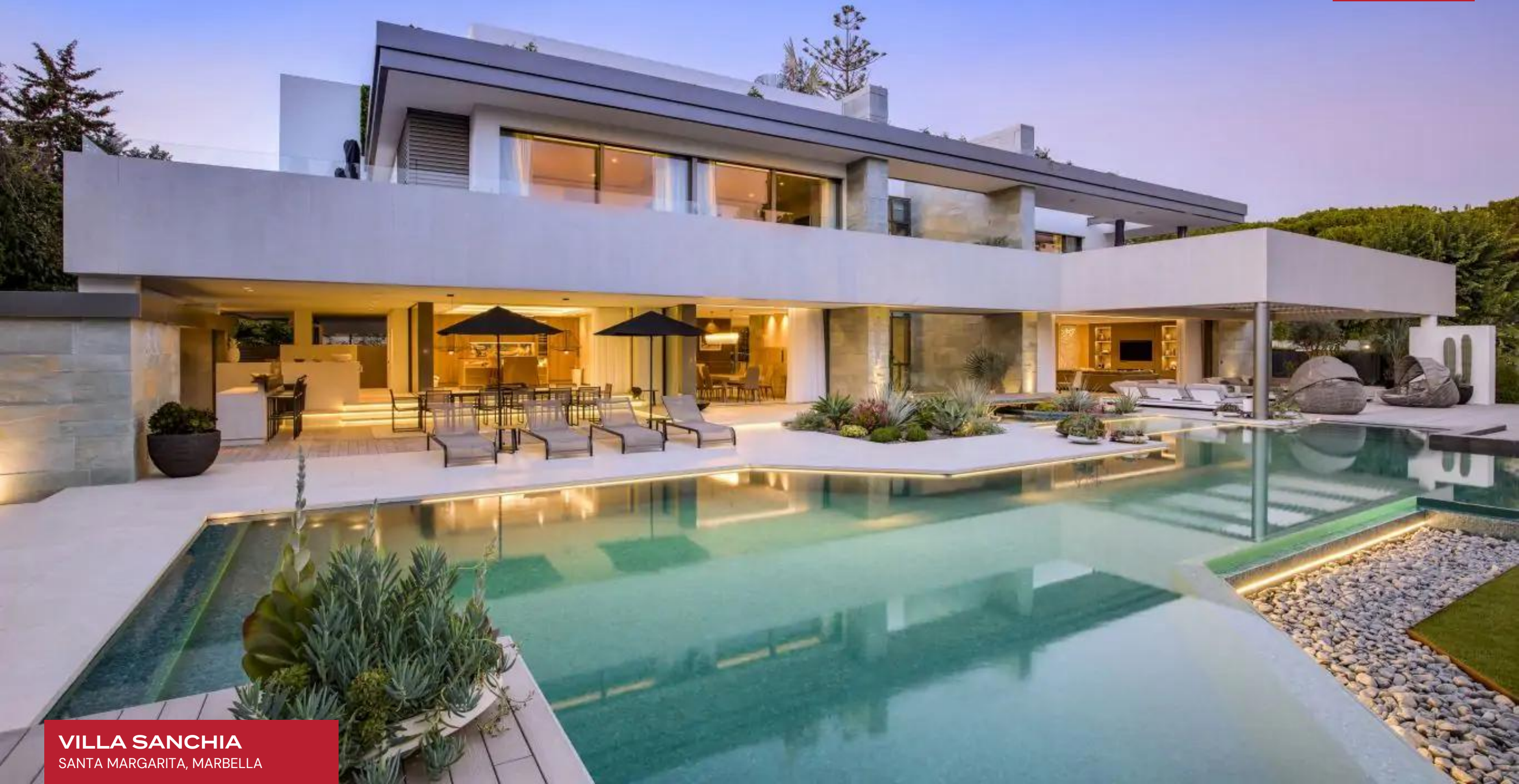
VILLA SANCHIA SANTA MARGARITA, MARBELLA