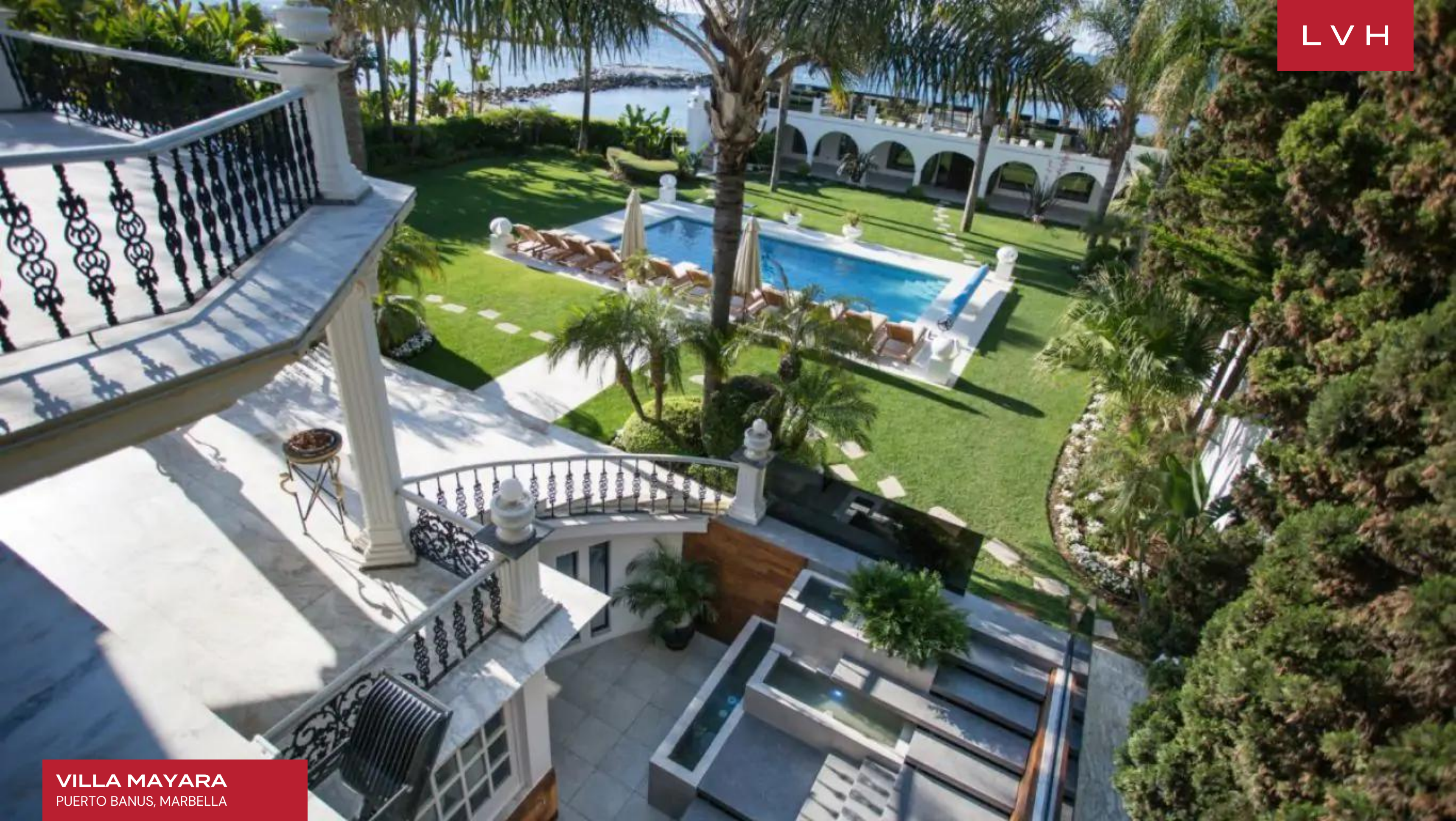
VILLA MAYARA PUERTO BANUS, MARBELLA