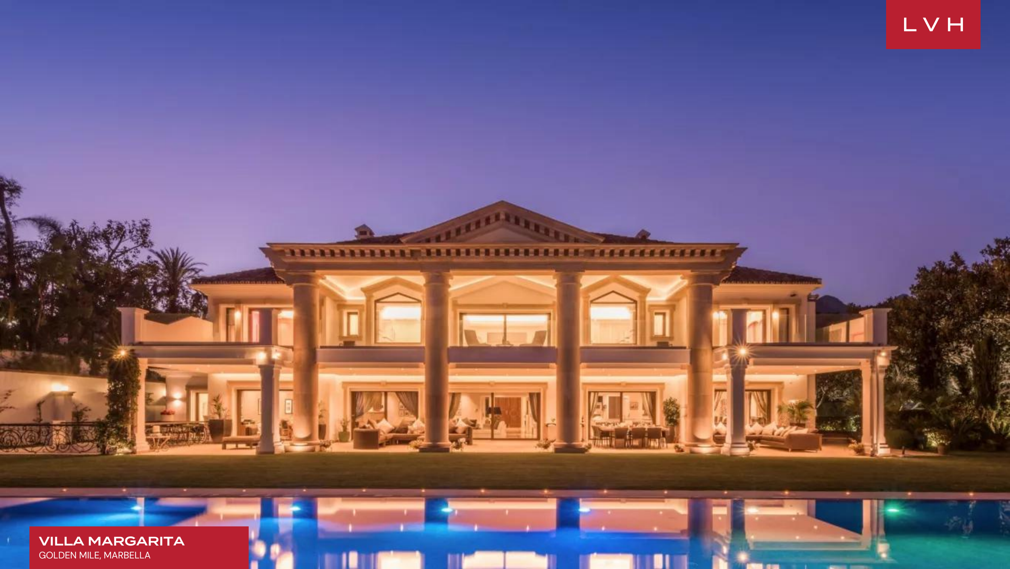
VILLA MARGARITA GOLDEN MILE, MARBELLA