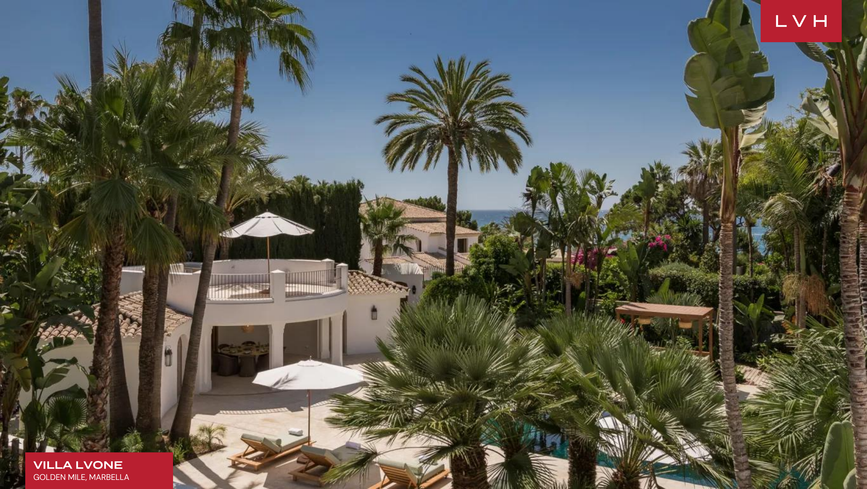
VILLA LVONE GOLDEN MILE, MARBELLA