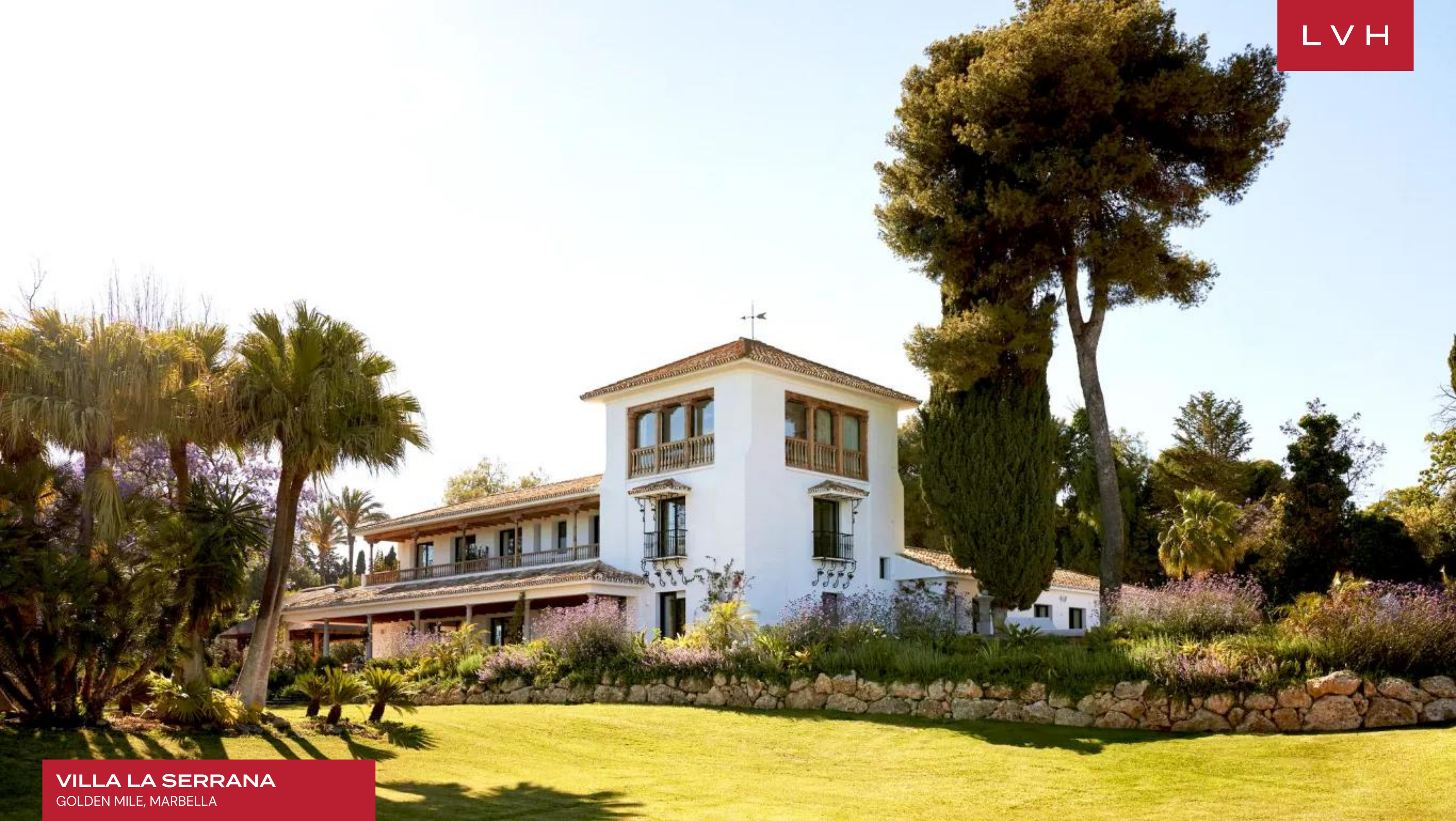
VILLA LA SERRANA GOLDEN MILE, MARBELLA