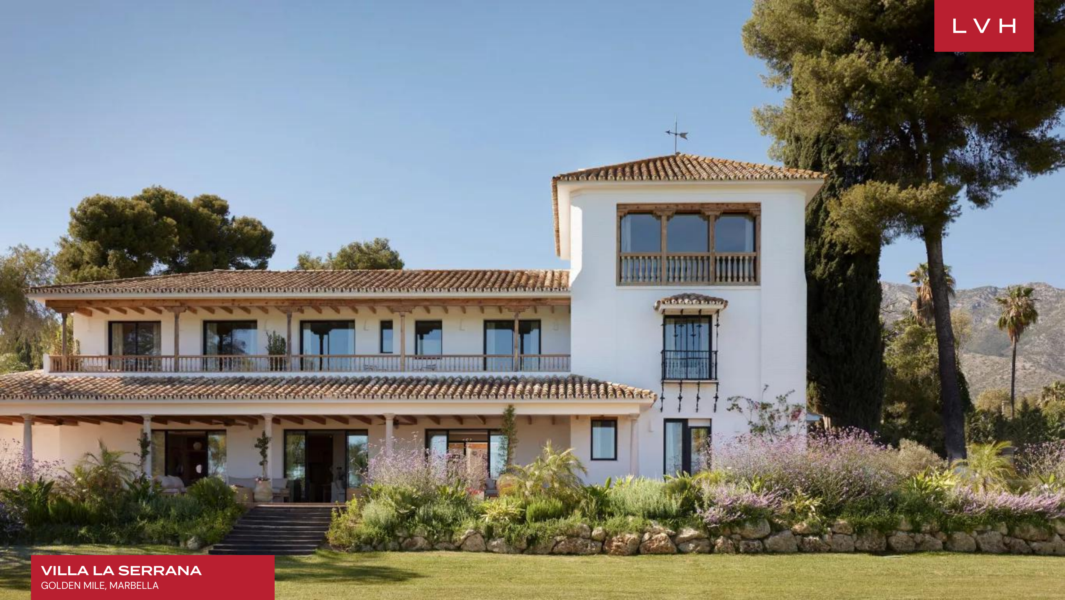
VILLA LA SERRANA GOLDEN MILE, MARBELLA