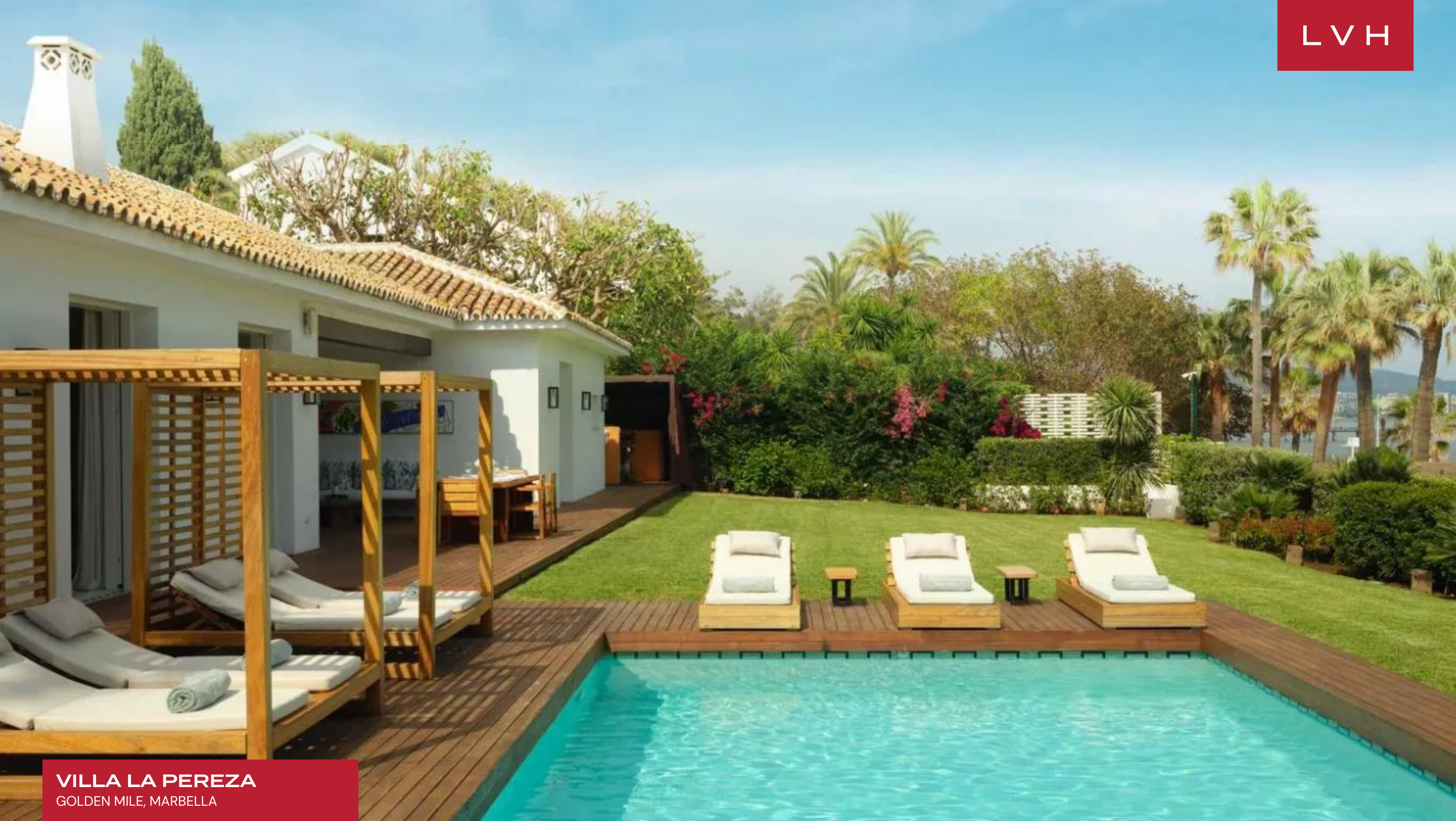
VILLA LA PEREZA GOLDEN MILE, MARBELLA