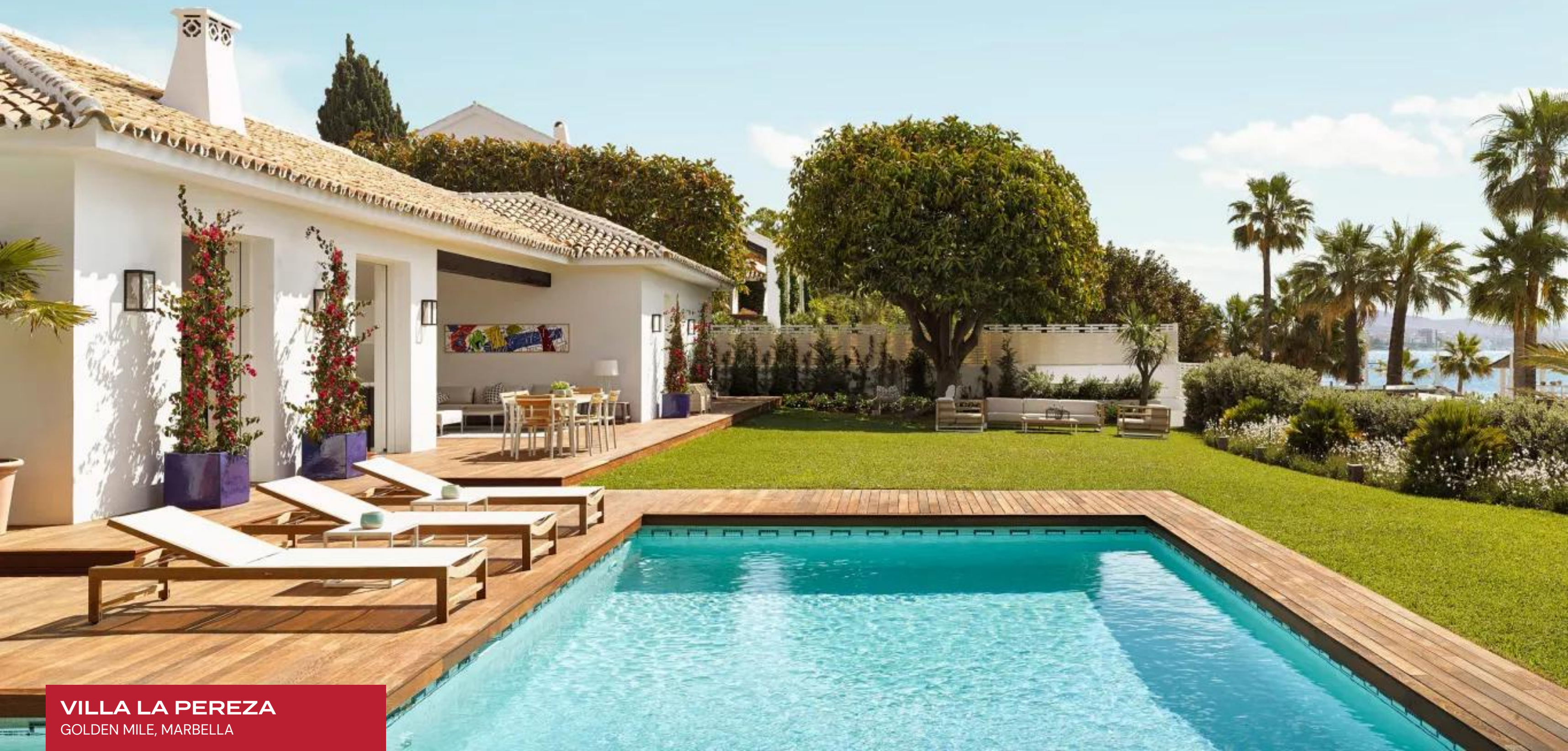
VILLA LA PEREZA GOLDEN MILE, MARBELLA