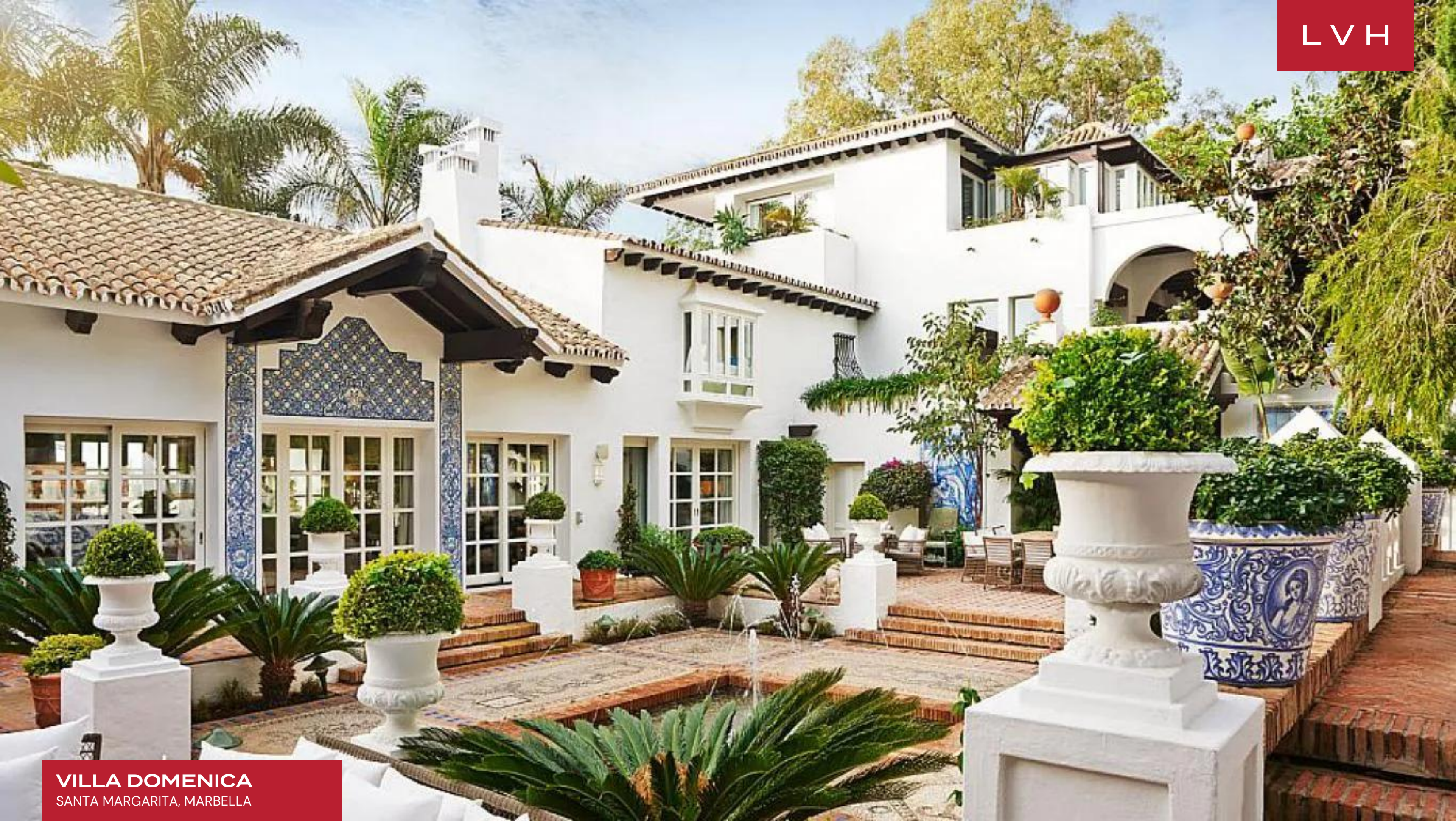
VILLA DOMENICA SANTA MARGARITA, MARBELLA