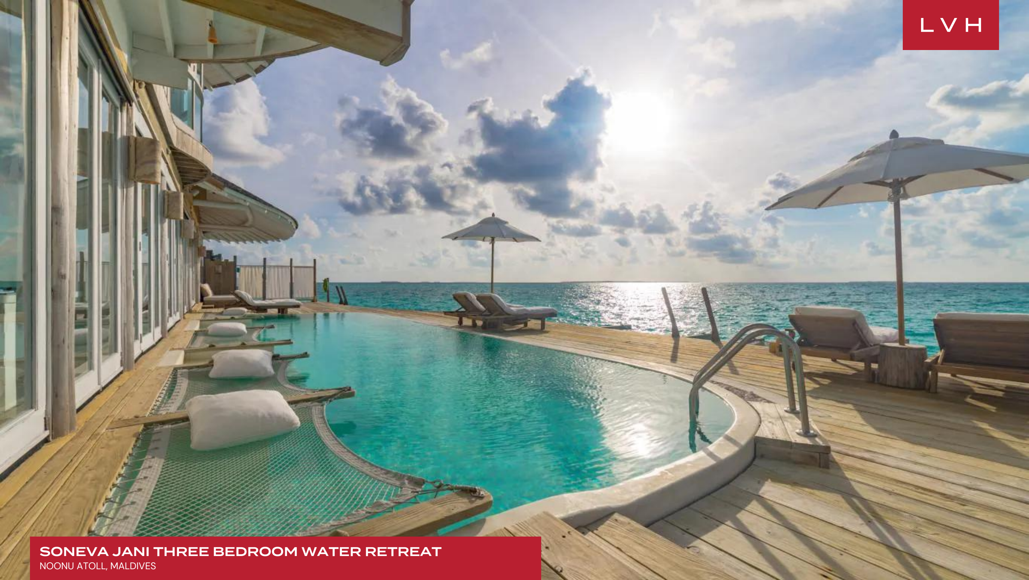
SONEVA JANI THREE BEDROOM WATER RETREAT NOONU ATOLL, MALDIVES