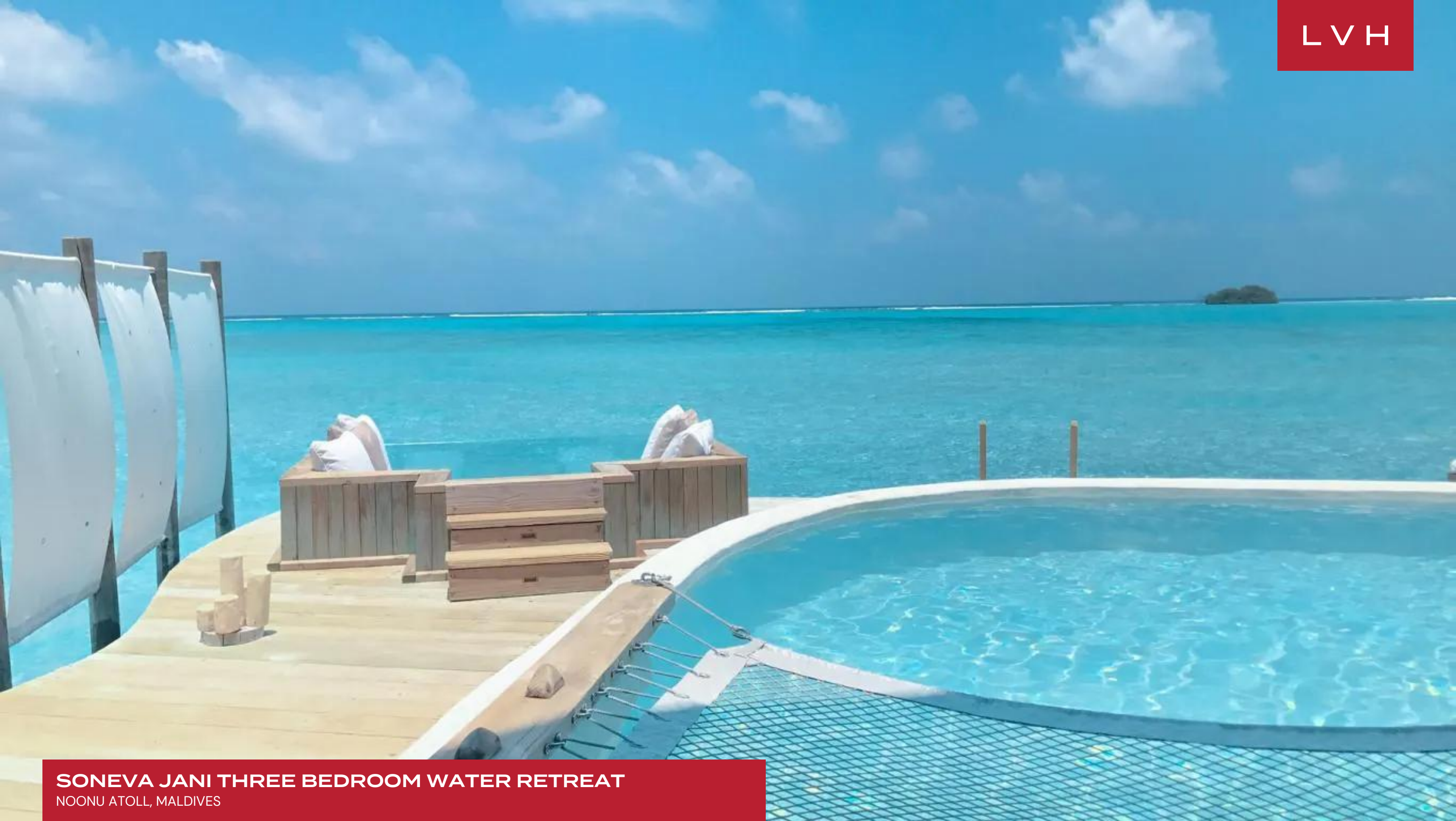
SONEVA JANI THREE BEDROOM WATER RETREAT NOONU ATOLL, MALDIVES