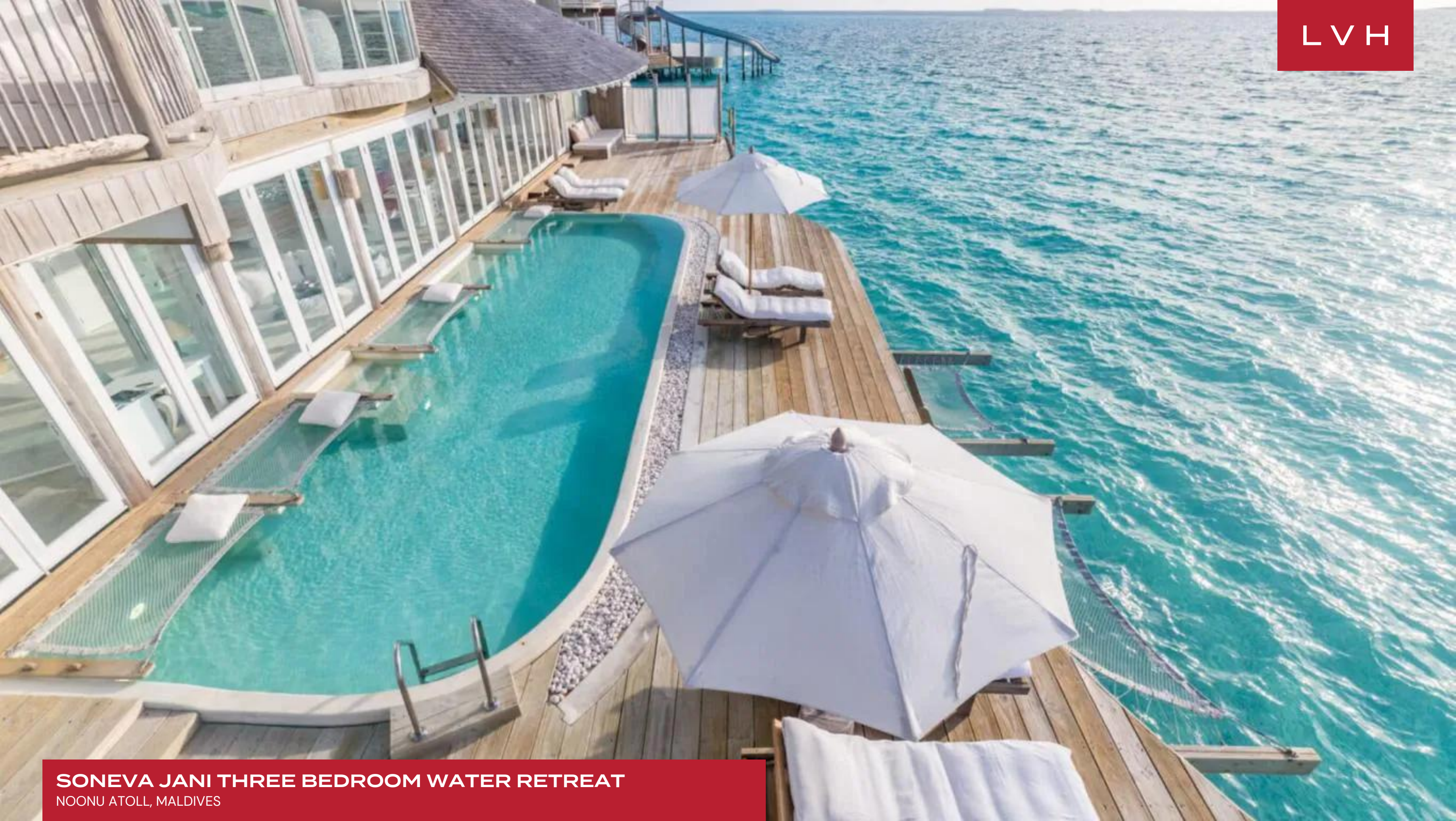
SONEVA JANI THREE BEDROOM WATER RETREAT NOONU ATOLL, MALDIVES