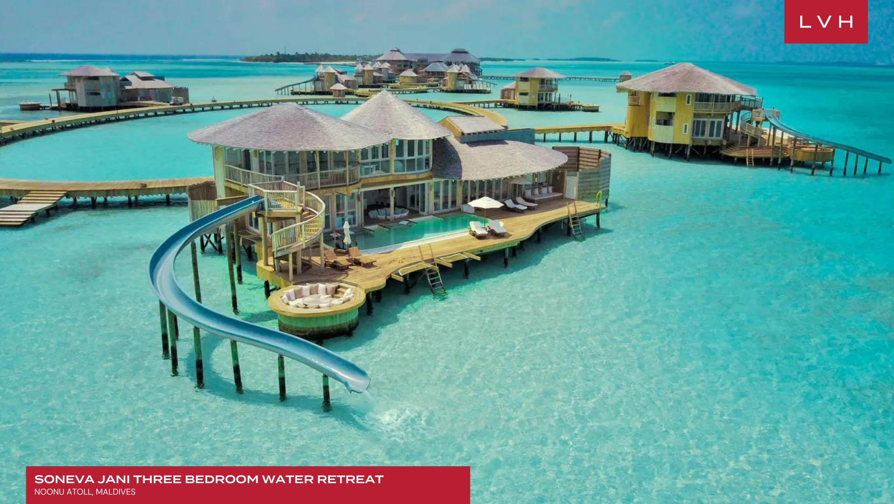
SONEVA JANI THREE BEDROOM WATER RETREAT NOONU ATOLL, MALDIVES