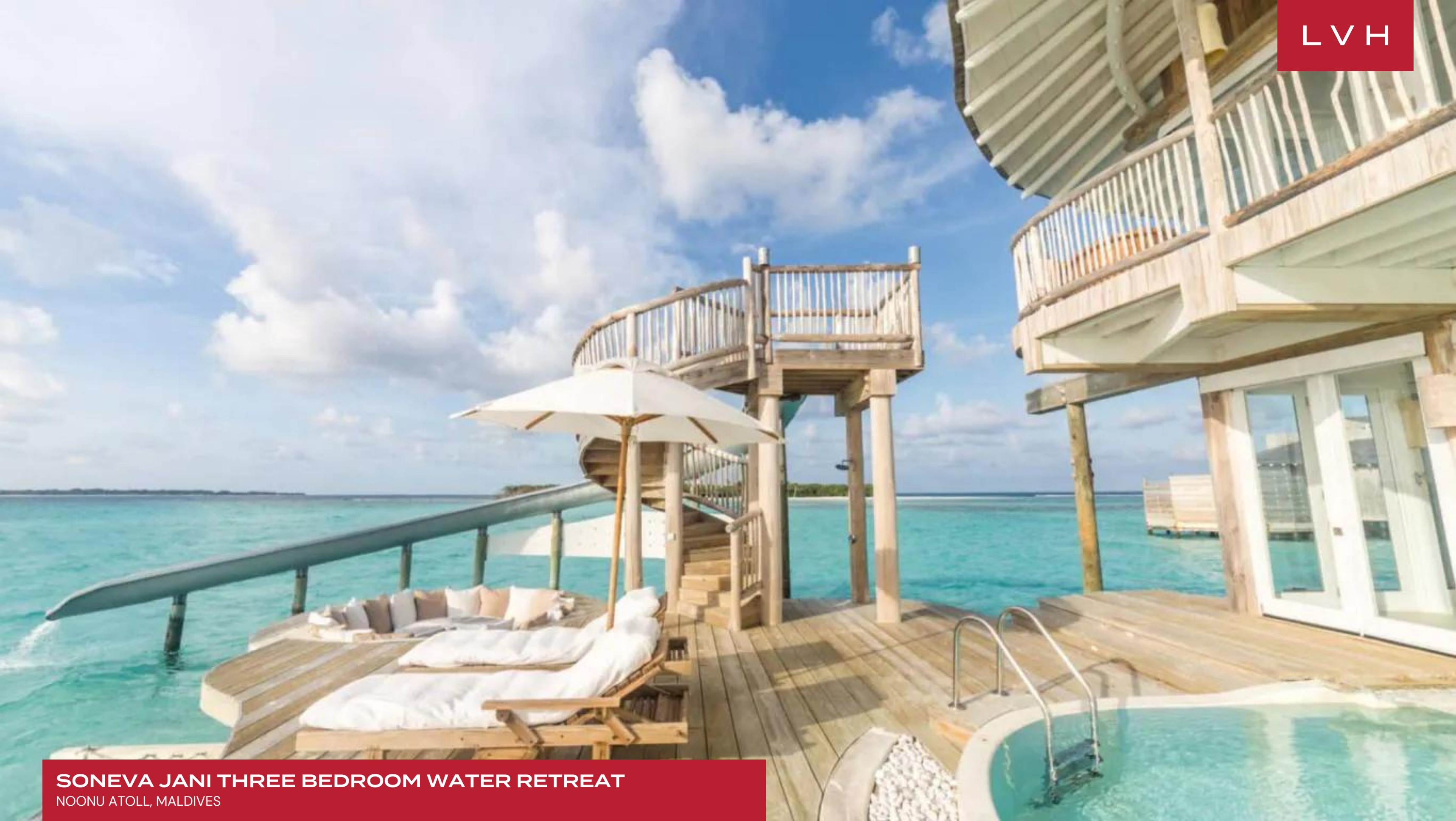
SONEVA JANI THREE BEDROOM WATER RETREAT NOONU ATOLL, MALDIVES