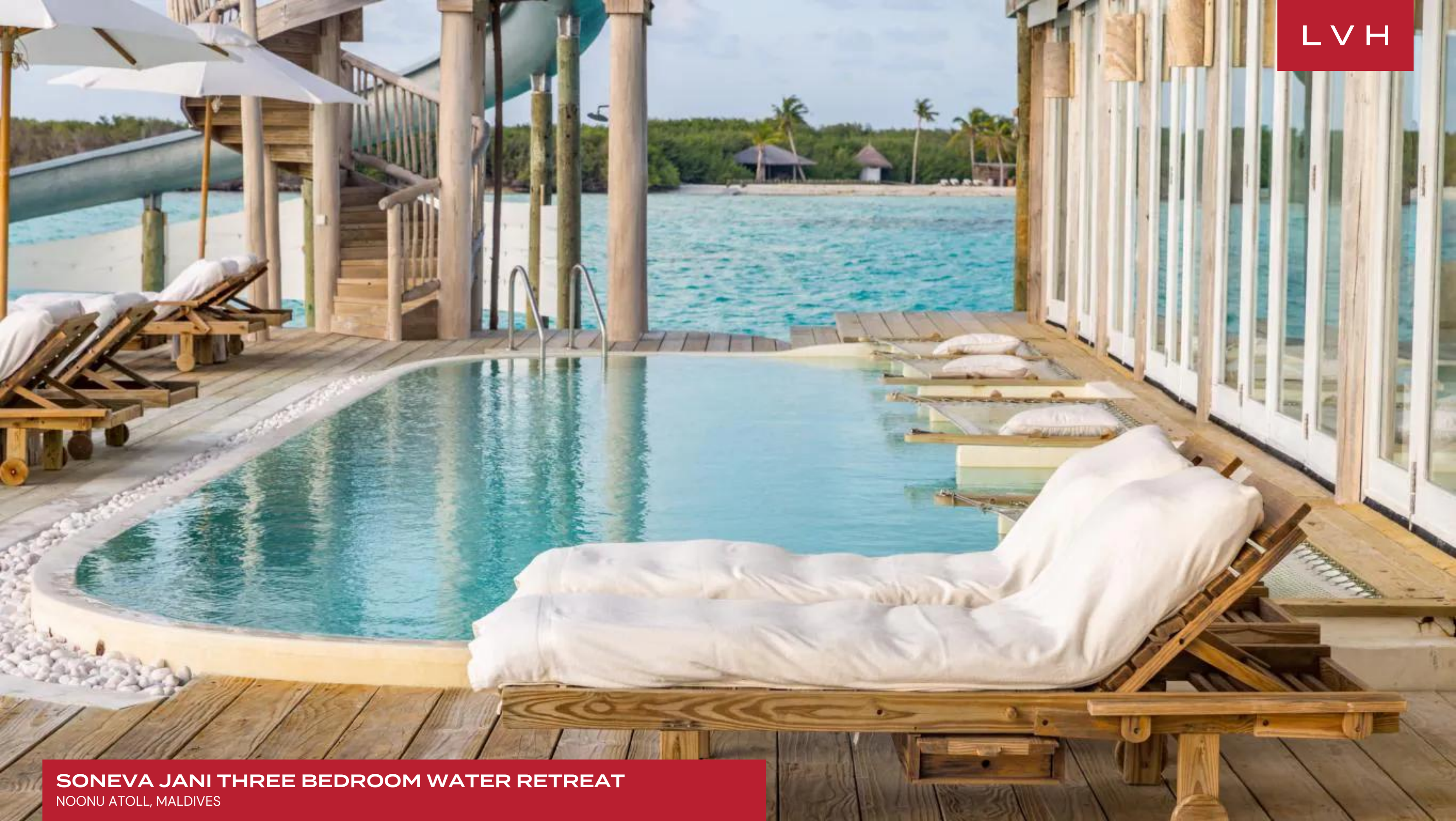
SONEVA JANI THREE BEDROOM WATER RETREAT NOONU ATOLL, MALDIVES