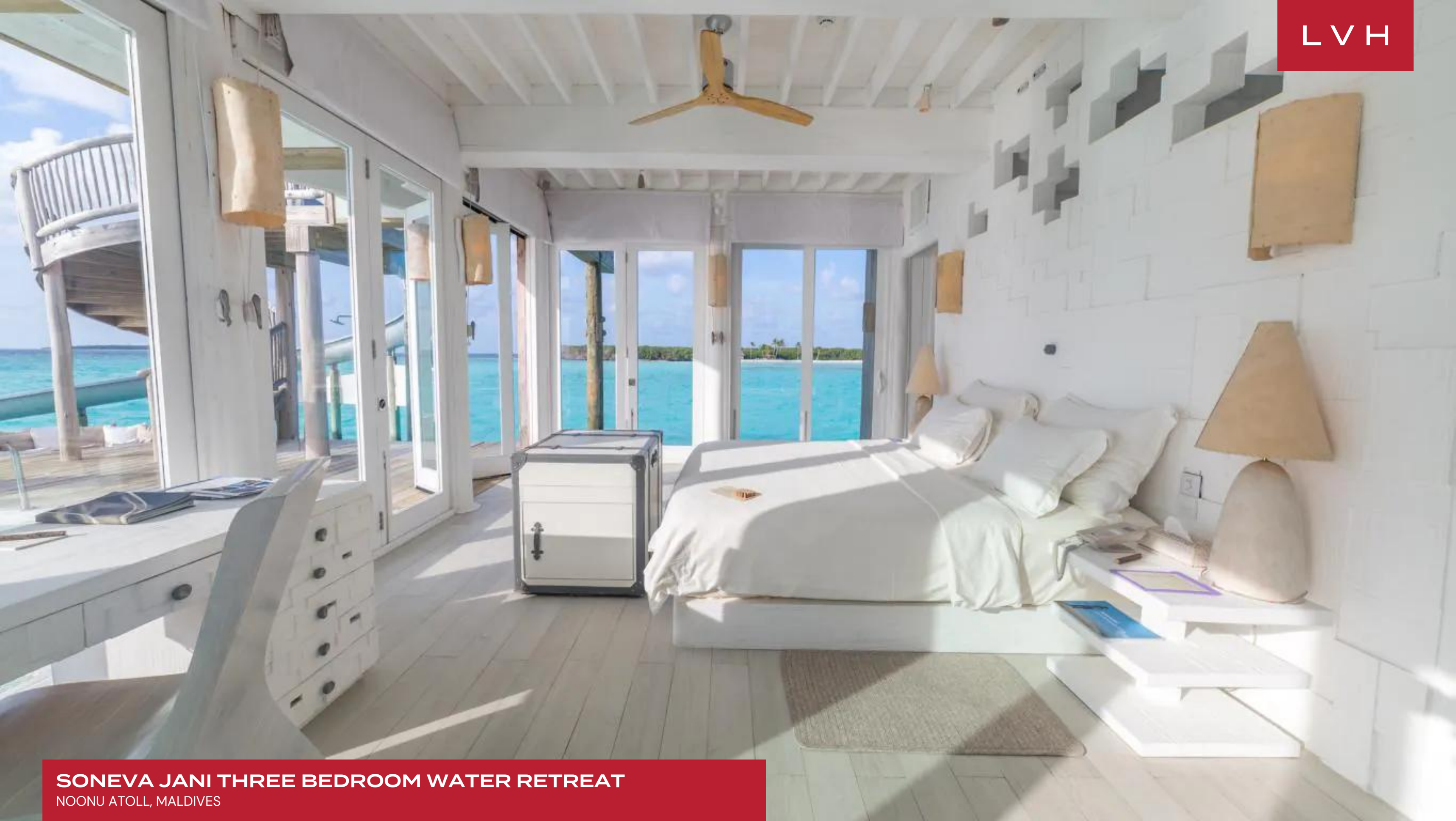
SONEVA JANI THREE BEDROOM WATER RETREAT NOONU ATOLL, MALDIVES