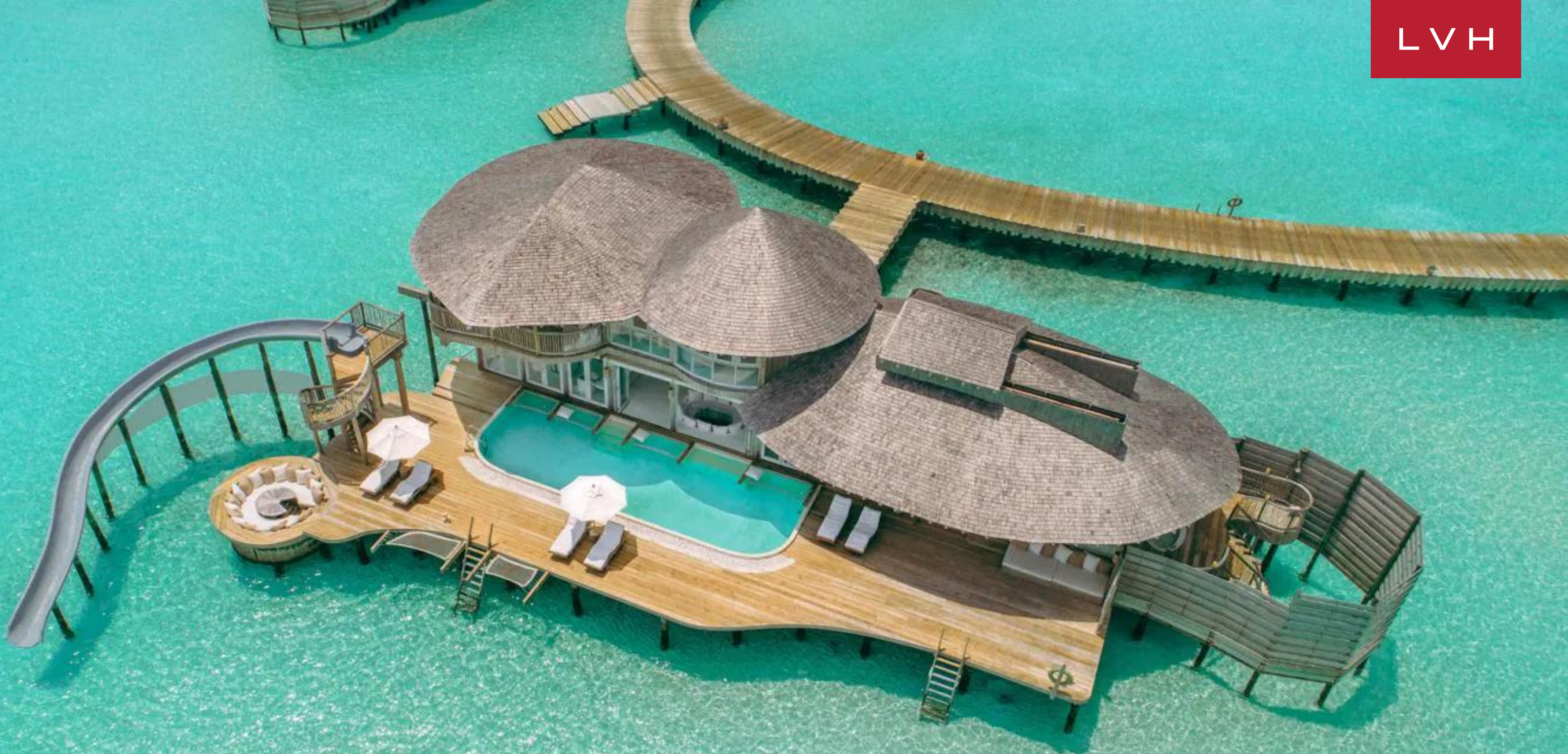
SONEVA JANI THREE BEDROOM WATER RETREAT NOONU ATOLL, MALDIVES