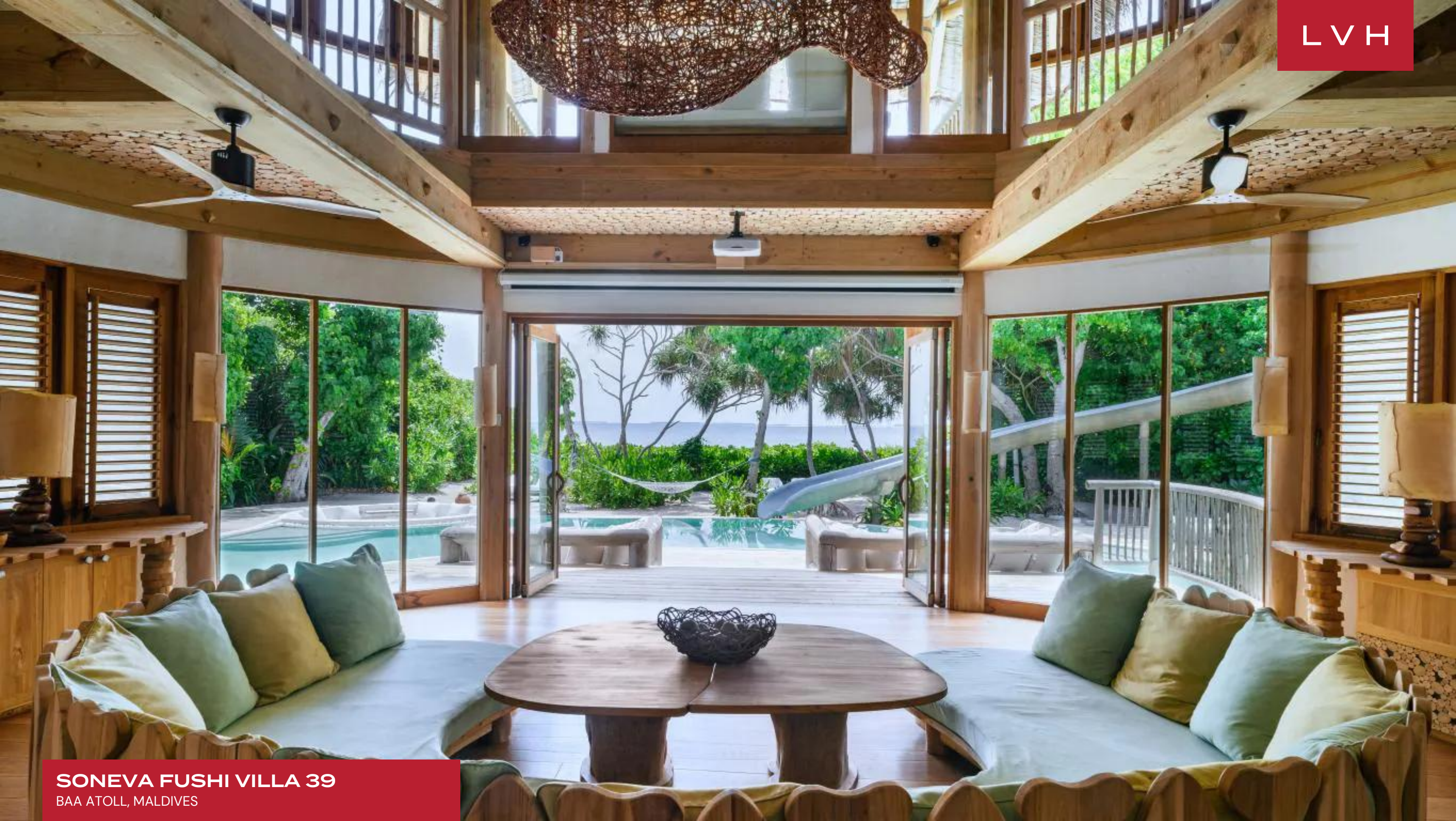
SONEVA FUSHI VILLA 39 BAA ATOLL, MALDIVES