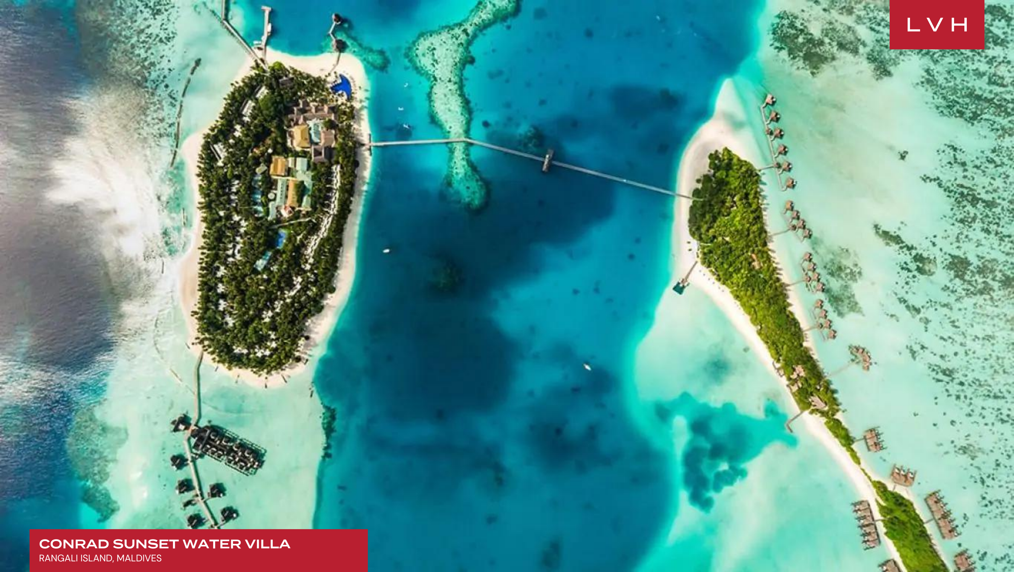
CONRAD SUNSET WATER VILLA RANGALI ISLAND, MALDIVES