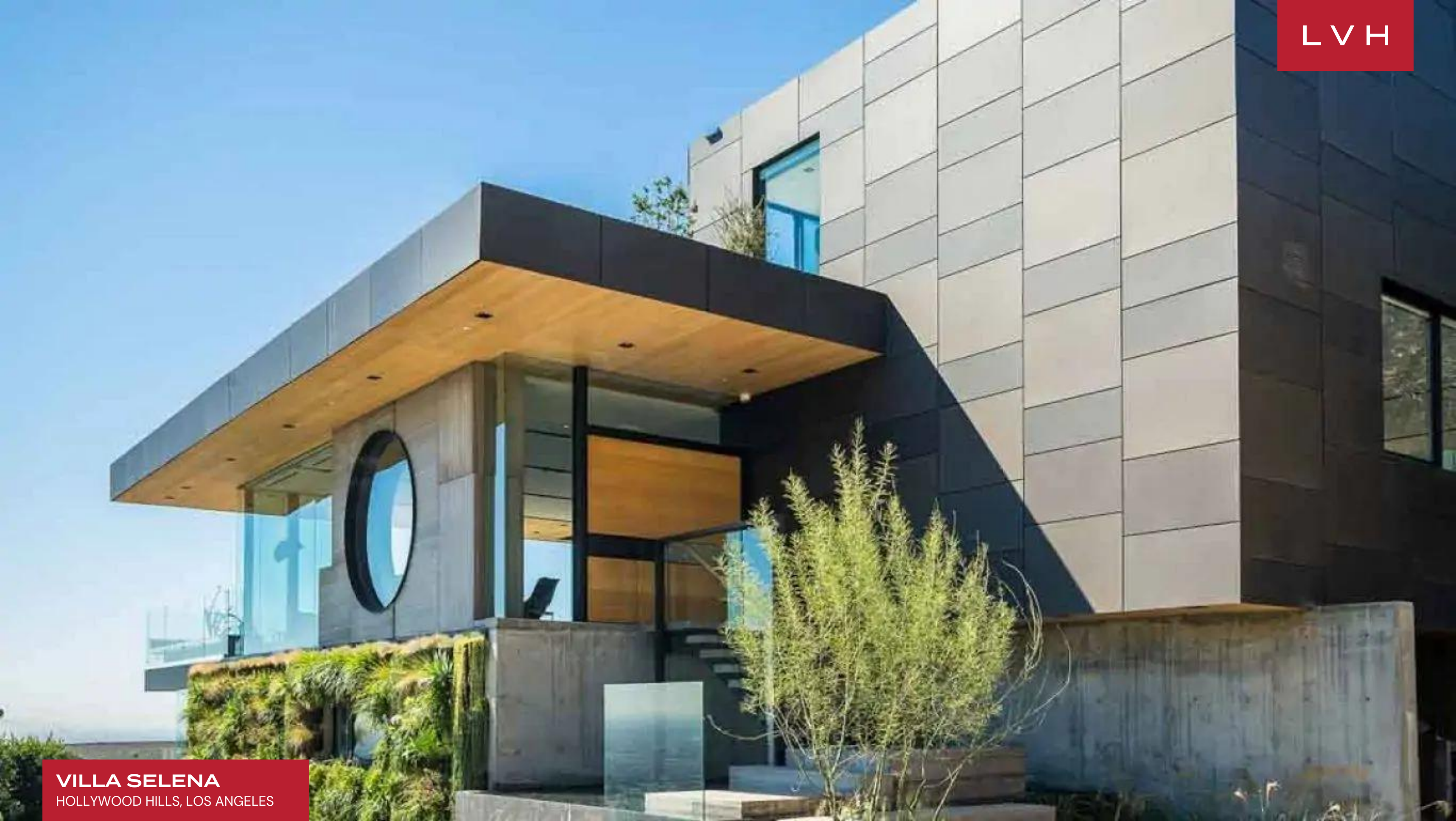
VILLA SELENA HOLLYWOOD HILLS, LOS ANGELES