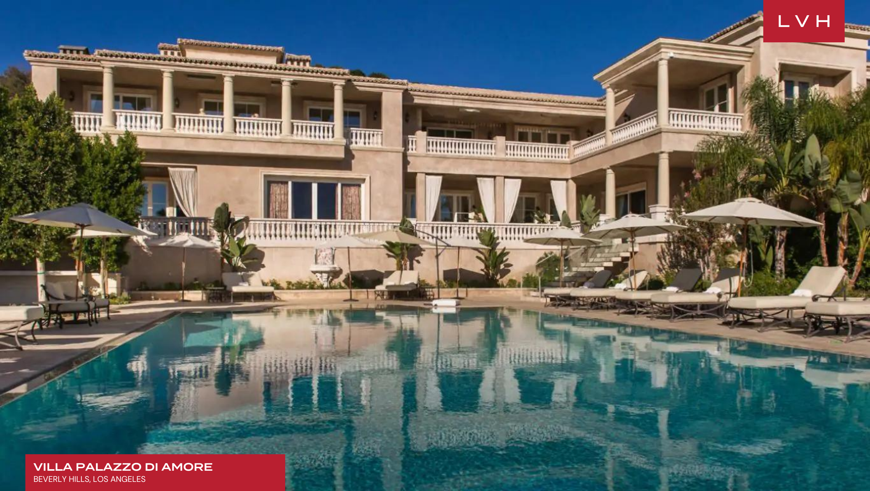
VILLA PALAZZO DI AMORE BEVERLY HILLS, LOS ANGELES