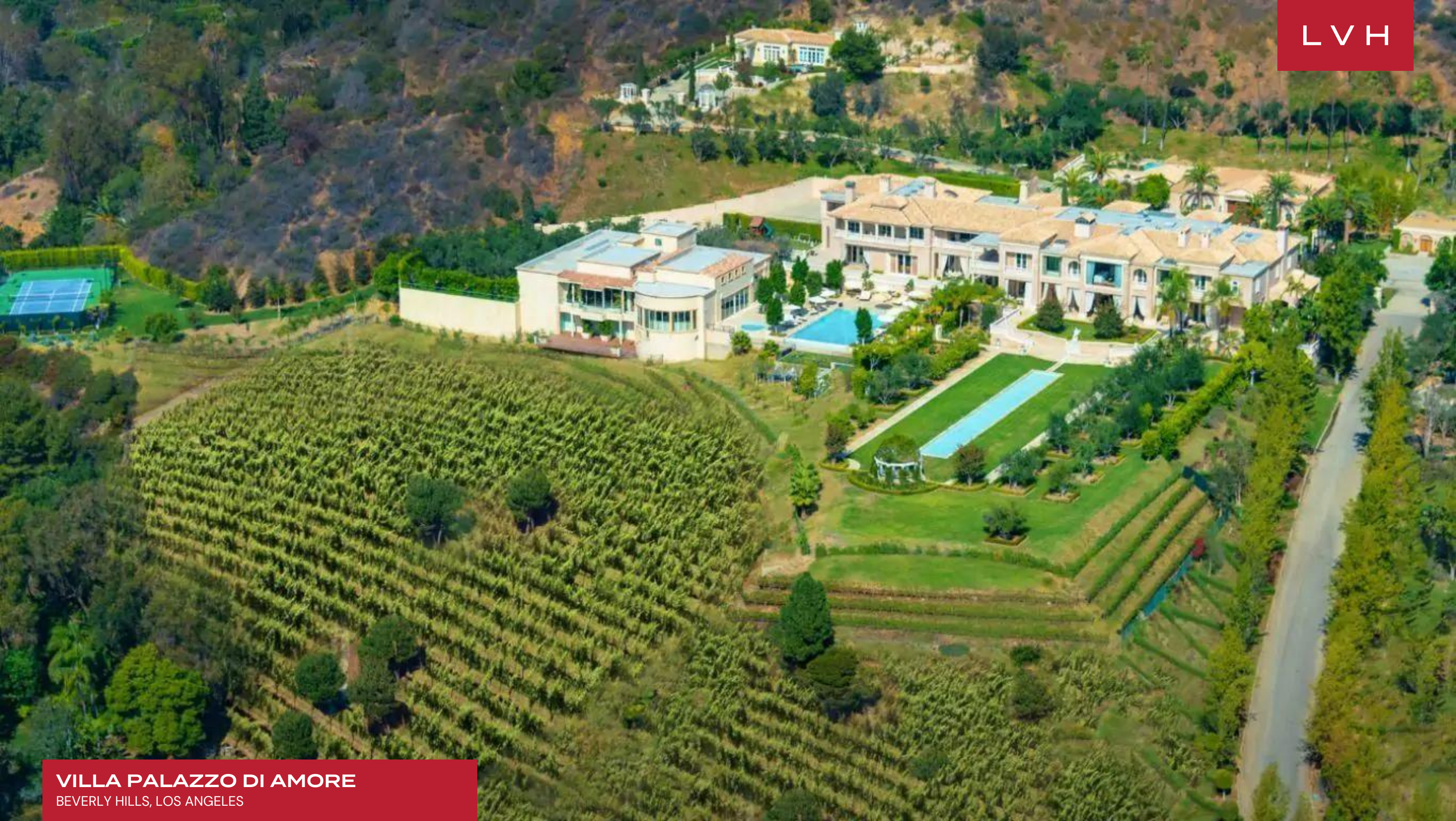
VILLA PALAZZO DI AMORE BEVERLY HILLS, LOS ANGELES