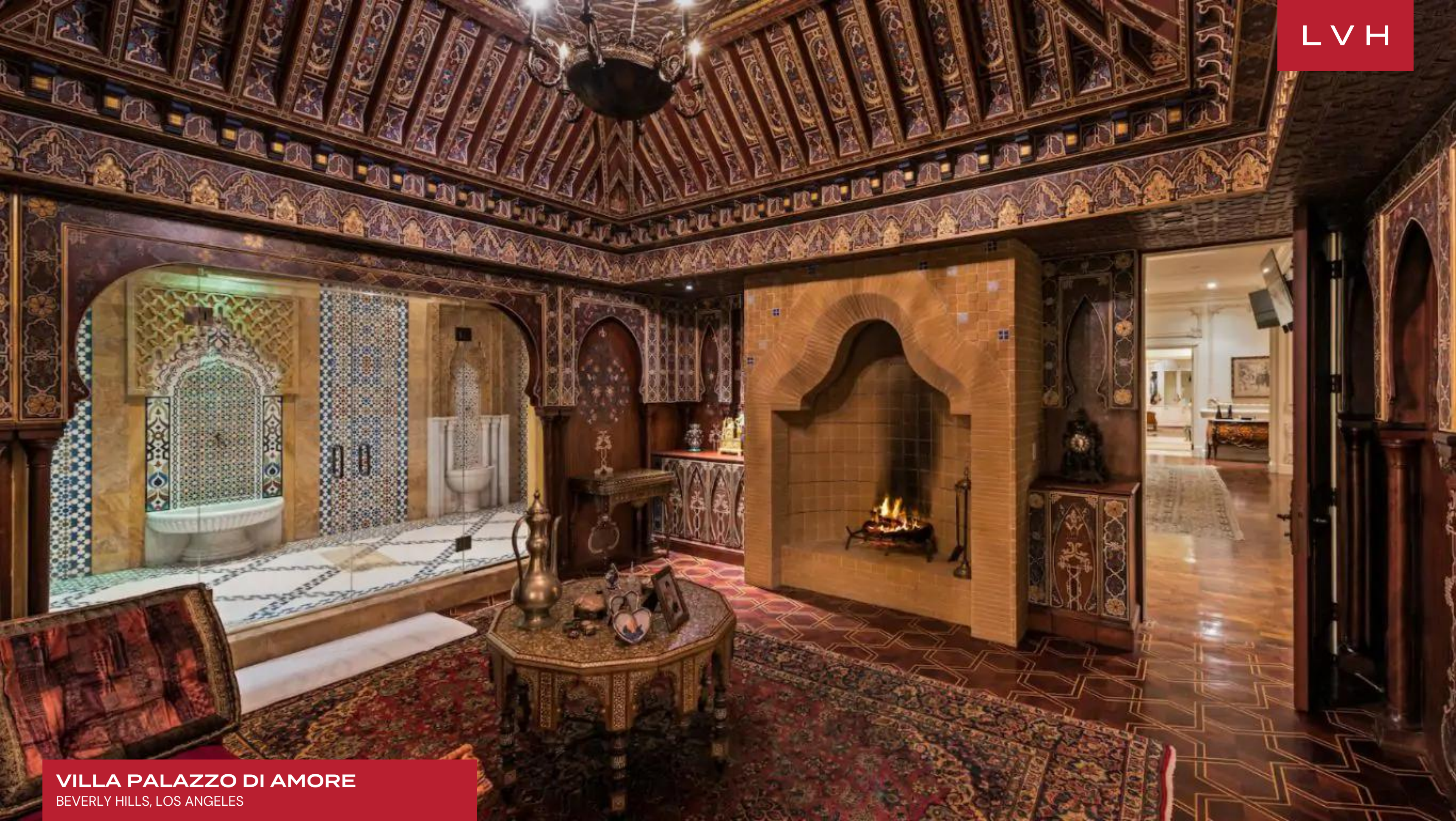
VILLA PALAZZO DI AMORE BEVERLY HILLS, LOS ANGELES