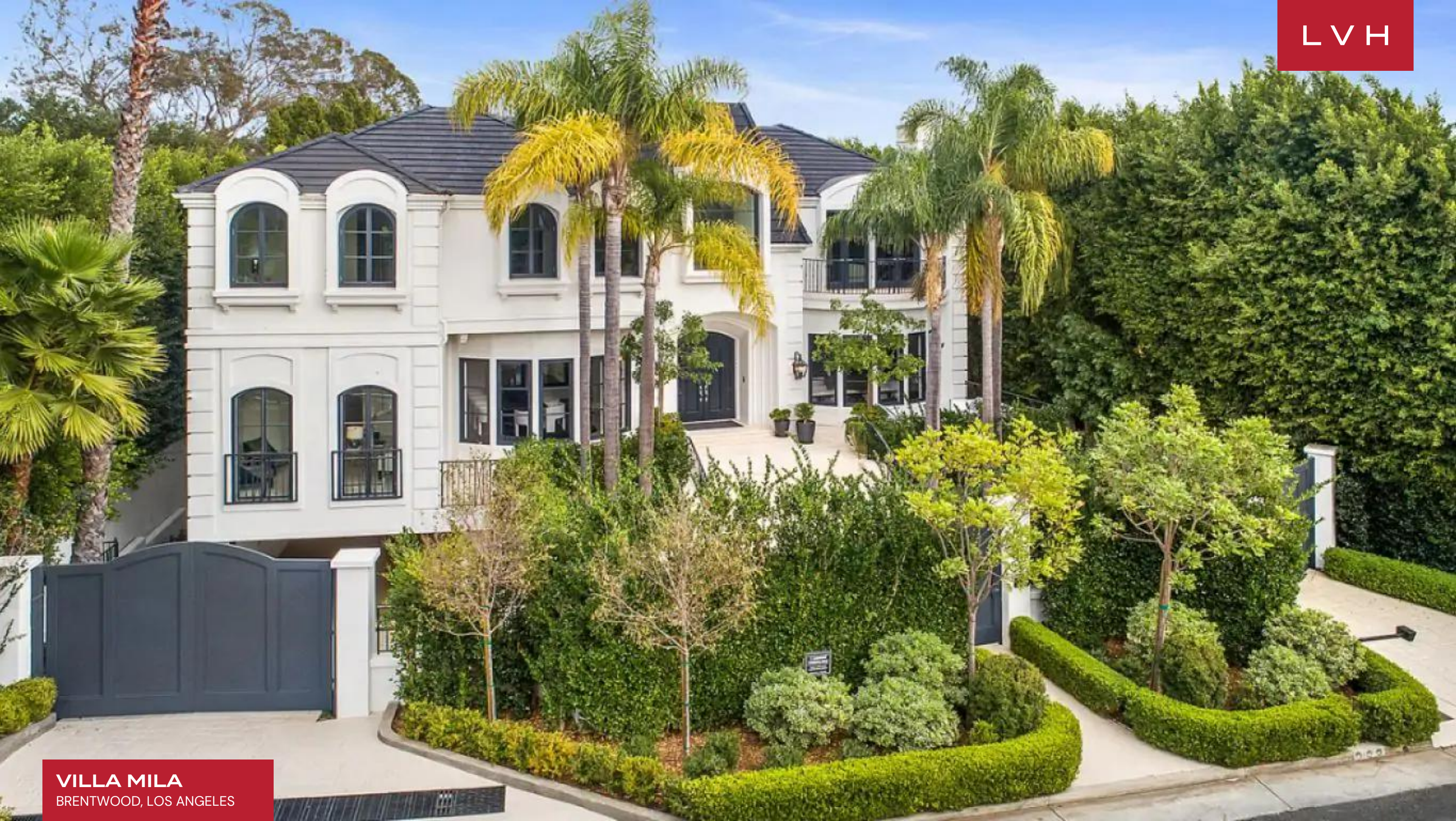
VILLA MILA BRENTWOOD, LOS ANGELES