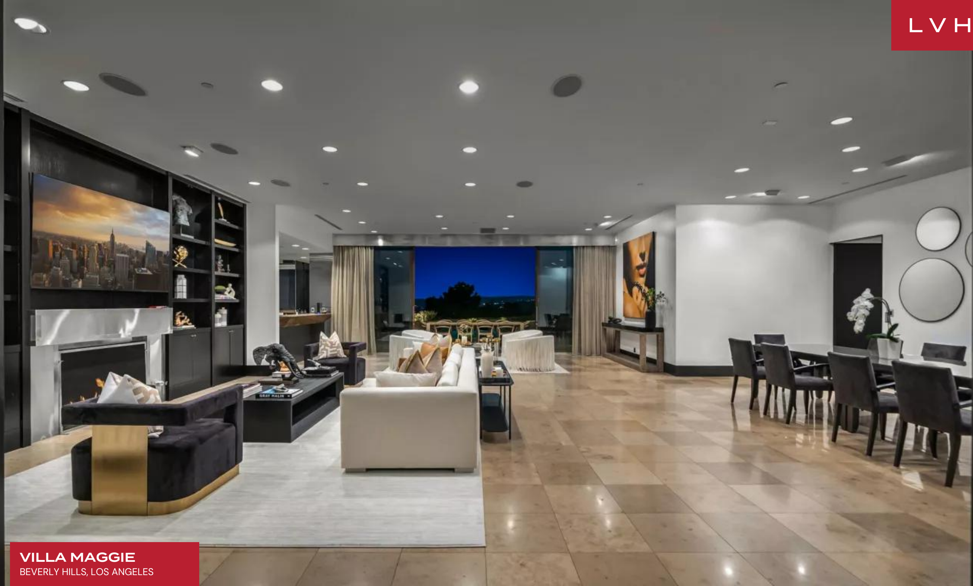
VILLA MAGGIE BEVERLY HILLS, LOS ANGELES